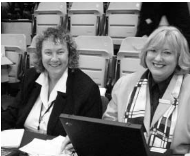
Match Reporters, courtside at a SmokeFree WA State Netball League game