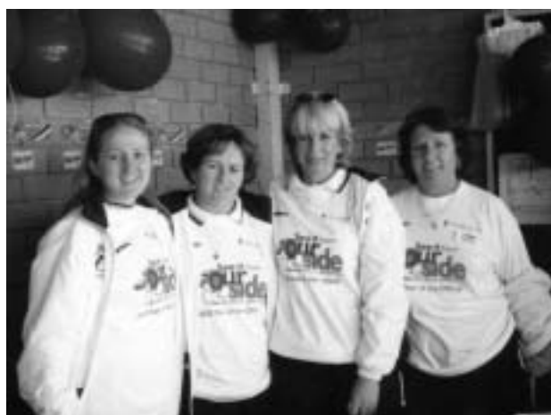
WA Netball Umpires launch the 'See it from our Side' campaign