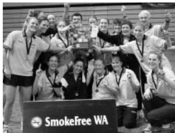
Rangers celebrate their premiership win in the SmokeFree WA State Netball League