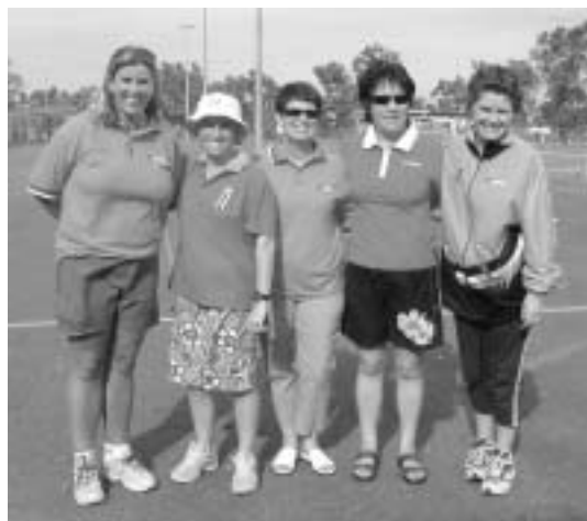
WA Netball personnel attended a Regional Forum in Port Hedland