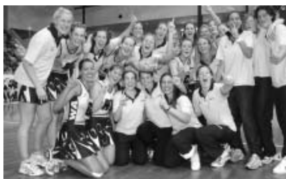
WA Open and 21 & Under teams at the Nationals, celebrating the WA Open team's victory