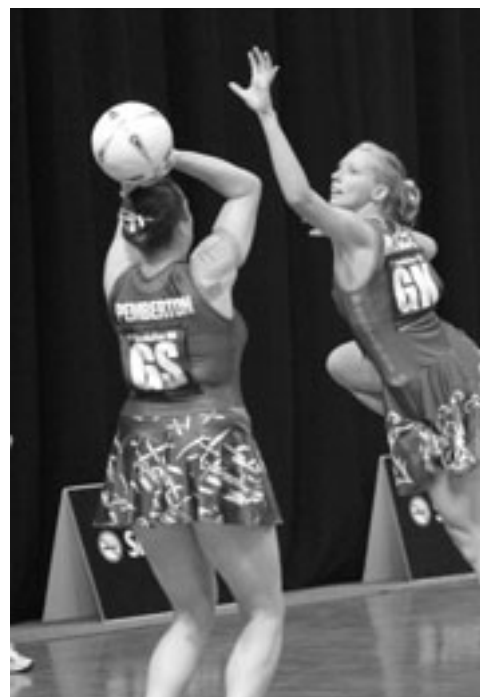
SmokeFree WA State Netball League action