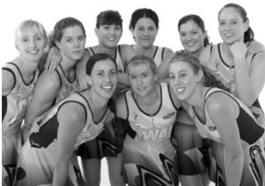
Perth Orioles 2004