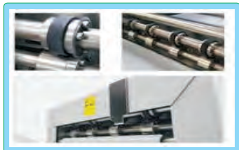
Easy to mount perforating blade