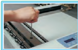
Easy to set crease depth