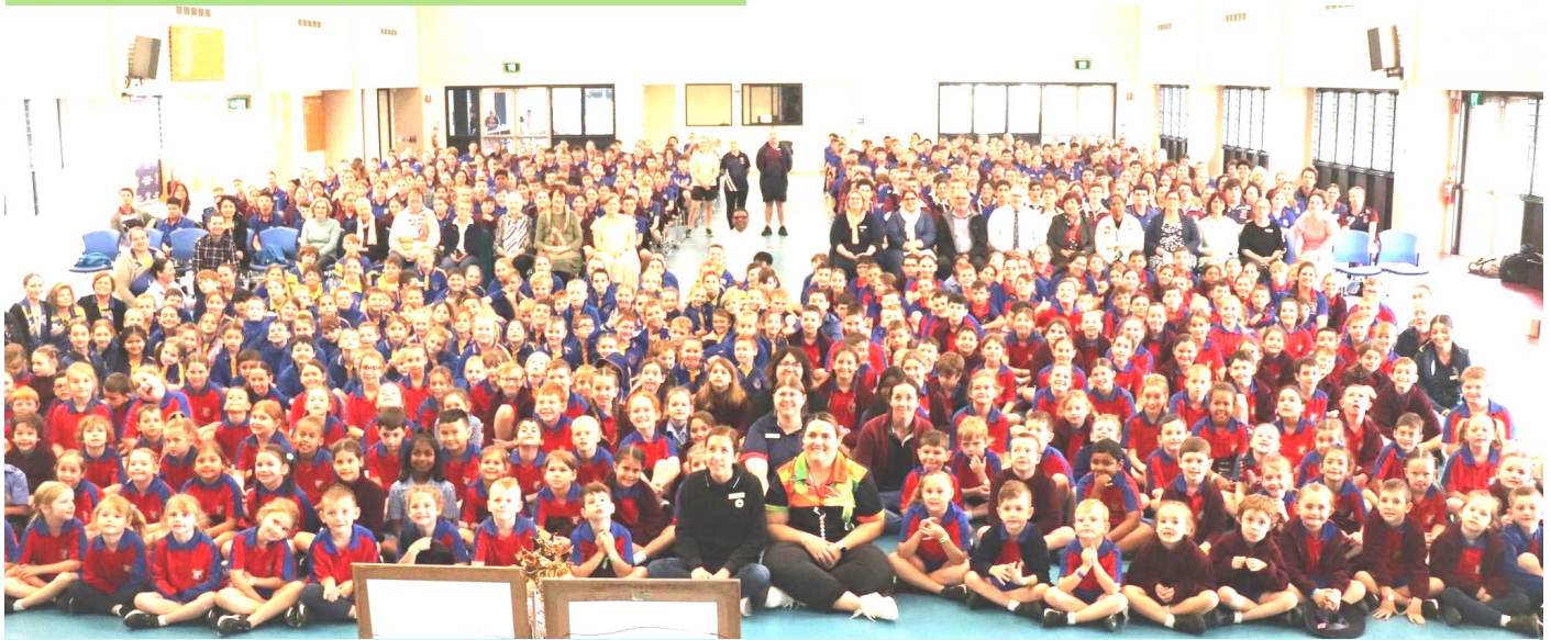
Students and staff members of BCHS, St. Francis and St. Colman's school at the founders day mass.