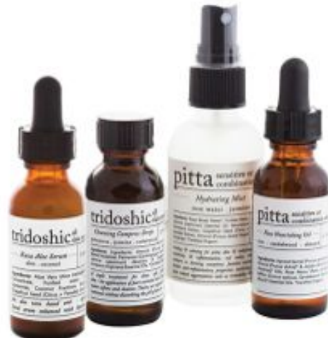
Pitta Starter Kit for Super Sensitive Skin

Balance pitta skin with the application of cooling, calming & natural ingredients found in Rasasara's pitta range.