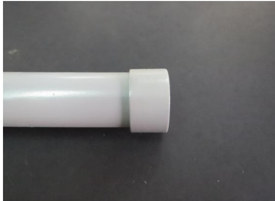
6583 - End Cap