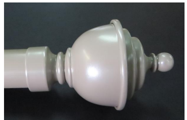
6582 - Minster Finial