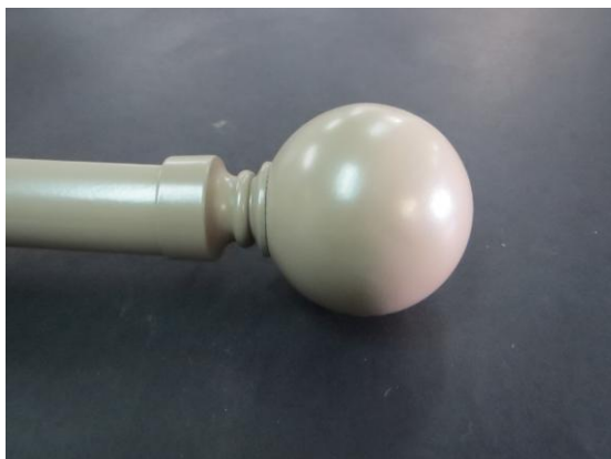
6585 - Ball Finial

Series 65 Finials Colours Available Charcoal Pearl Citi Pearl Nickel Pearl Pewter Pearl Anodised