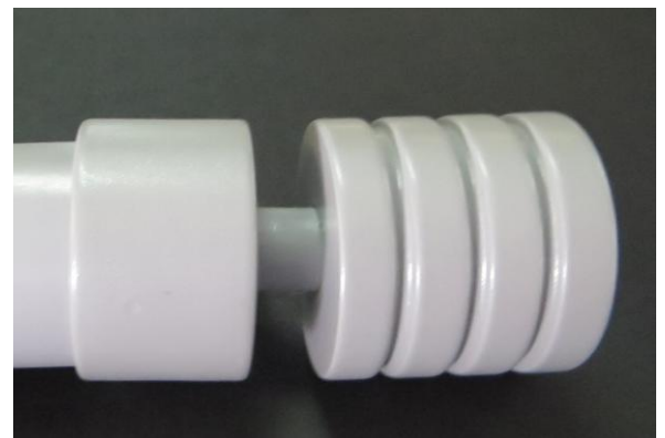
6588 - Ribbed Finial

Series 65 Finials Colours Available Charcoal Pearl Citi Pearl Nickel Pearl Pewter Pearl Anodised