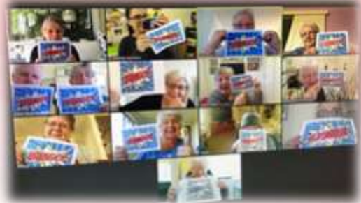
BINGO!!! Craft catch up on Zoom!

Please contact any Ephpheta staff for more information.