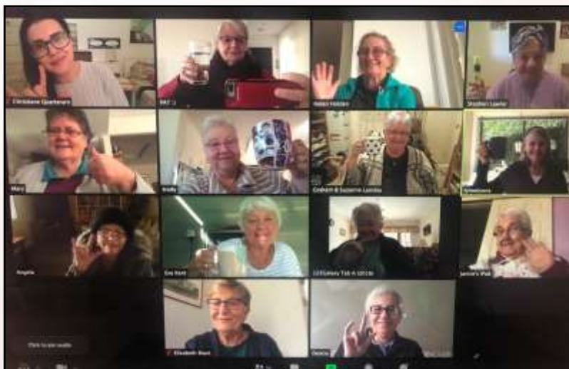
Craft catch up on Zoom!

The Ephpheta team has set up some Zoom chat groups so that we can chat together online. We have deaf friendship groups, craft group, rosary and a prayer group. We need to keep the size of the groups small but all are welcome.