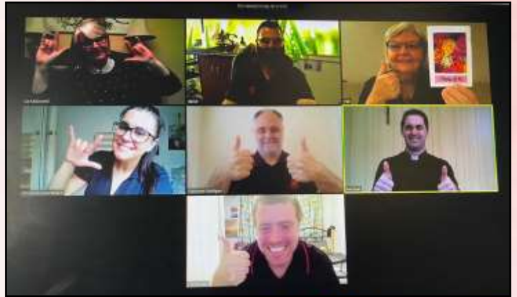
Ephpheta staff meetings on Zoom!

This is a fantastic program you can use to make group video calls and catch up with friends while we can't see each other at the moment. We have prepared instruction sheets on how to download and access Zoom.