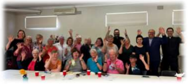
A visit from the Mayor of Strathfield on 9 November!

See below for our Christmas Lunch! It will be a fantastic day!!