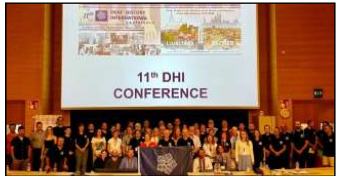
11th Deaf History International Conference in Slovenia

Around 60 people attended the conference over four days and everyone enjoyed each conference talks. 22 countries attended, including Australia, USA, Canada, UK, Japan, Mongolia and many European countries including Ukraine.