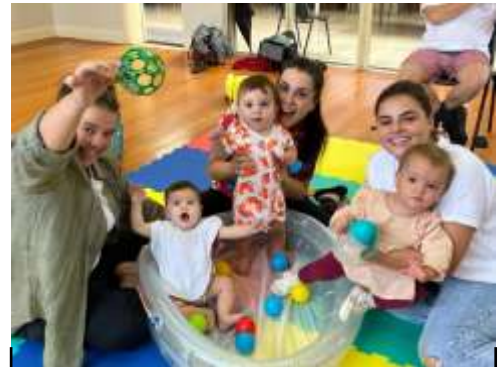
Fun at our March playgroup—happy parents and babies!

Where: Hall, Our Lady of the Assumption Catholic Church, Underwood Rd, Homebush (the parish hall is behind the Church