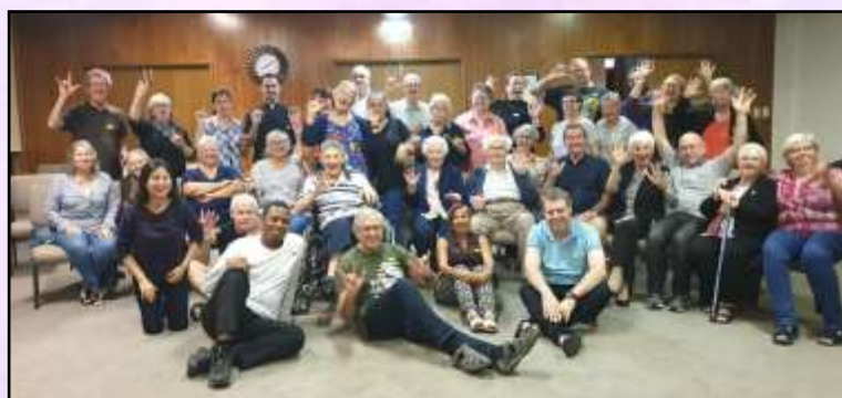
Ephpheta Community Retreat - March 2019

Ephpheta is supporting the costs of the retreat.