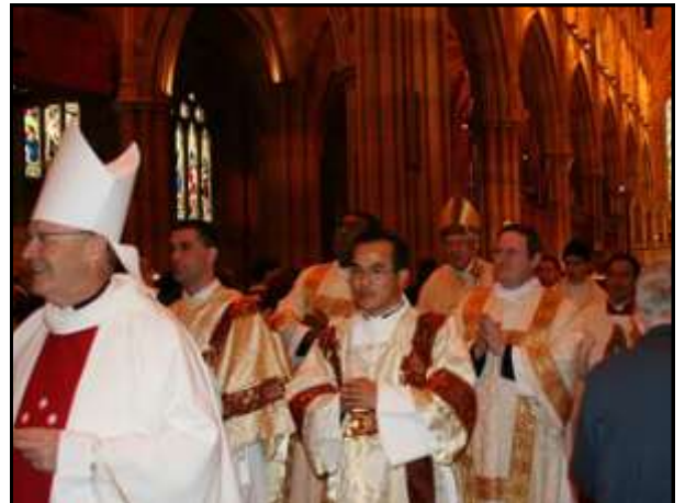
Ordination as a deacon in 2011