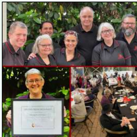
Ephpheta Sunday 2022