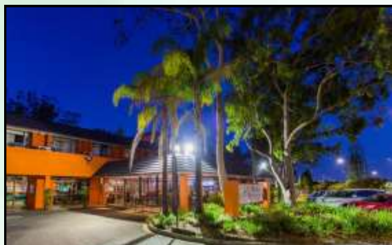
Ephpheta Sunday Celebrations at Markets Hotel, Homebush West