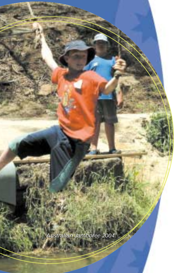
Australian Jamboree 2004.