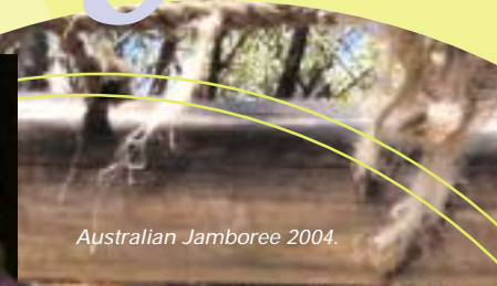
Australian Jamboree 2004.

Diploma levels. These are accessible to trainers through Scouts Australia's intranet, ensuring their currency.