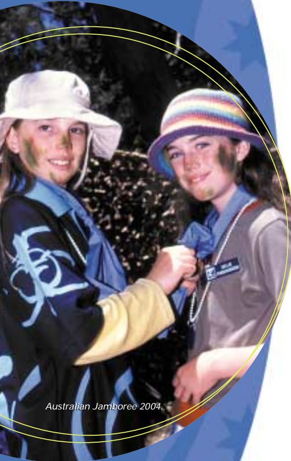
Australian Jamboree 2004.

The following Scouting Members were included in the Queen's Birthday 2003 and Australia Day 2004 Honours.