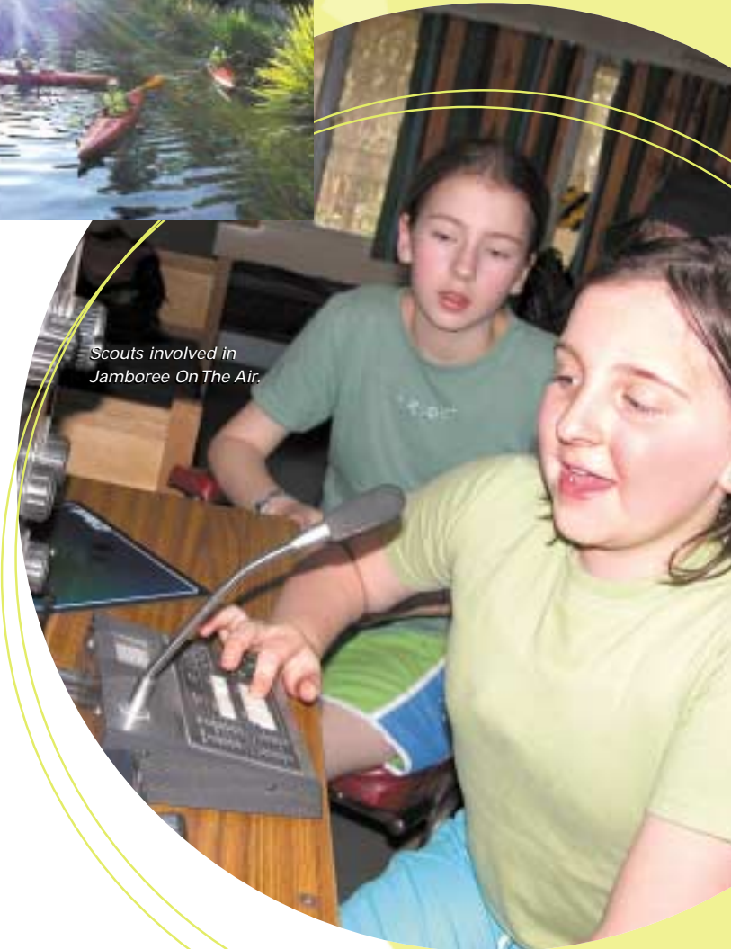
Scouts involved in Jamboree On The Air.

The introduction of more participation badges for the Joey Section is also underway and this includes a special set of four badges aimed at 7 year olds.