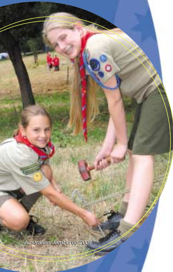
Australian Jamboree 2004.