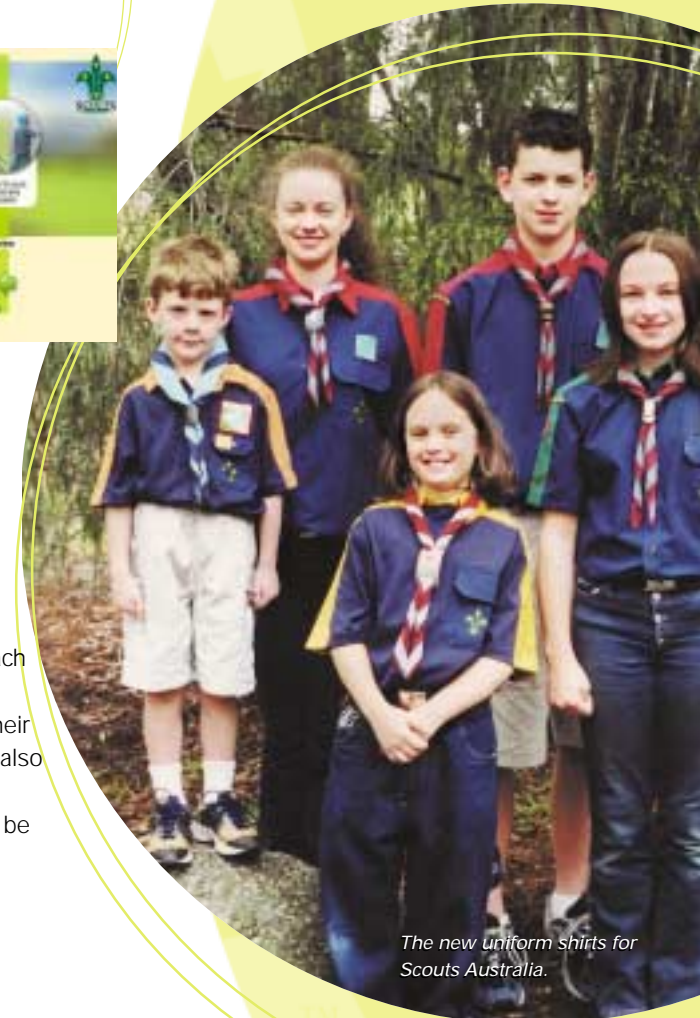
The new uniform shirts for Scouts Australia.