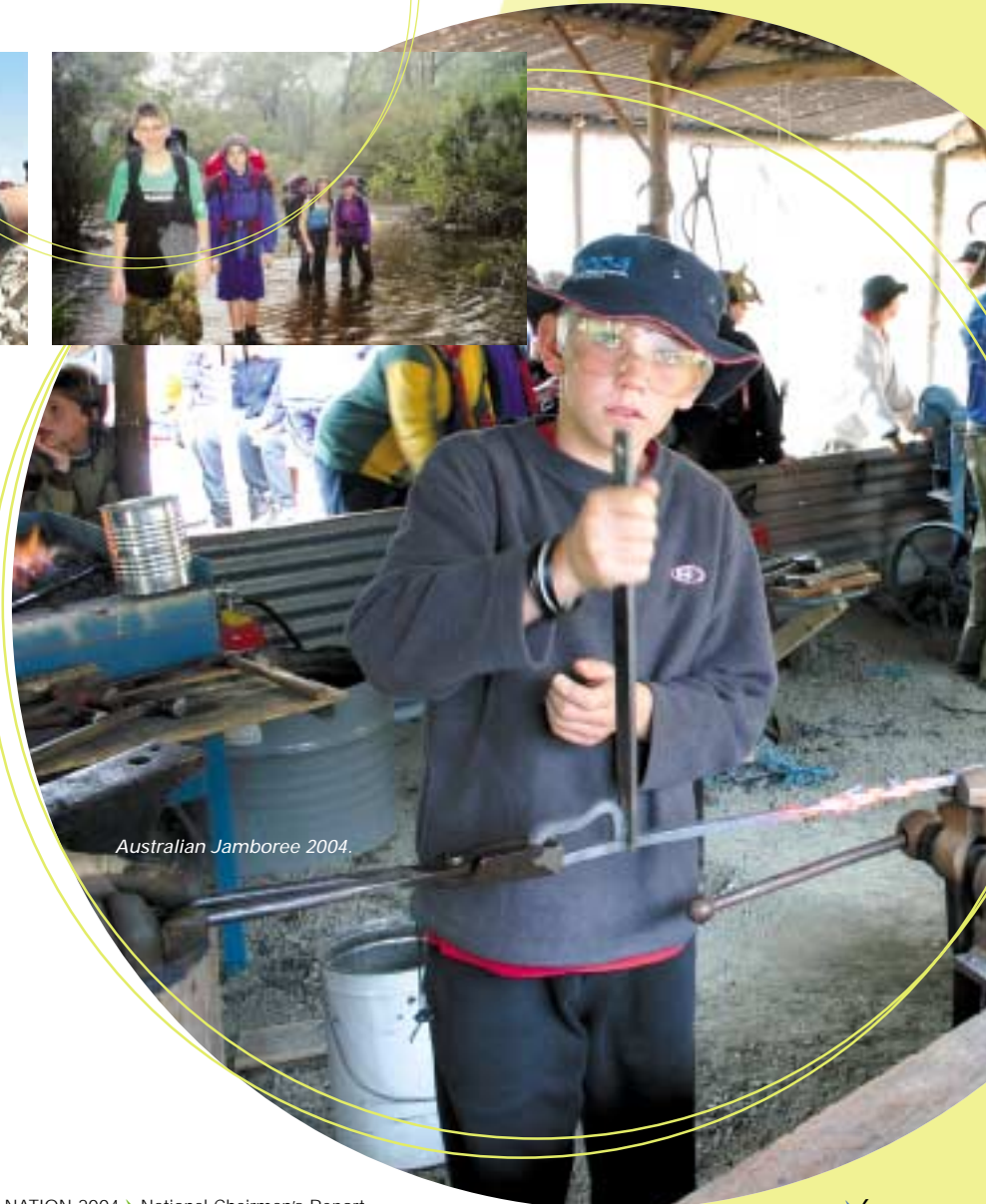
Australian Jamboree 2004.

We are also re-addressing the fundamental aspect of defining the key areas of activity and support that Branches require from the National Association. We are approaching this task with an open mind and lateral thinking as is appropriate in today's world. At the same time we are mindful of the twin priorities of increasing membership and ensuring high quality program delivery and our review will certainly acknowledge their importance.