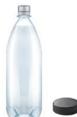
RECYCLED BOTTLE WITH CAP