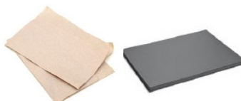
BLACK PAPER TISSUE PAPER