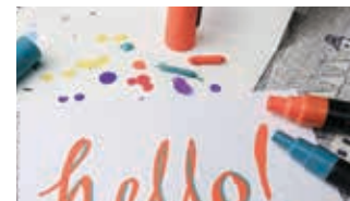
Tips can be removed and washed