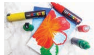
Can be layered