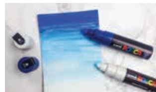
Mix to create custom colours