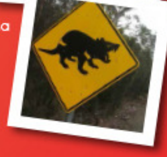
Proposed stopovers. Dates subject to change.