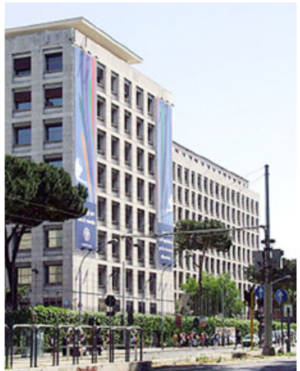
FAO headquarters in Rome

security policies. In 2009 a reform of CFS was made to ensure that not just government delegations but a broad inclusive range of stakeholders were heard in the debate on food security and nutrition. And so there are full participatory voices from civil society organizations and movements, the private sector movement, other intergovernmental organizations, observers from NGOs, educational institutions and groups like our ICR. This year a record number of more than 1500 participants were registered. The five day event presents a rich diversity of food security and nutrition topics. And the CFS is a 'living' committee. That is, its work continues throughout the year through such means as online discussions and development of policies. Open ended working groups (OEWG) also meet periodically and work to bring to completion the various 'working streams' of ongoing issues. There are also meetings held in Regional and National Offices and events. The government delegation representatives have responsibility to endorse completed documents each October at the CFS annual Session at FAO headquarters in Rome.