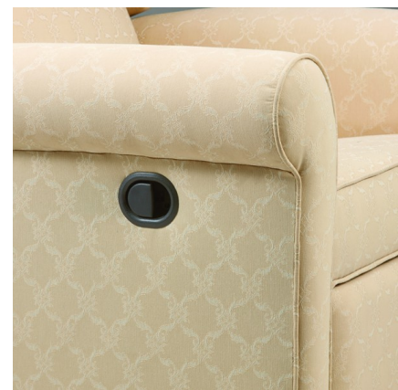
Conveniently Placed Recliner Lever is Ideal for Seniors