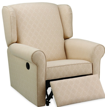
Standard Recliner Wall Saver Design