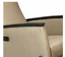
Soft Touch Poly Arm Caps