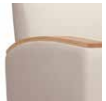
Optional Wood Arm Caps