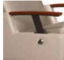
Adjustable Arm Heights