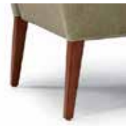
Optional Medium Leg Length Style