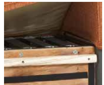
Steel Reinforced Frame *The key behind our Lifetime Warranty