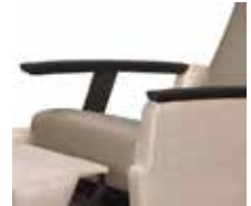
Soft Touch Poly Arm Caps

REPLAY LAYFLAT MEDICAL RECLINER *Also available in Revival and Evolve Styles.