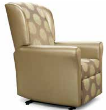
Recliner shown with Wing Back Design