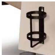
O2 Tank Holder