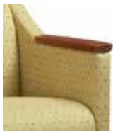
Optional Wood Arm Caps