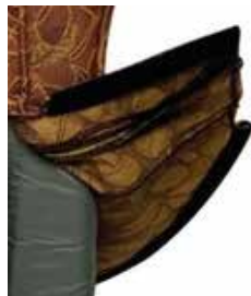
Fully Serged Seams *Avoid fraying during laundering