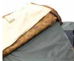
Antimicrobial Moisture Block Protection *Stops all moisture penetration