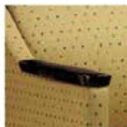
Optional Soft Touch Poly Arm Caps