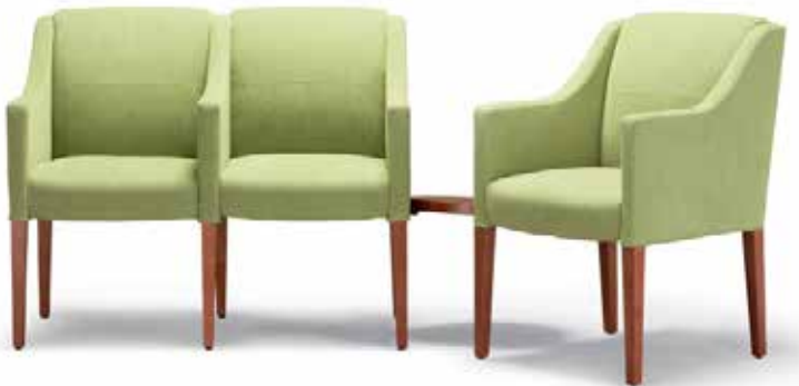
GROUP SEATING *Available in many configurations