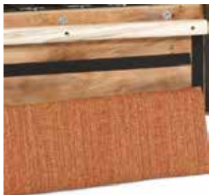
Velcro Attached Upholstery *Convenient cleaning and replacement