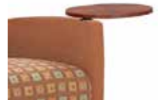
Optional Swivel Tablet Arm