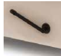
Layflat Recline Lever