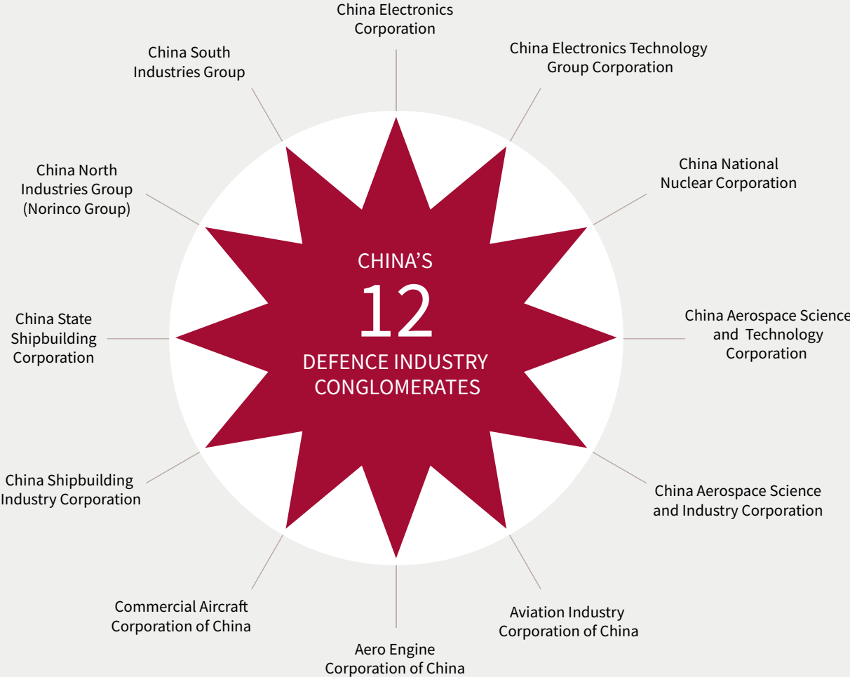
Figure 3: China’s twelve Defence Industry Conglomerates