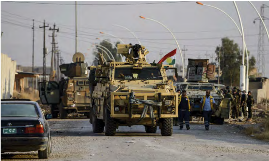
Peshmerga and British troops in a Bushmaster patrol the town of Bashiqa, just north of Mosul, in November 2016, during operations to recapture Iraq's second-largest city. In 2008, Britain bought 24 Bushmasters for use by its special forces, who know the Australian-built vehicle as the 'Escapade'. Modifications include the addition of a bull bar.