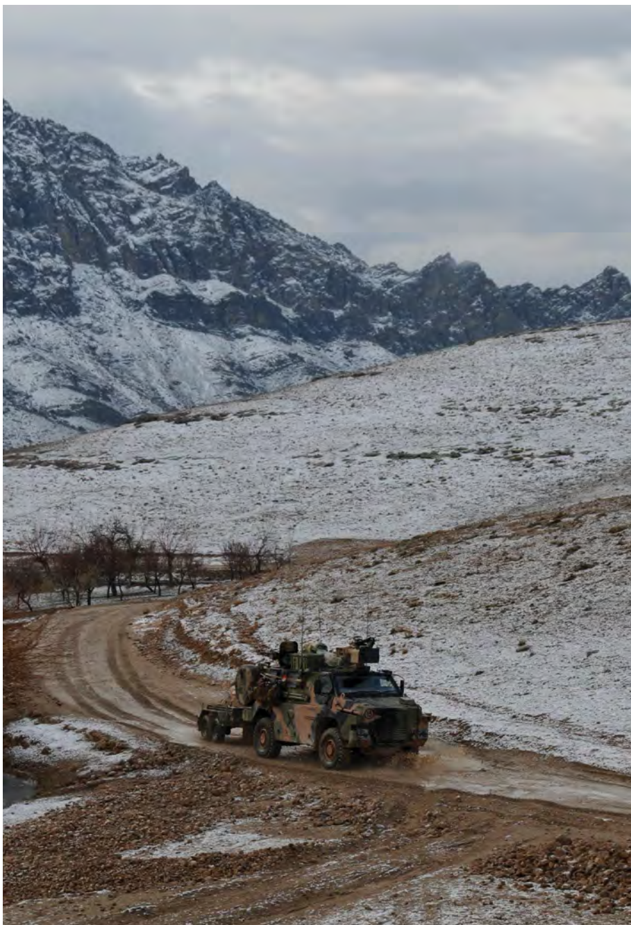
A Bushmaster from Australia's 1st Mentoring and Reconstruction Task Force splashes its way along the main road in the Baluchi Valley in southern Afghanistan in January 2009. Sleet and rain made the Afghan landscape a boggy quagmire in winter.