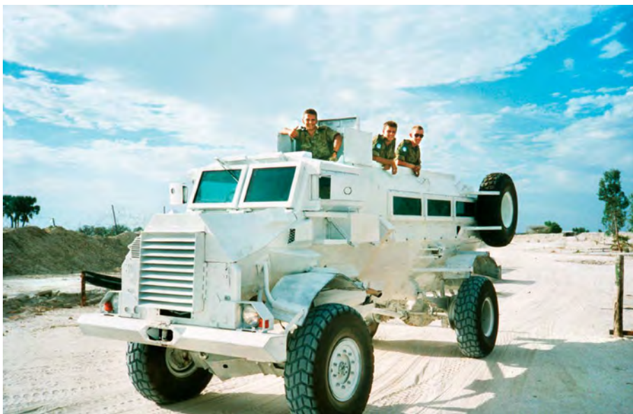
Australian members of the United Nations Transition Assistance Group aboard a South African-built Casspir armoured personnel carrier in Ondangwa, Namibia, in November 1989. Note the V-shaped hull.