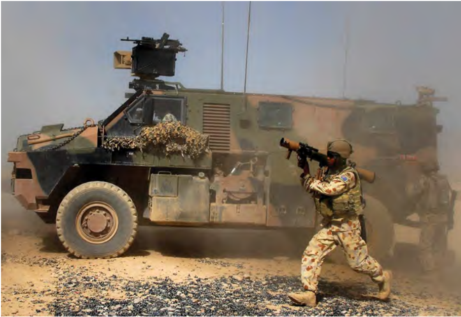
A soldier dismounts from a Bushmaster to fire an 84 mm rocket launcher on the Camp Holland range, Tarin Kowt, Afghanistan, in July 2007.