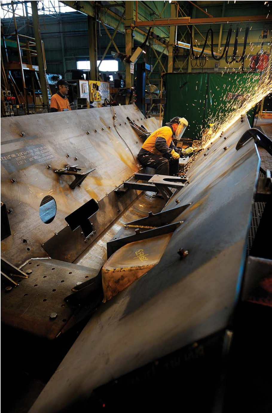
Building the Bushmaster from the V-shaped hull up at the Thales plant in Bendigo, Victoria.