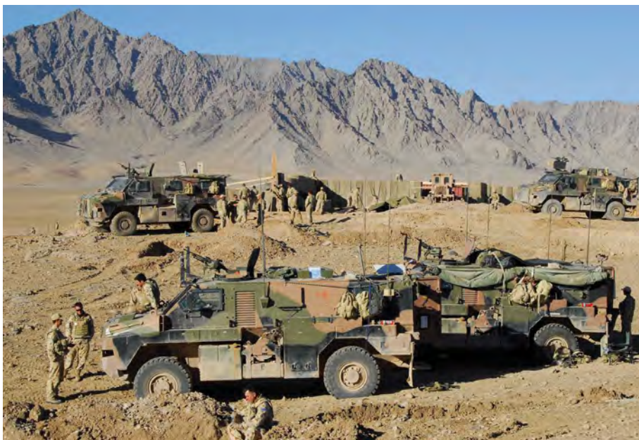
Bushmasters surround the construction site of a checkpoint near the mouth of the contested Baluchi Valley in southern Afghanistan in February 2008. Australian infantry, cavalry and combat engineers fought off repeated insurgent attacks as the project progressed.