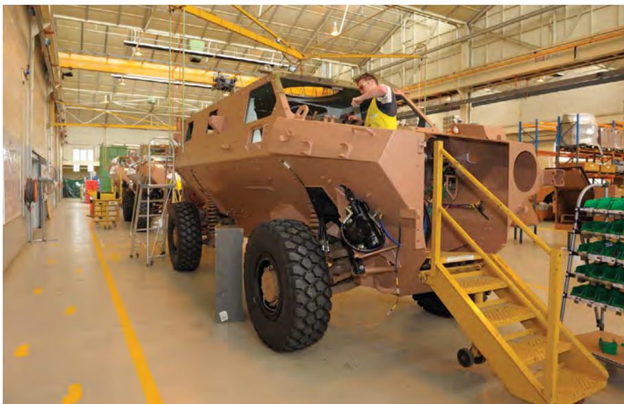
The V-shaped hull and monocoque construction are apparent on this Bushmaster under construction at the Thales plant in Bendigo, Victoria.