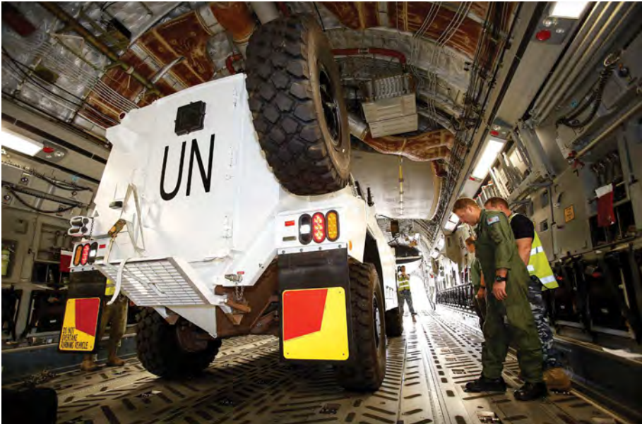
A Bushmaster is loaded onto a C-17 Globemaster at RAAF Base Amberley in southeast Queensland in March 2017 for delivery to Fijian peacekeepers on the Golan Heights. The giant transport aircraft can carry five Bushmasters, three Blackhawk helicopters, or up to 75 tonnes of equipment and supplies.