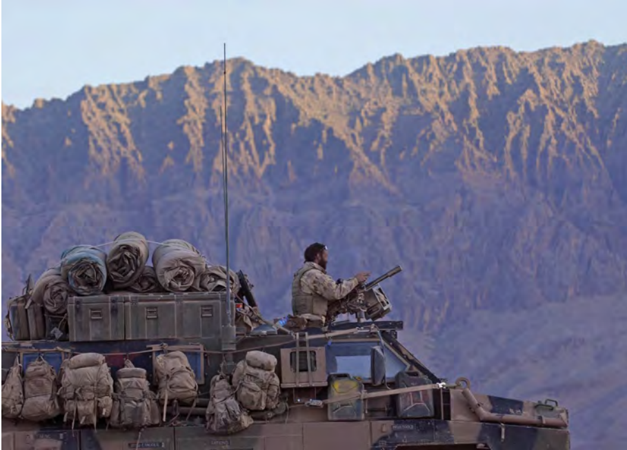
One of several Bushmasters from the Special Operations Task Group during a counterinsurgency operation in Afghanistan's northern Uruzgan Province in November 2009.