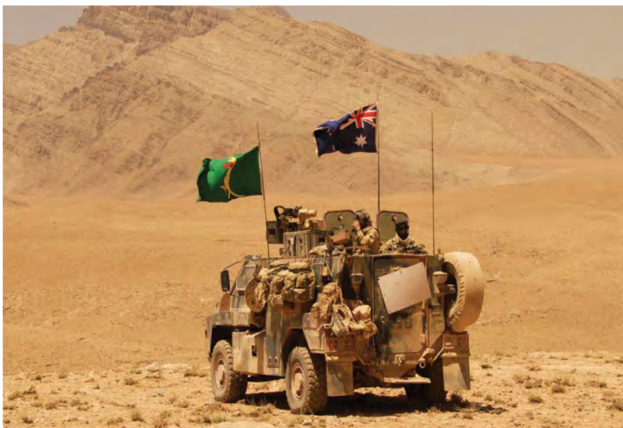
An Australian Bushmaster on patrol in Afghanistan's Uruzgan Province provides overwatch for a reconstruction task force in July 2008. The task force built a series of patrol bases for coalition and Afghan security forces.