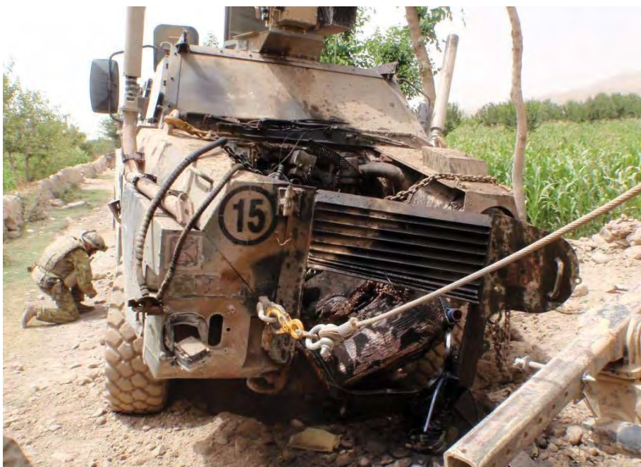
Soldiers retrieving a Bushmaster hit by a large bomb in Afghanistan.