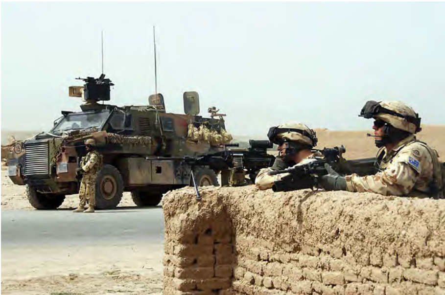
Australian soldiers at a roadblock on the outskirts of Tarin Kowt, Afghanistan, in July 2007 as a search operation takes place in the town.