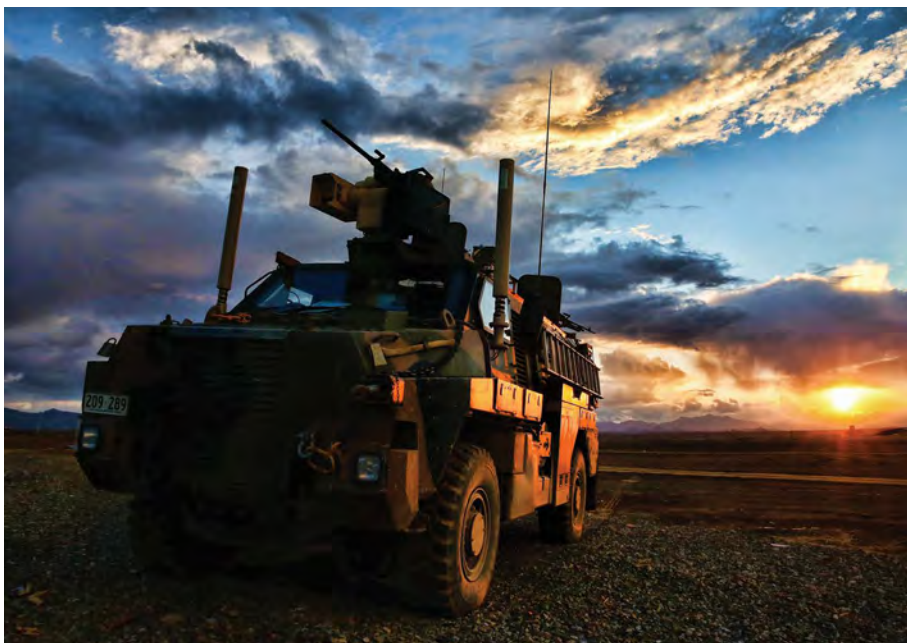
A 2nd Cavalry Regiment Bushmaster near the Australians' base at Tarin Kowt, Afghanistan, during a patrol in November 2013.