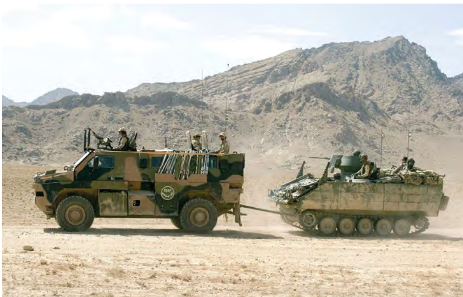
Wheels versus tracks? A Dutch Bushmaster towing a YPR near Tarin Kowt, Afghanistan, in August 2007. The YPR is an upgraded version of the American M113 armoured personnel carrier used by the Dutch forces.