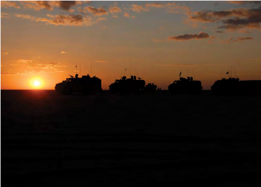
Bushmasters of Australia’s Overwatch Battle Group cross the Ad Dibdibah Desert in Iraq’s Al Muthanna Province in January 2007.