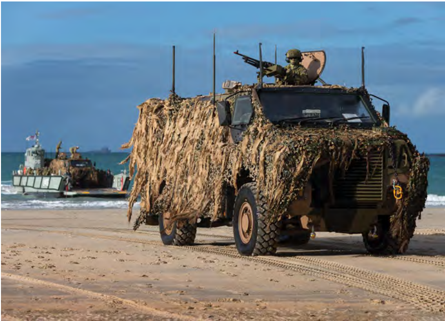
Bushmasters landing during an amphibious assault on Langham Beach in north Queensland during Exercise Talisman Sabre in July 2017.