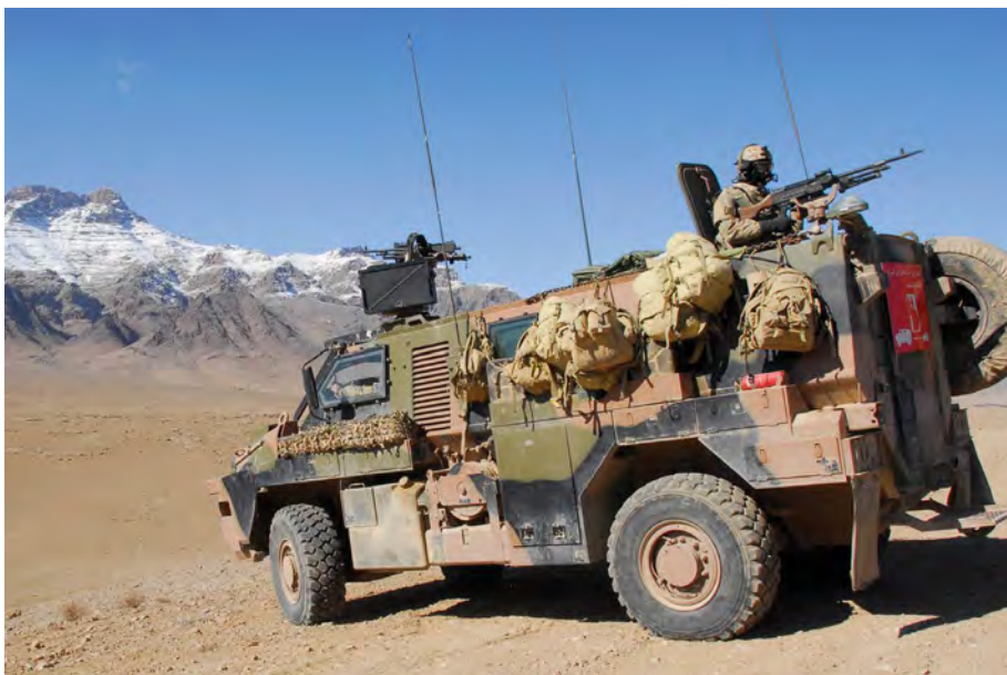
A Bushmaster from Reconstruction Task Force Three in Afghanistan's Chora region in February 2008. The Australians and a contingent from the Afghan National Army built the ANA a forward operating base.