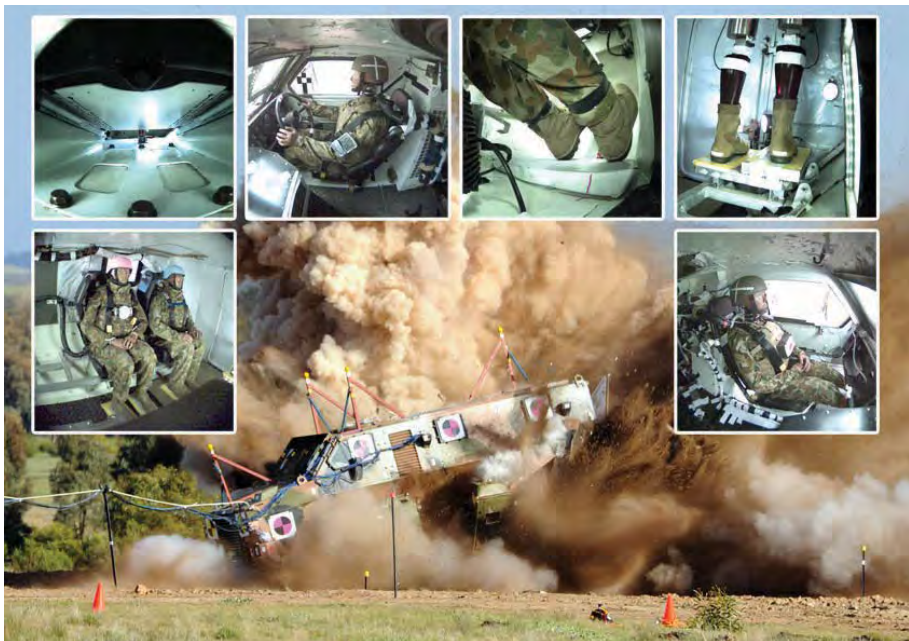
A Bushmaster that had seen action in Afghanistan, and its crew of military crash-test dummies, were selected for a violent experiment, designed by Defence scientists and Thales engineers, to examine the likely impact of a bomb on the vehicle and the soldiers aboard it.