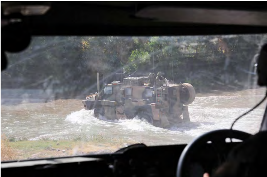
Bushmasters ford a river in Afghanistan’s Mirabad Valley in June 2012. The vehicles were part of a convoy visiting patrol bases Musazai and Hamid.