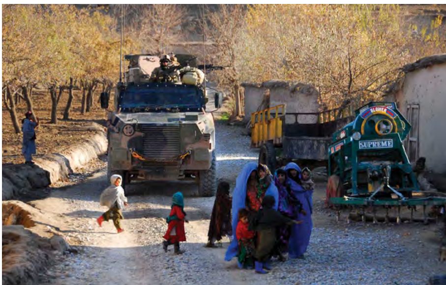
An Afghan family crosses ahead of a Bushmaster patrolling in Afghanistan's Chora Valley in December 2008. The troops from Australia's 1st Reconstruction and Mentoring Task Force worked on schools, health facilities and government buildings.