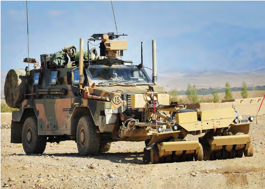
A Bushmaster with a self-protection adaptive roller kit (known as a ‘SPARK roller’) clearing roads of improvised explosive devices near Tarin Kowt, Afghanistan, in November 2012.