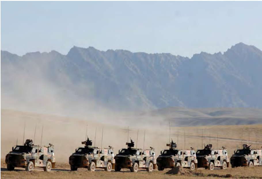
A Bushmaster convoy on the move in Uruzgan Province, Afghanistan, in April 2007.