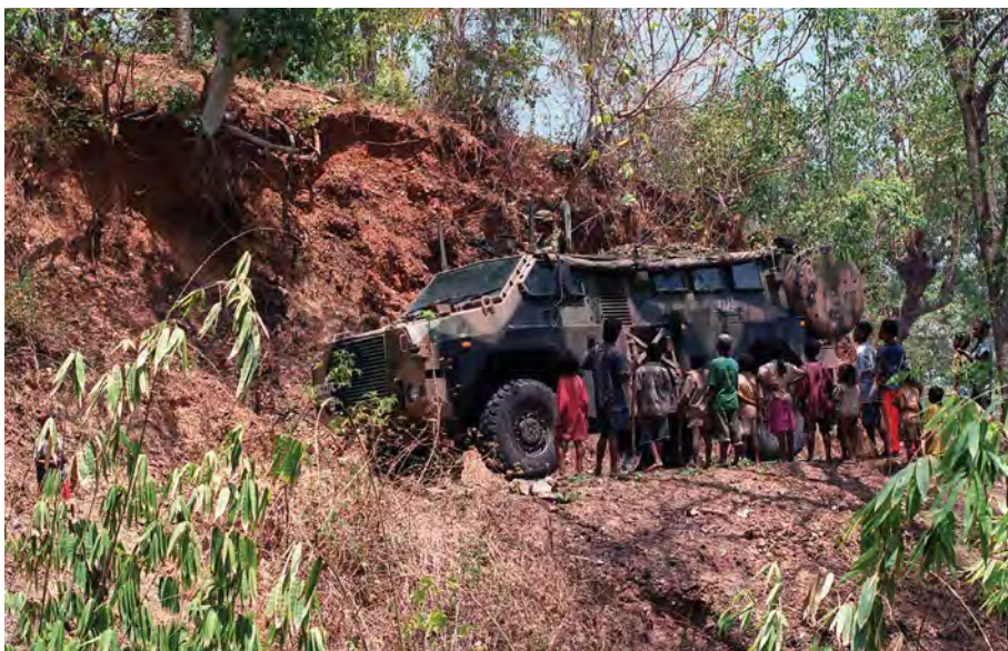
Bushmasters were sent into harm's way long before they were officially cleared for operations. Two prototypes—B1 and B3—were sent to East Timor in 1999, during Operation Stabilise, as convoy escort and VIP protection vehicles. While proving sturdy and reliable, they also did much less damage to farmers' fields and fragile roads than tracked vehicles. The third vehicle in this early trio, B2, was destroyed during blast testing.