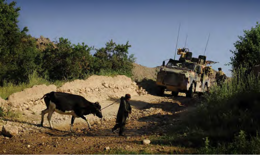
A Bushmaster, flanked by soldiers from Australia's 1st Mentoring and Reconstruction Task Force, patrols through the Baluchi Valley in southern Afghanistan in May 2009. A joint force of Australian, Dutch and Afghan troops searched for weapons caches during Operation Mani Ghar.