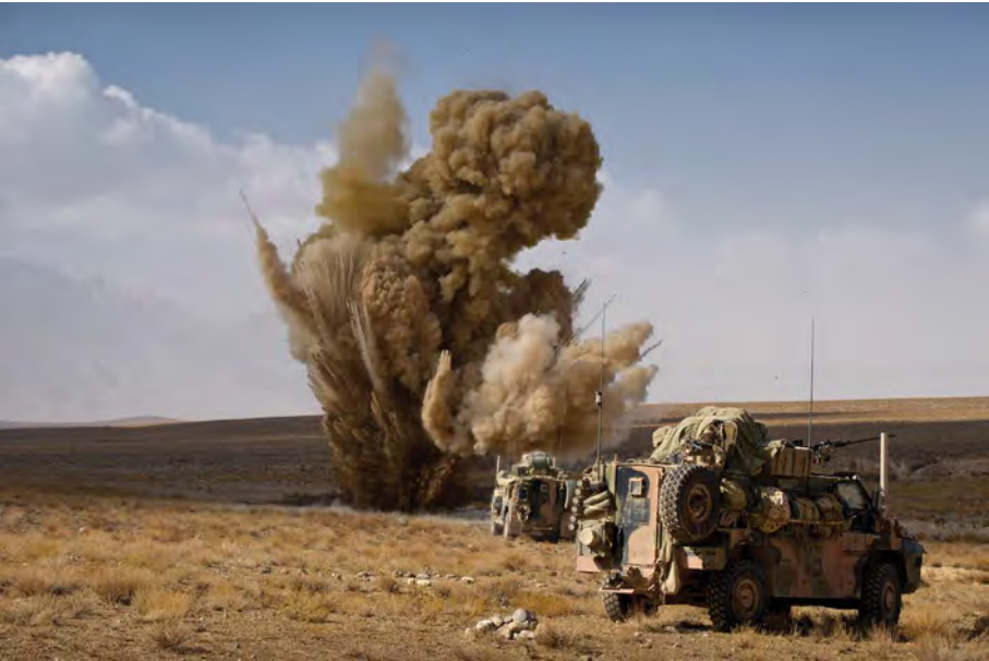
Vehicles are dwarfed by the blast as an Australian Special Operations Task Group patrol, mounted in Bushmasters, triggers a controlled detonation of one of 16 improvised explosive devices uncovered as it cleared a path through an area heavily sown with the bombs in Afghanistan's northern Kandahar Province in October 2010.