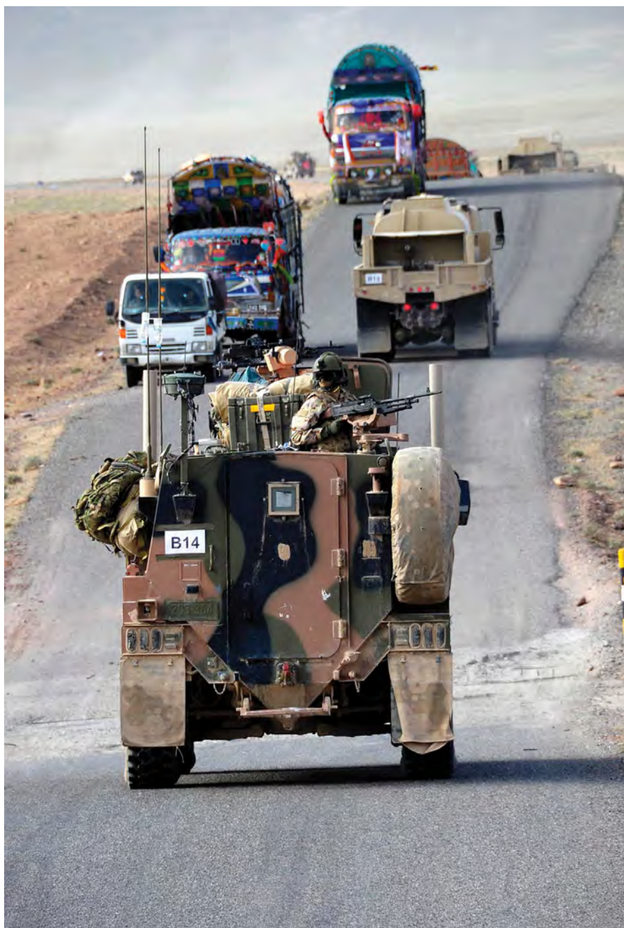
A Bushmaster and Afghan 'jingle trucks' share the highway—and the ever-present threat of bombs and ambushes—during resupply mission Operation Tor Ghar IV in southern Afghanistan in October 2010.