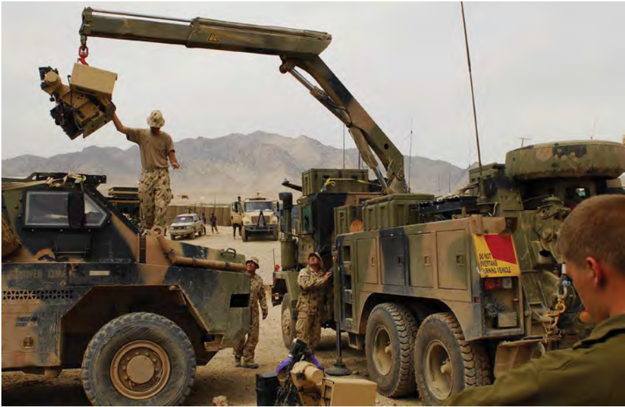
Australian Army engineers at a patrol base remove a remote weapons station from a Bushmaster for maintenance during operations near the village of Kakarak in southern Afghanistan in April 2009.