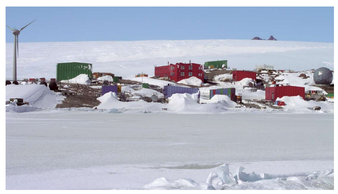
Mawson Station from the fast ice of Horseshoe Harbour, 2004.

Science is often described as the currency of the Treaty system. It encourages cooperation and gives us influence with other Antarctic players. The Antarctic Treaty provides for freedom of scientific investigation, promotes international cooperation and free exchange of information and personnel. Antarctic