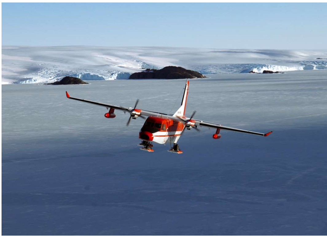
CASA 212 in flight between Mawson and Davis.