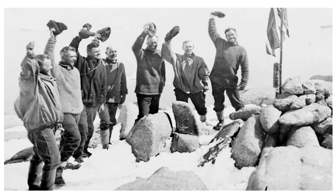
Proclaiming what became Australian Antarctic Territory. Photograph by Frank Hurley 13 January 1930, courtesy Australian Government Antarctic Division

Australia has two Antarctic territories—the Australian Antarctic Territory (AAT) and the territory of Heard and McDonald Islands (HIMI). These are non-self-governing external territories. It's rare for an individual to remain at one of the three Australian Antarctic stations for more than fifteen months. HIMI is essentially uninhabited.¹ But lack of permanent inhabitants does not mean we don't have significant national interests and responsibilities there.