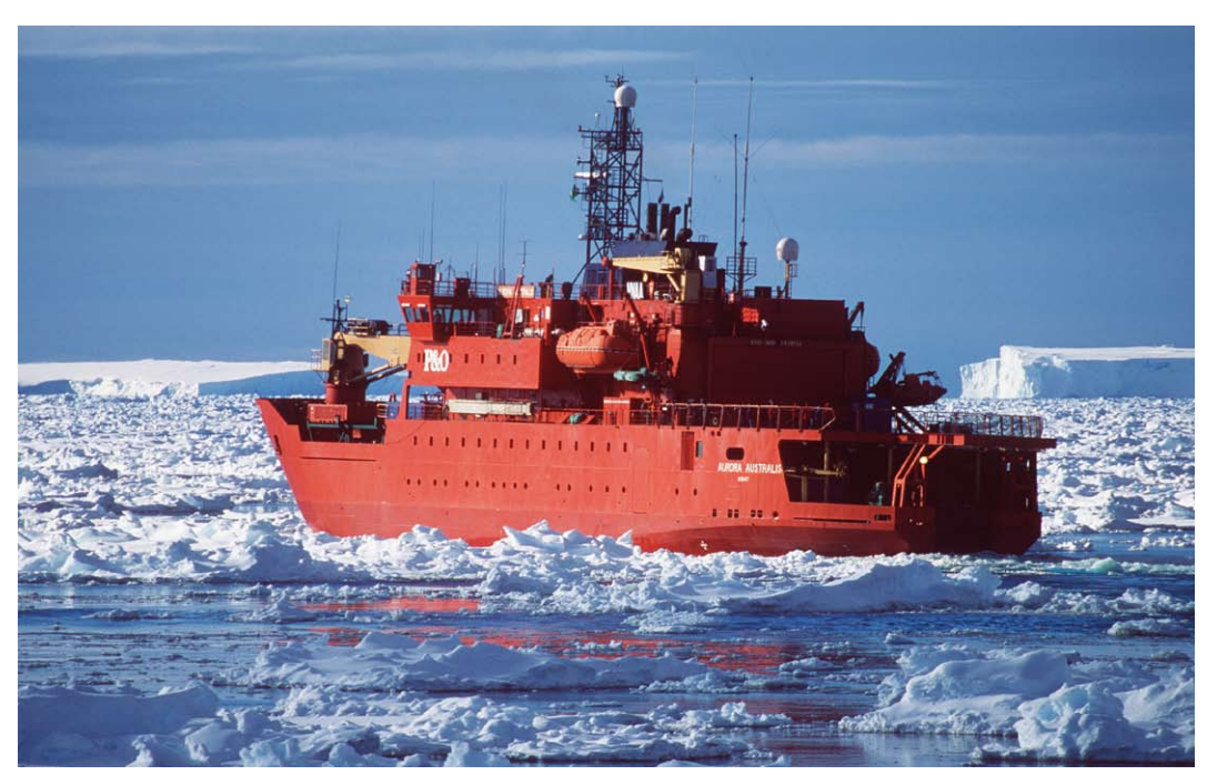
Aurora Australia leading Polar Bird out of the pack after Polar Bird had been beset for three weeks.

A wide range of government agencies have policy or operational interests in Antarctica for logistic support, marine research, environmental protection, fisheries management and enforcement, search and rescue, quarantine and border protection. Australia has only the Auroa Australis capable of operating in the Antarctic sea ice. Its capacity to support the breadth of Australian Government interests is severely limited by its primary obligations to support marine research and transport personnel and supplies. A decision on its long-term replacement will need to be made over the next decade. A civilian fisheries patrol vessel Oceanic Viking operates in sub-Antarctic waters.