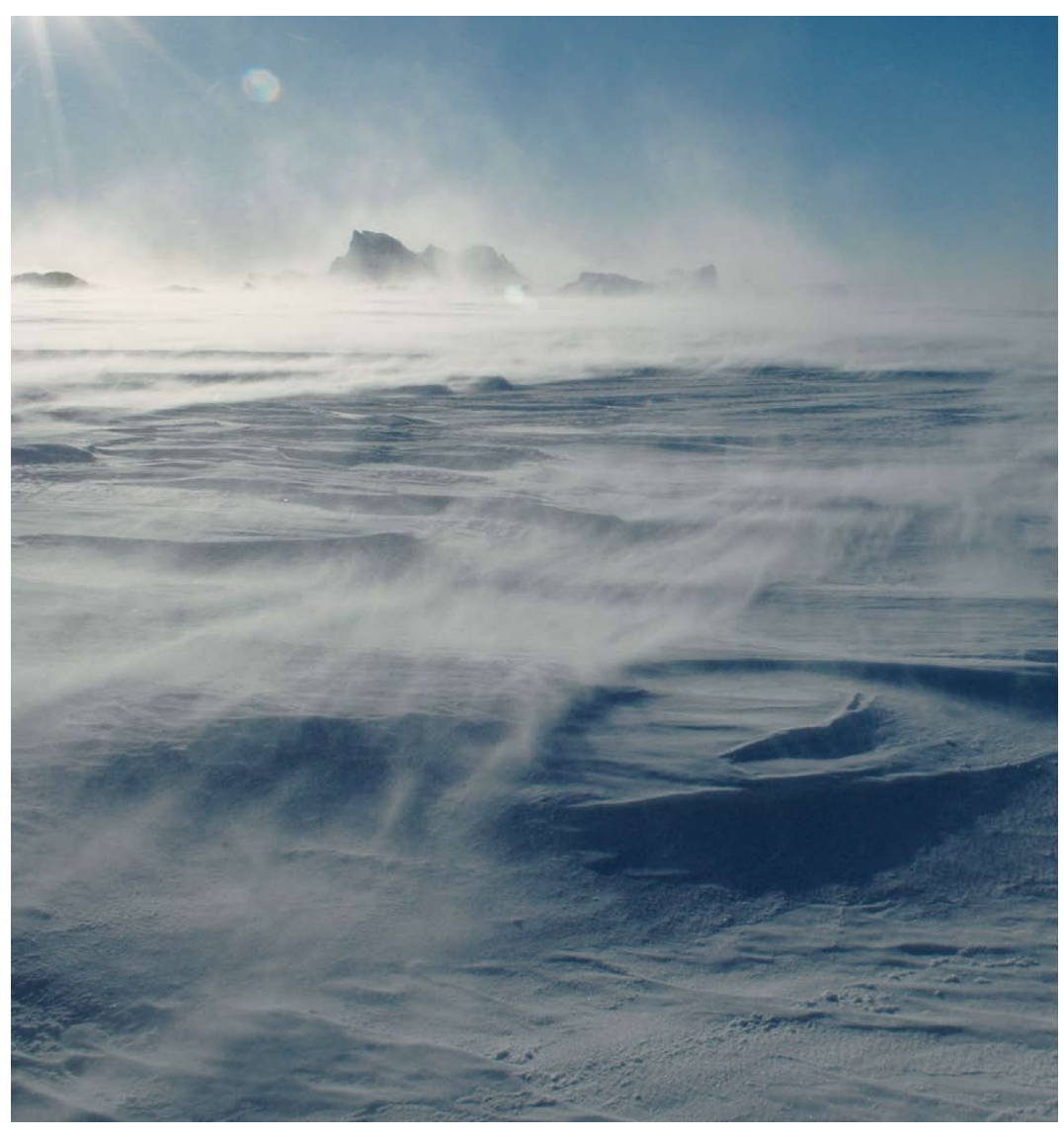
Blizzard near Mawson.

Second, more resources need to be devoted to oceanography for climate studies. More work is needed in Antarctic waters on the problem of ocean acidification, which could devastate ocean life with planet wide consequences.<sup>3</sup> Acid seas would have a devastating effect on corals and shellfish and on plankton. Plankton are the base of the planetary food web.