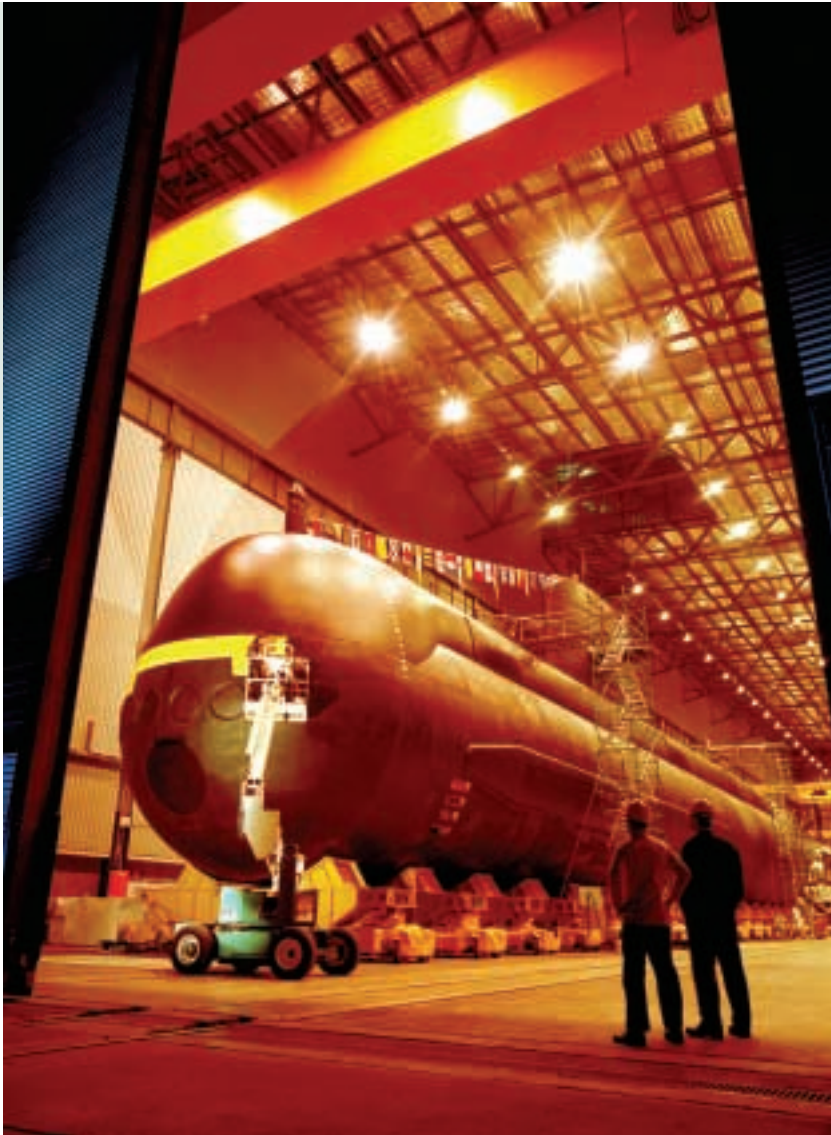
Collins class submarine under construction at ASC facility, Osborne, South Australia.