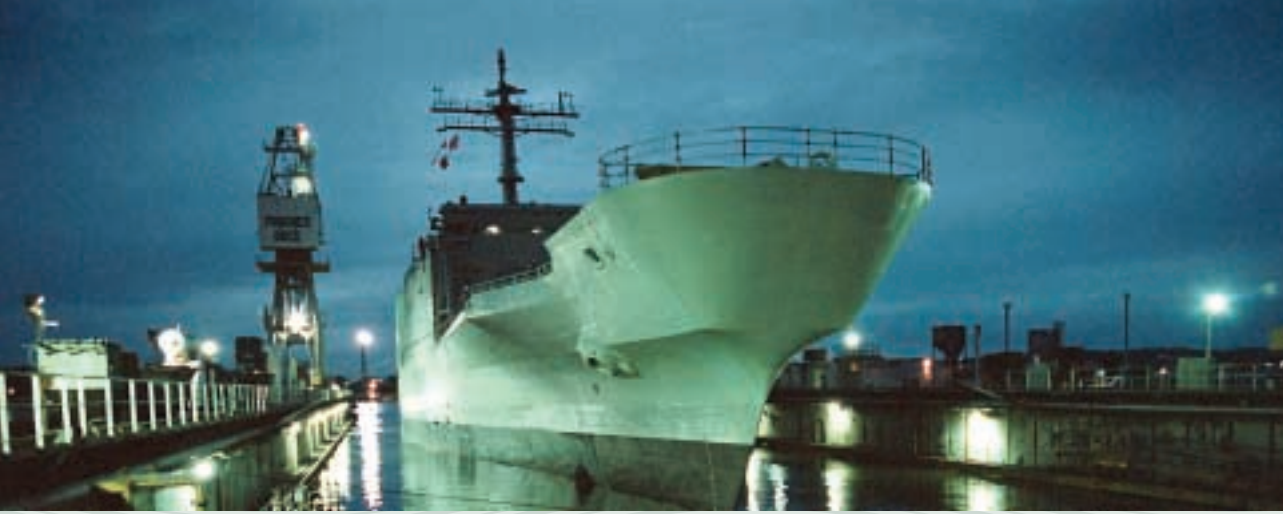
Early morning photograph of HMAS Manoora at Forgacs facility in Newcastle.

This would be a relatively radical outcome. We are not suggesting this is what the Government actually intends to do. But this model at least has the virtue of putting the issues clearly before us, and provides a template against which to consider the strengths and weaknesses of various options.