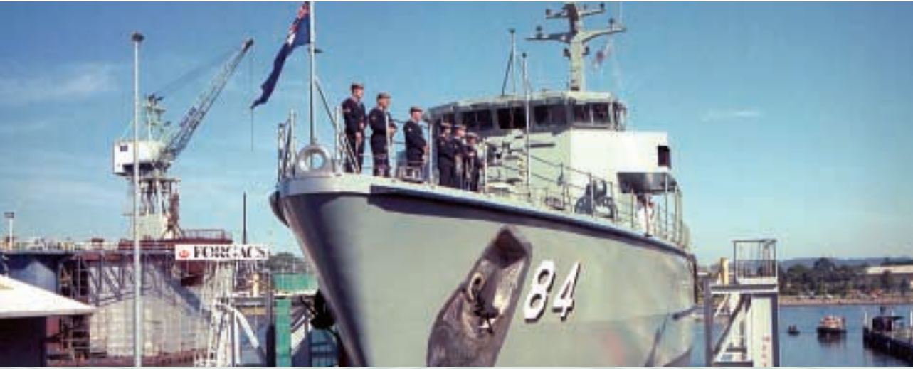
HMAS Norman being launched at ADI facility, Newcastle, New South Wales.

shipbuilding industry built bulk carriers, container ships and ferries, but as protection has been cut this part of the industry has disappeared.