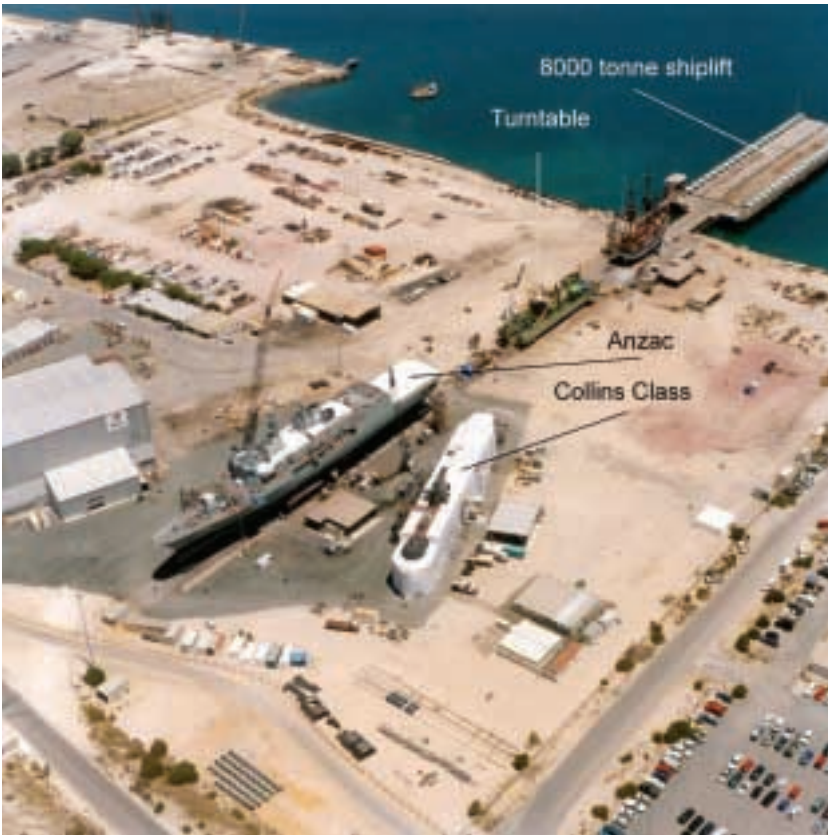
Aerial view of Tenix facility at Cockburn Sound, Western Australia, showing shiplift, turntable and with Anzac frigate and Collins submarine on hard stand.