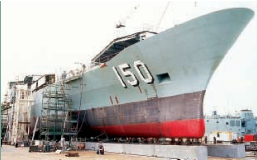
HMAS Anzac under construction, Tenix facility, Williamstown, Victoria.

Defence industry leaders have complained that relentless competition carries significant costs to both sides. They say the Commonwealth would do better to mimic elements of commercial practice and build long term partnering relationships or alliances with preferred suppliers. That would engender a less confrontational working environment, and more reliable returns would make it easier for companies to invest in expensive plant and skills. Of course they must also judge that such arrangements would be better for their firms and profits.