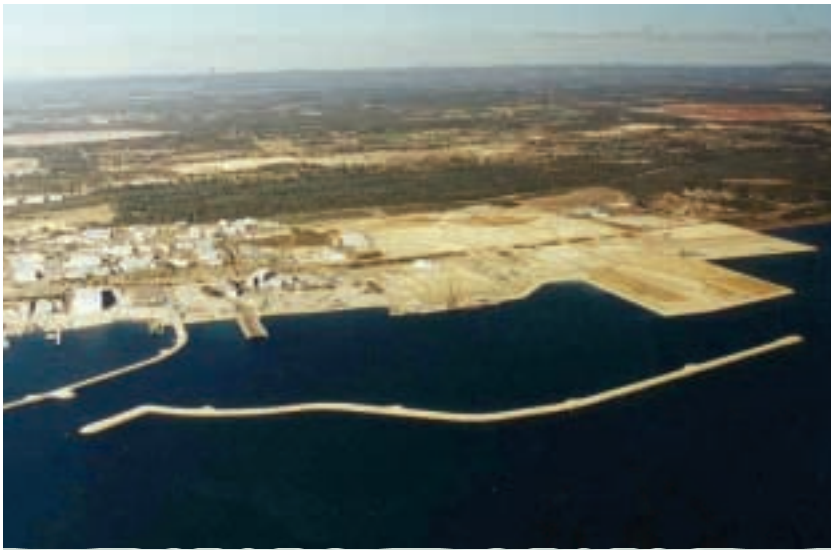
Aerial view of Australian Marine Complex being developed at Cockburn Sound, Western Australia.

As we explained in Chapter 3, we do not believe the problems in the naval shipbuilding sector are as serious as many others suppose. We also believe that the reform proposals reflected in the inferred model appear to carry significant risks and problems of their own, as we have outlined in this chapter. On balance we do not believe that the pressures and problems in the sector justify the risks involved in the implementation of a package of reform proposals of the kind embodied in the inferred model.