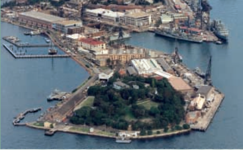
Aerial view of Garden Island Dockyard, Sydney, New South Wales.

There is in fact no strong strategic reason to build the Navy's warships here in Australia. It makes sense to do so if the premium is not too high, because there are economic benefits and some advantages in developing the skills for repair and maintenance. But the real strategic priority is to have the ability to repair and maintain our ships, including the ability to keep them in operation during a conflict.