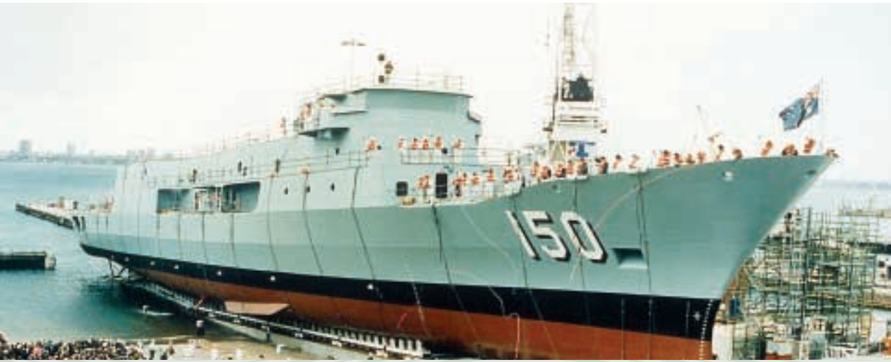
HMAS Anzac being launched, Tenix facility, Williamstown, Victoria.

The project timings in the DCP are determined primarily by the pay-off dates of the vessels presently in service, and by financial programming considerations. This does not necessarily deliver a workable ship acquisition program. There are two problems. First, there is tight bunching of three large ship building projects involving at least eight hulls commencing around the end of the decade. As we have seen, these ships are beyond the capacity of current assembly facilities. It would be better to space the building of these ships so that industry has a steadier workload over the next two decades.