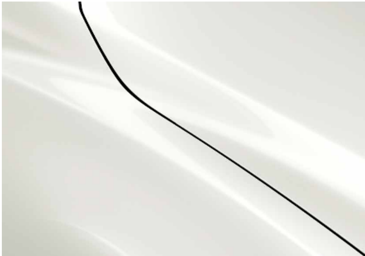
Snowflake White Pearl Mica