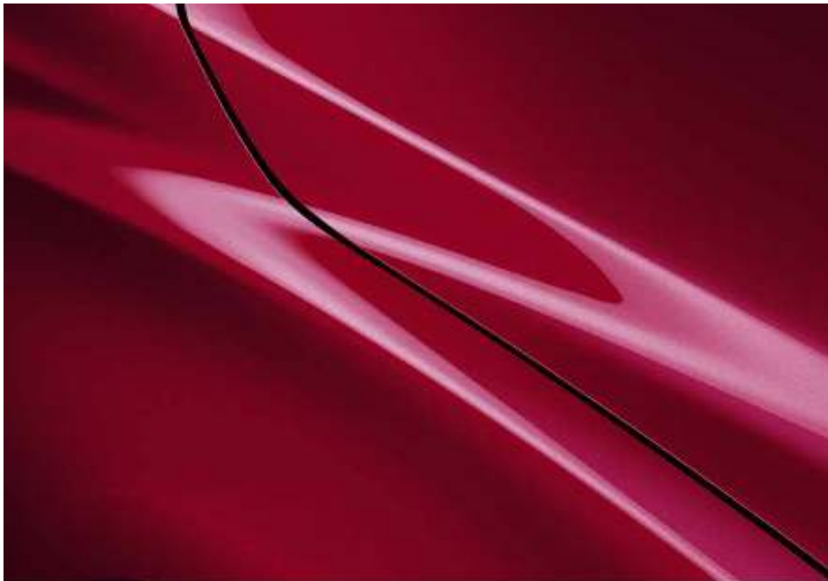
Soul Red Crystal Metallic^