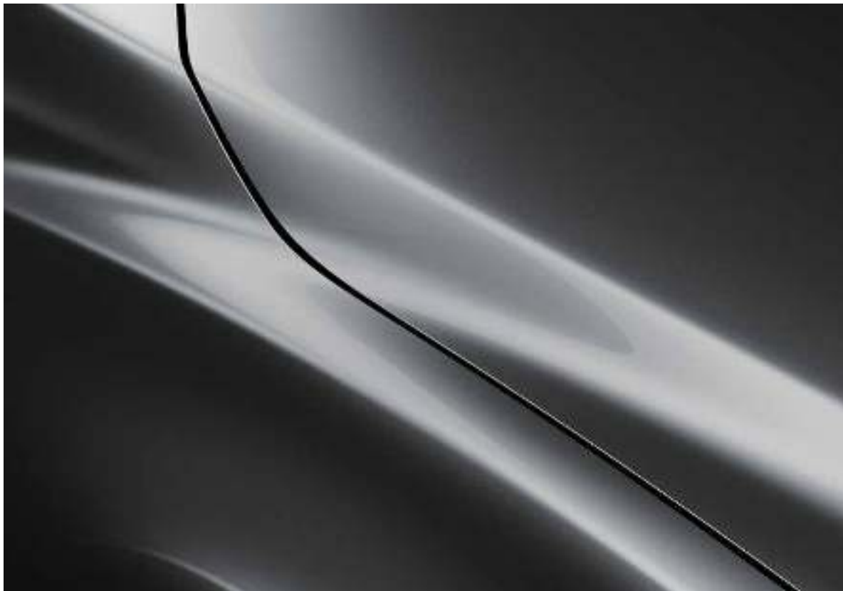
Machine Grey Metallic^