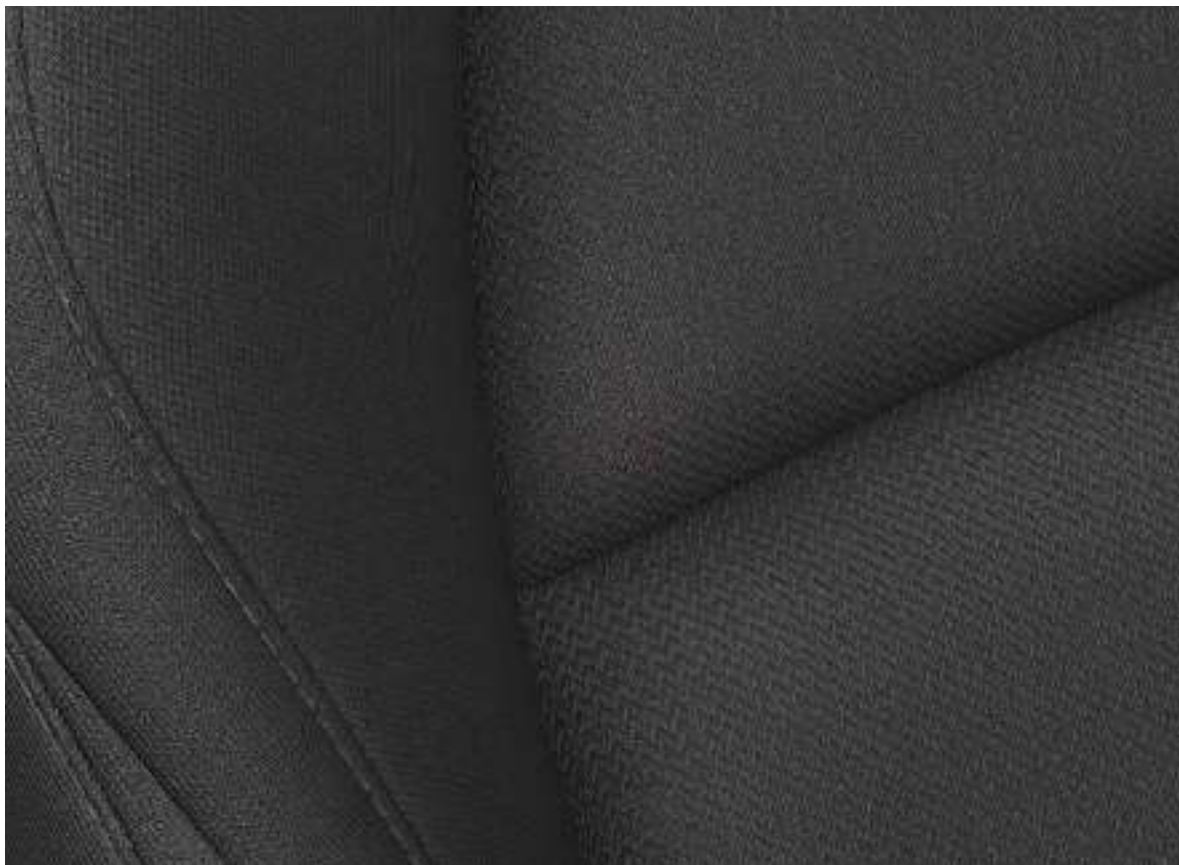
Black cloth (G20 Evolve and G25 Evolve)