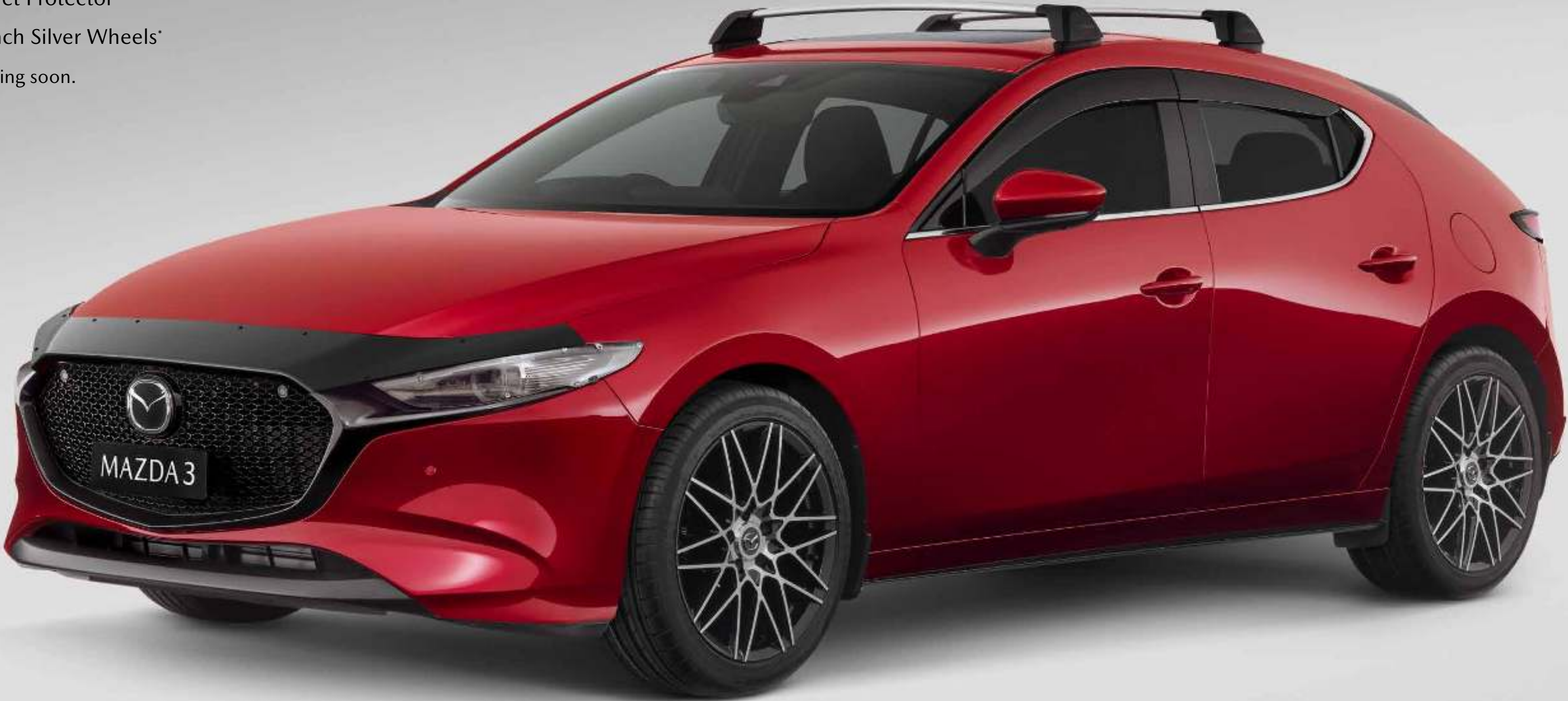
G25 Astina in Soul Red Crystal Metallic

Featuring exceptional design, cutting edge technology and beautiful craftsmanship, Mazda3 is the car you need to feel to believe. Mazda Genuine Accessories let you add individuality and protect your investment. They also give you superb design, quality, and safety, all with the confidence of a Mazda warranty. Mazda Genuine Accessories let you add even more Zoom-Zoom.