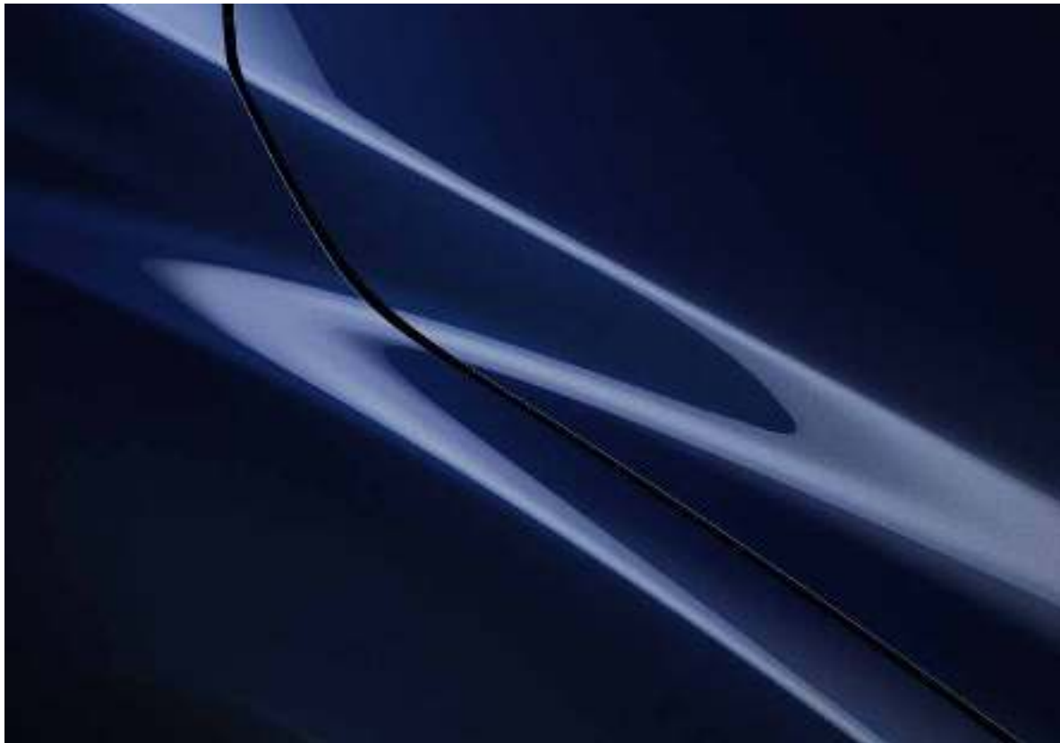
Deep Crystal Blue Mica