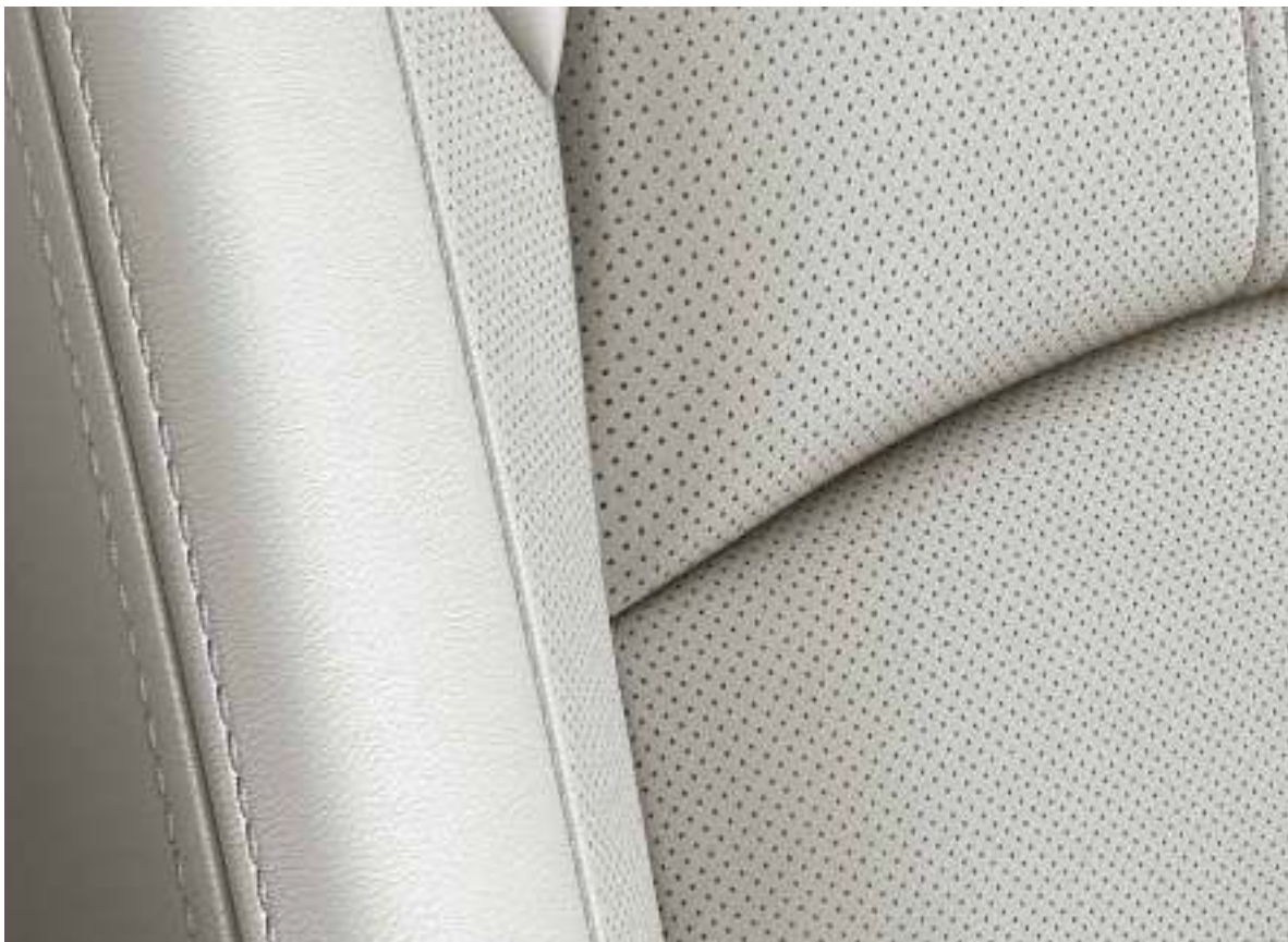
Pure white leather ■ (G25 Astina only)#