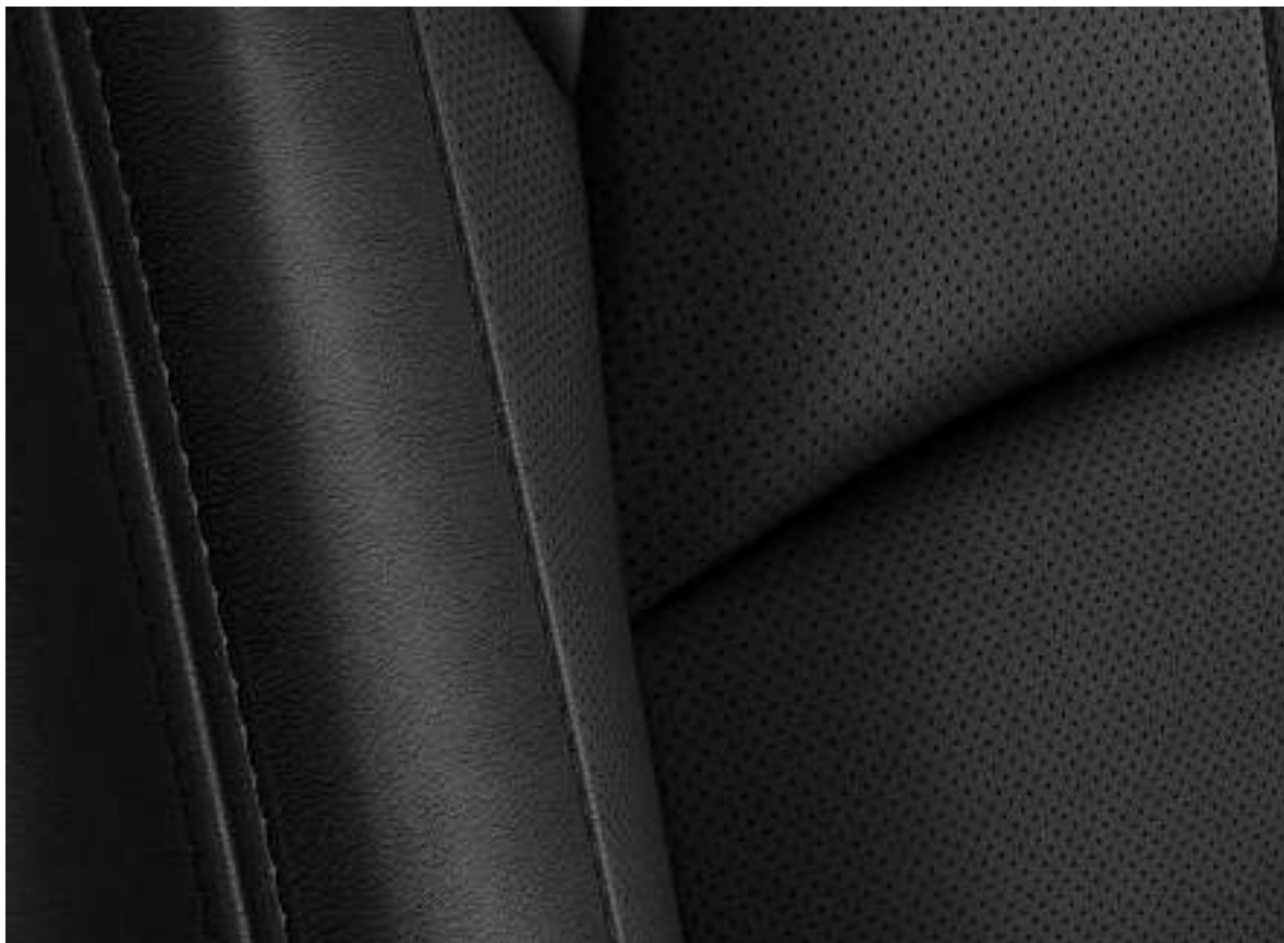
Black leather (G20 Touring, G25 GT and G25 Astina)#