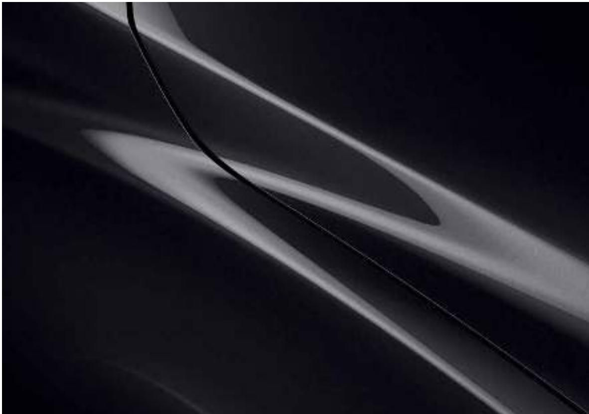
Jet Black Mica