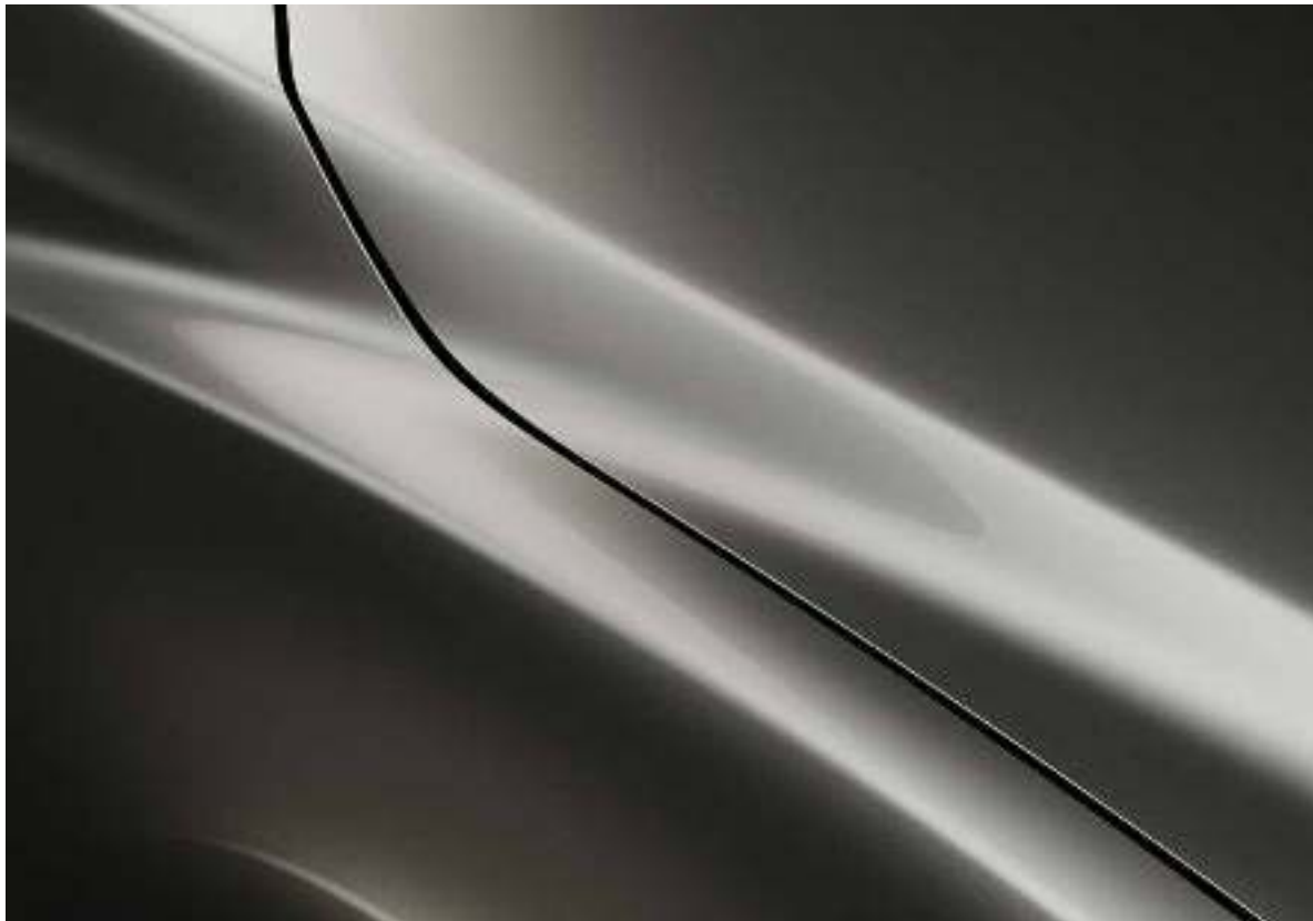
Titanium Flash Mica