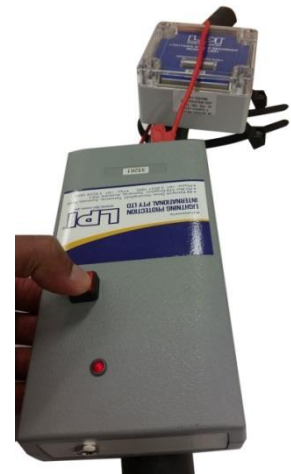
Figure 5: Step 3