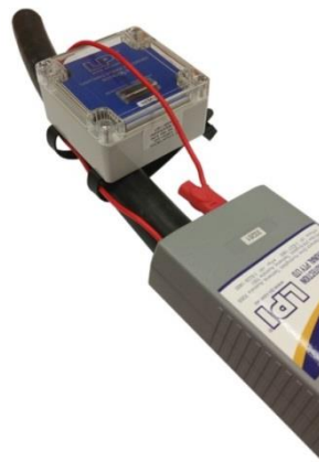
Figure 4: Step 2