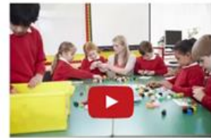
Introduction to eTAPS : Effective Teacher Aide Practices for Schools