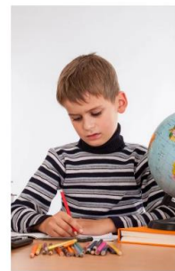
Top Tips For Helping Students With Anxiety