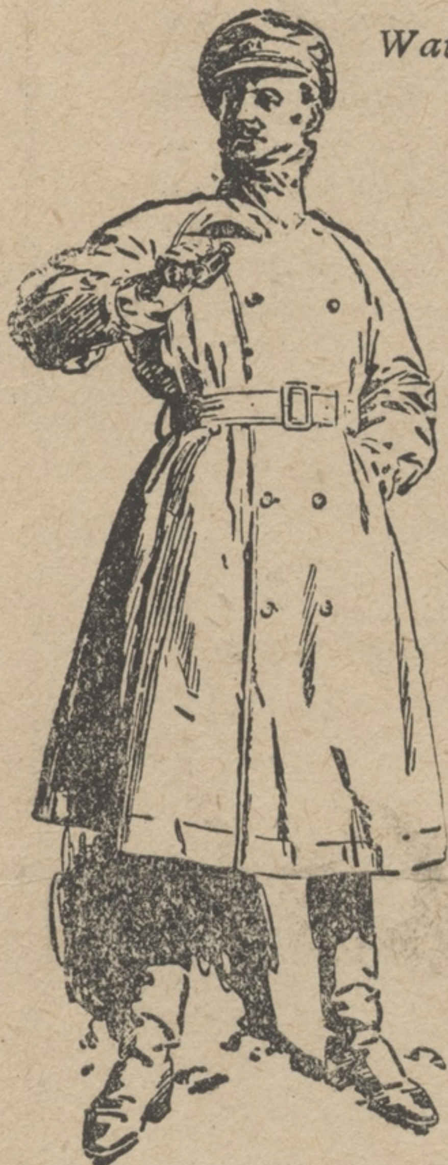
Infantry Trench Coat

Waterproof Coat Specialists for over 50 years.