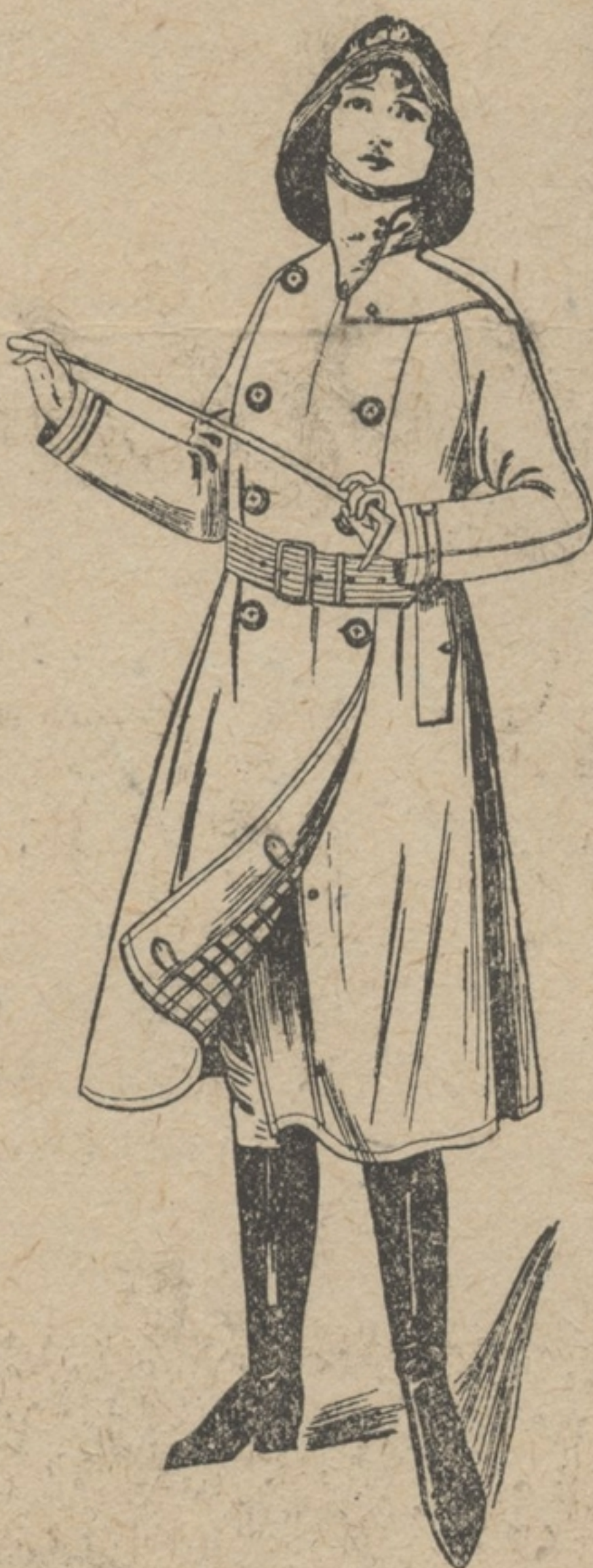
Ladies' Trench Coat

Lined detachable fleece, fur, or leather, same as Officers' Coats, has proved a most essential garment to nurses abroad, also motor drivers, and for all war work. For riding, a regular Cavalry shape is made.