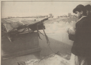
AN STRIKE: A tank in Baghdad is destroyed in the first day of allied bombing.

The bombing of Iraqi air bases and command centers was the first phase of the air war.