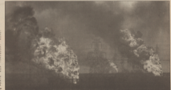
DISPAIR: The oil slicks of Kuwait burn out of control, defying attempts to extinguish them.