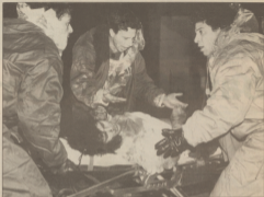
DISPAIR: Rescue workers remove an injured soldier from the rubble of a Tel Aviv bombing, shown by an Iraqi food truck.

Major said the British government would do everything in its power to help the international coalition and Iraqis who are being targeted by the missiles. He said the British government would do everything in its power to help the international coalition and Iraqis who are being targeted by the missiles.