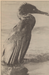
UNUSUAL: A cormorant, seen from the slick, with 2-3