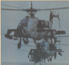
FLAMINGO The Apache helicopter.