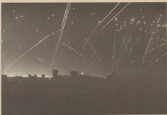
NOIR ATTACK: The city was lit up by a bright light in the air over Baghdad.

D EARLY TO EIGHTY TO ONE was the ratio between the number of statements attributed to Saddam Hussein in the last 24 hours of the war, according to a tally of the number of statements attributed to the Iraqi leader in the last 24 hours of the war, according to a tally of the number of statements attributed to the Iraqi leader in the last 24 hours of the war.