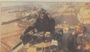
ON THE MOVE Iron brutes clear through the desert in preparation for the ground war.