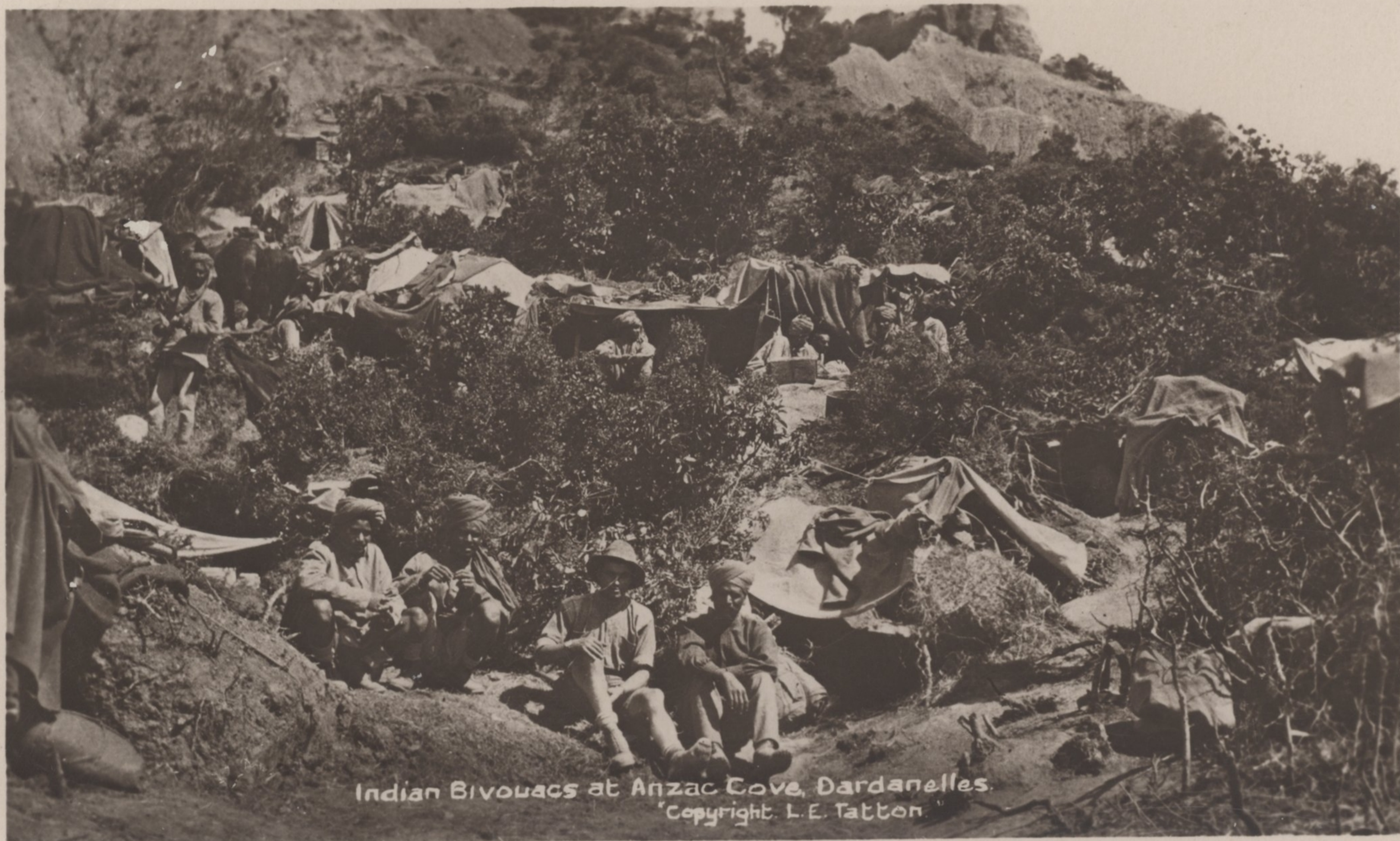
Indian Bivouacs at Anzac Cove, Dardanelles.