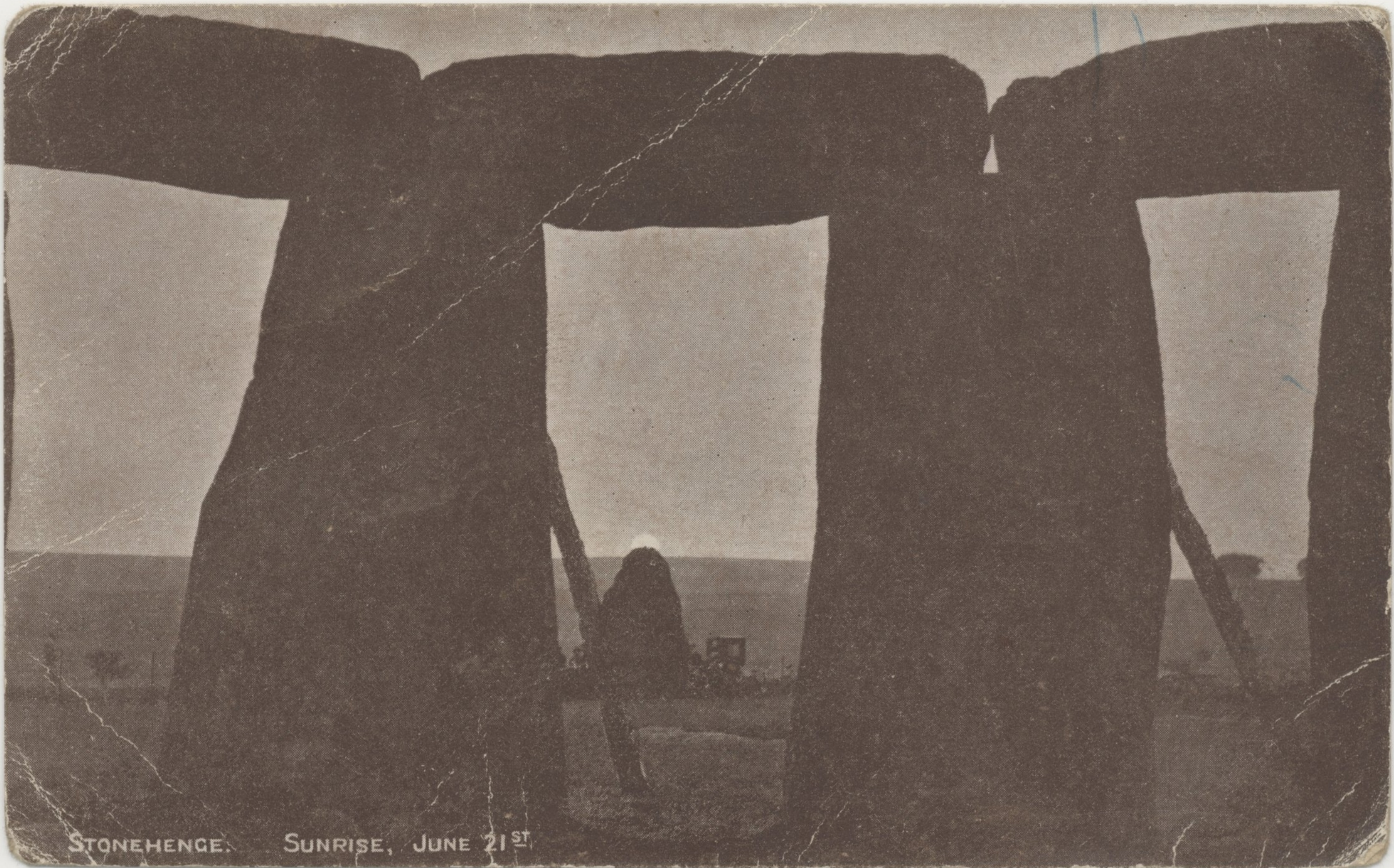
STONEHENGE. SUNRISE, JUNE 21 ST