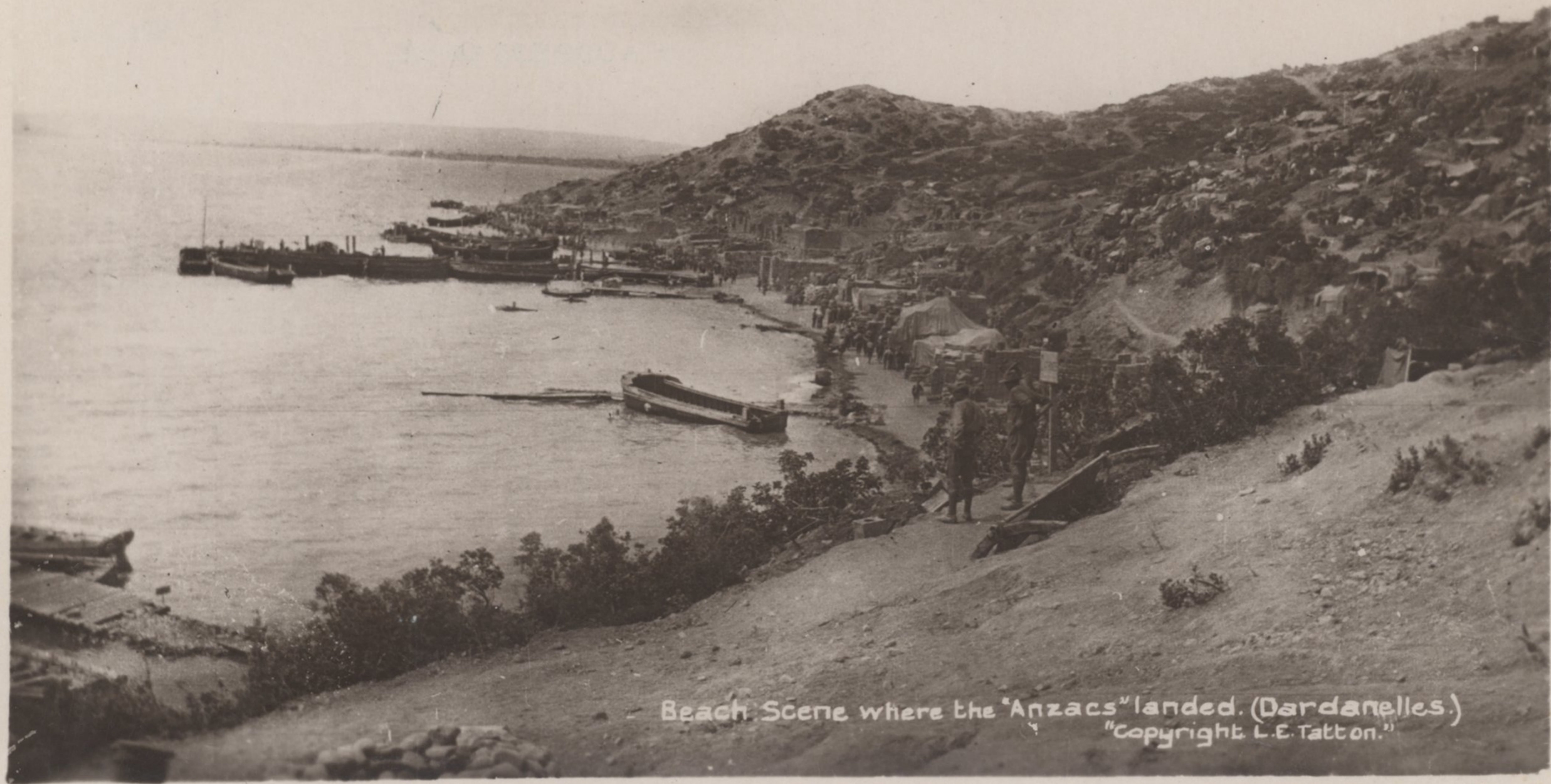
Beach Scene where the "Anzacs" landed. (Dardanelles.)