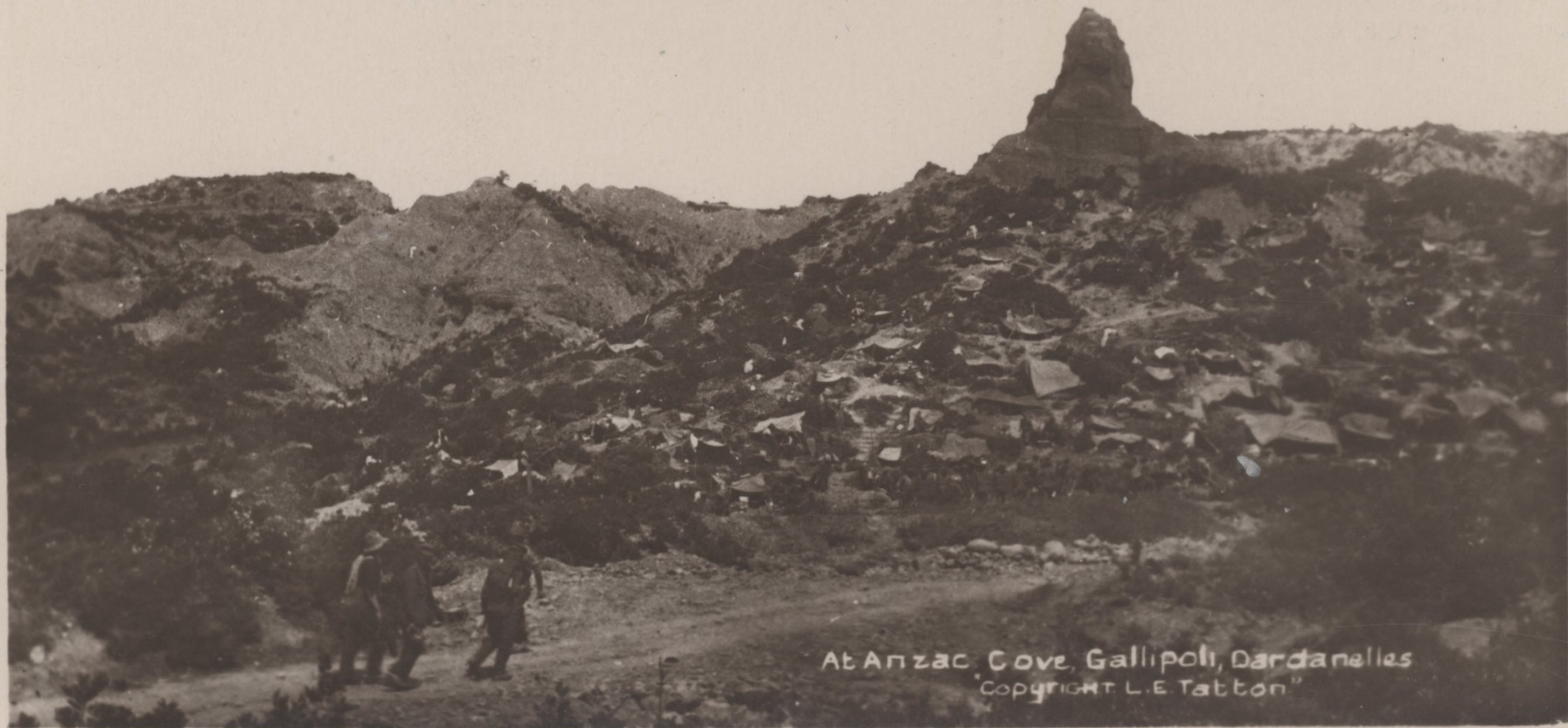
At Anzac Cove, Gallipoli, Dardanelles