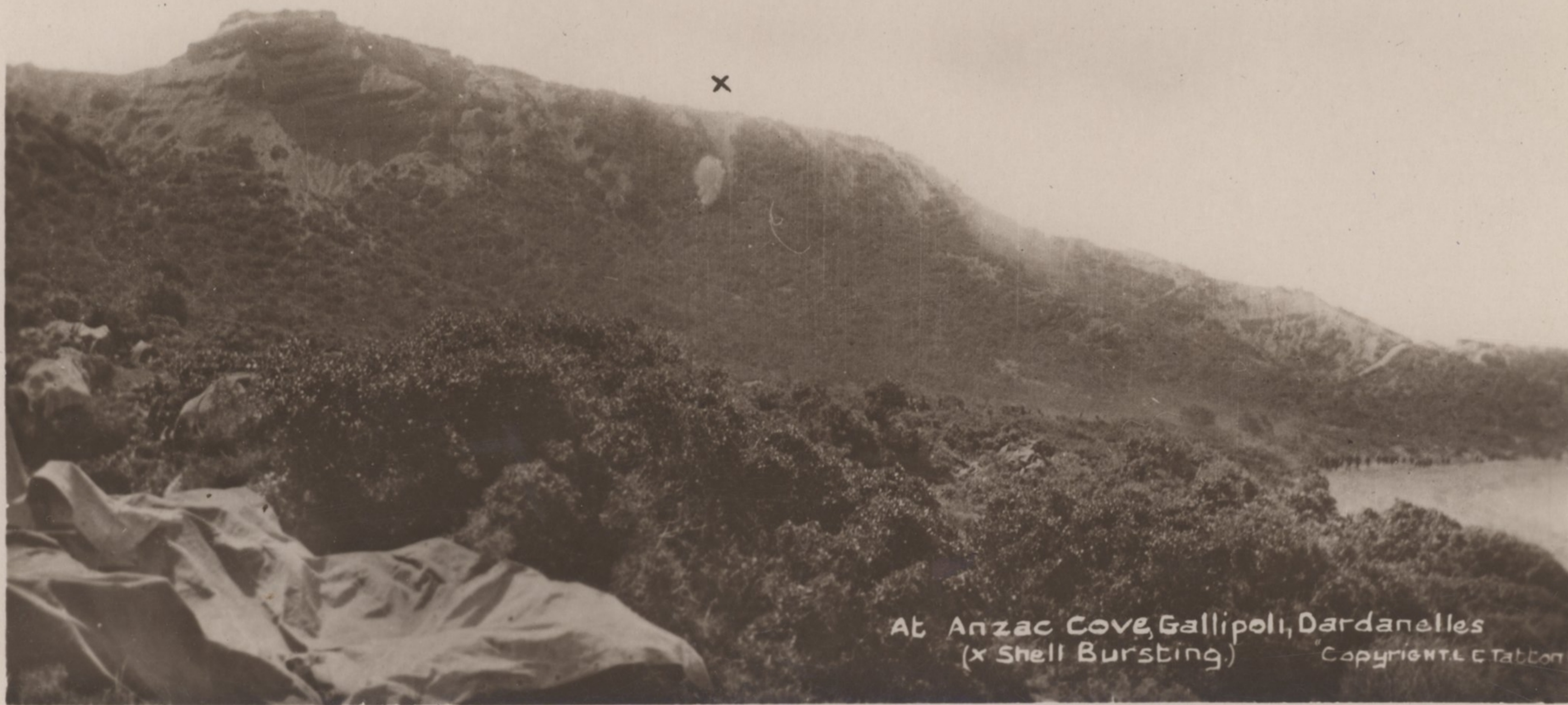
At Anzac Cove, Gallipoli, Dardanelles (x Shell Bursting.)