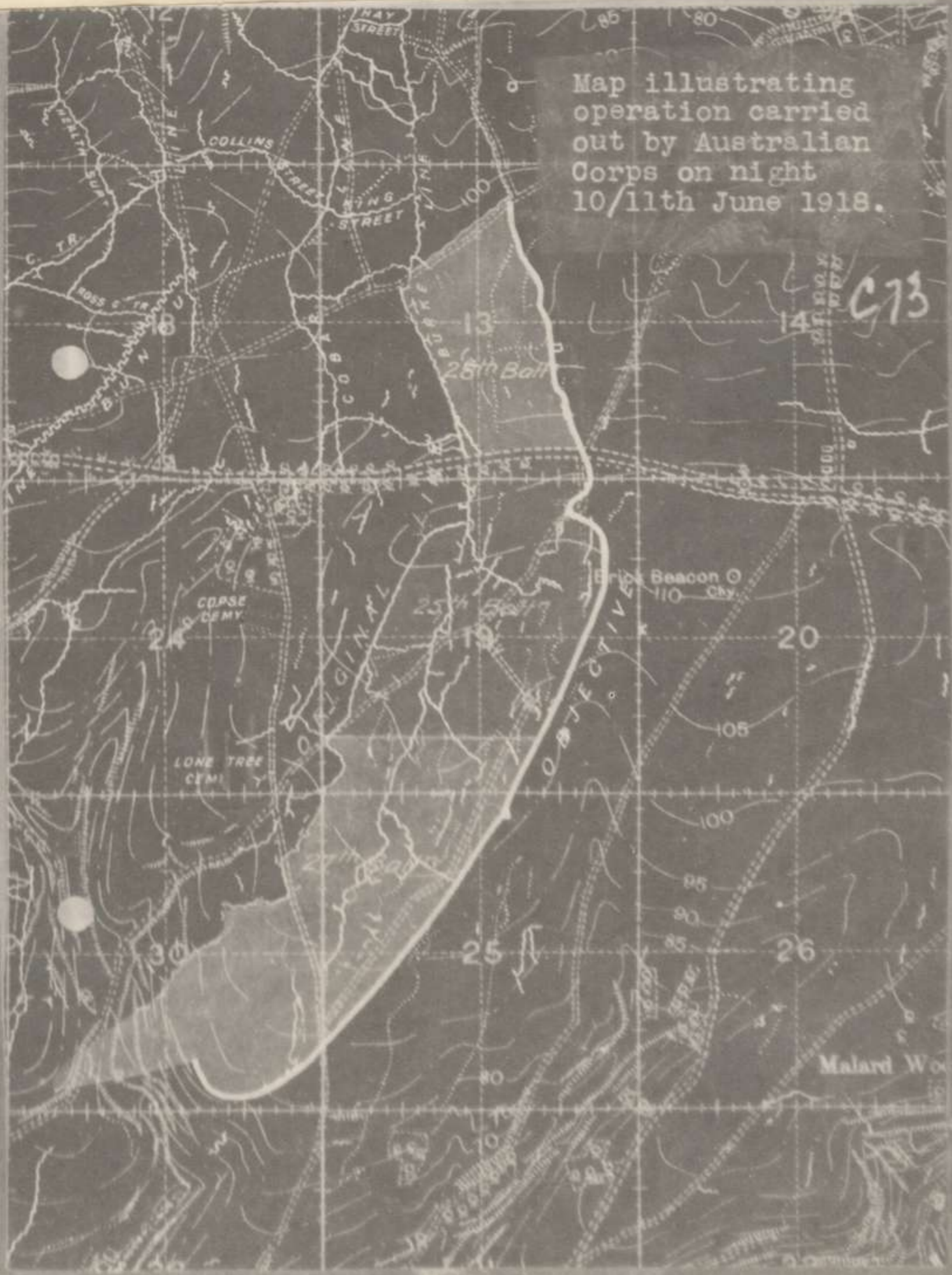
Map illustrating operation carried out by Australian Corps on night 10/11th June 1918.