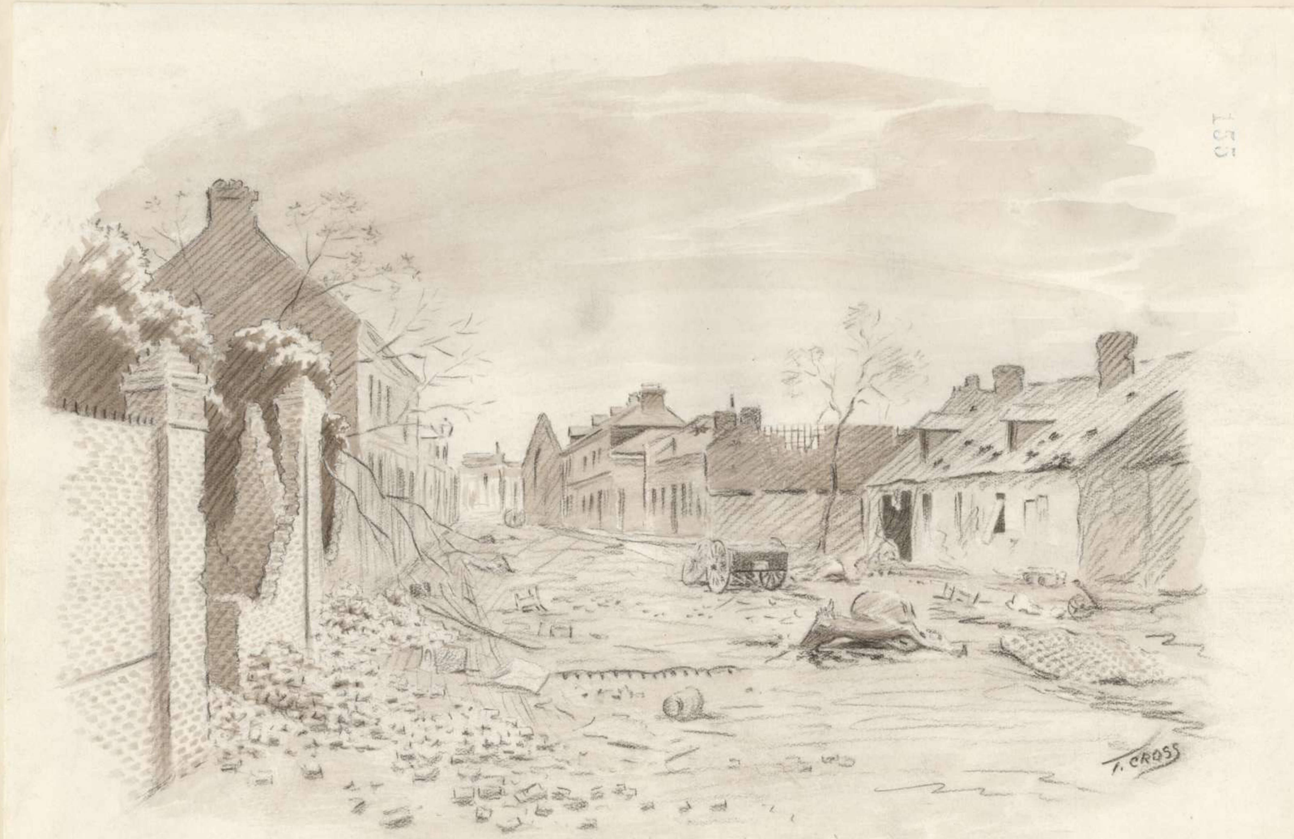
Villers - Bretonneux.