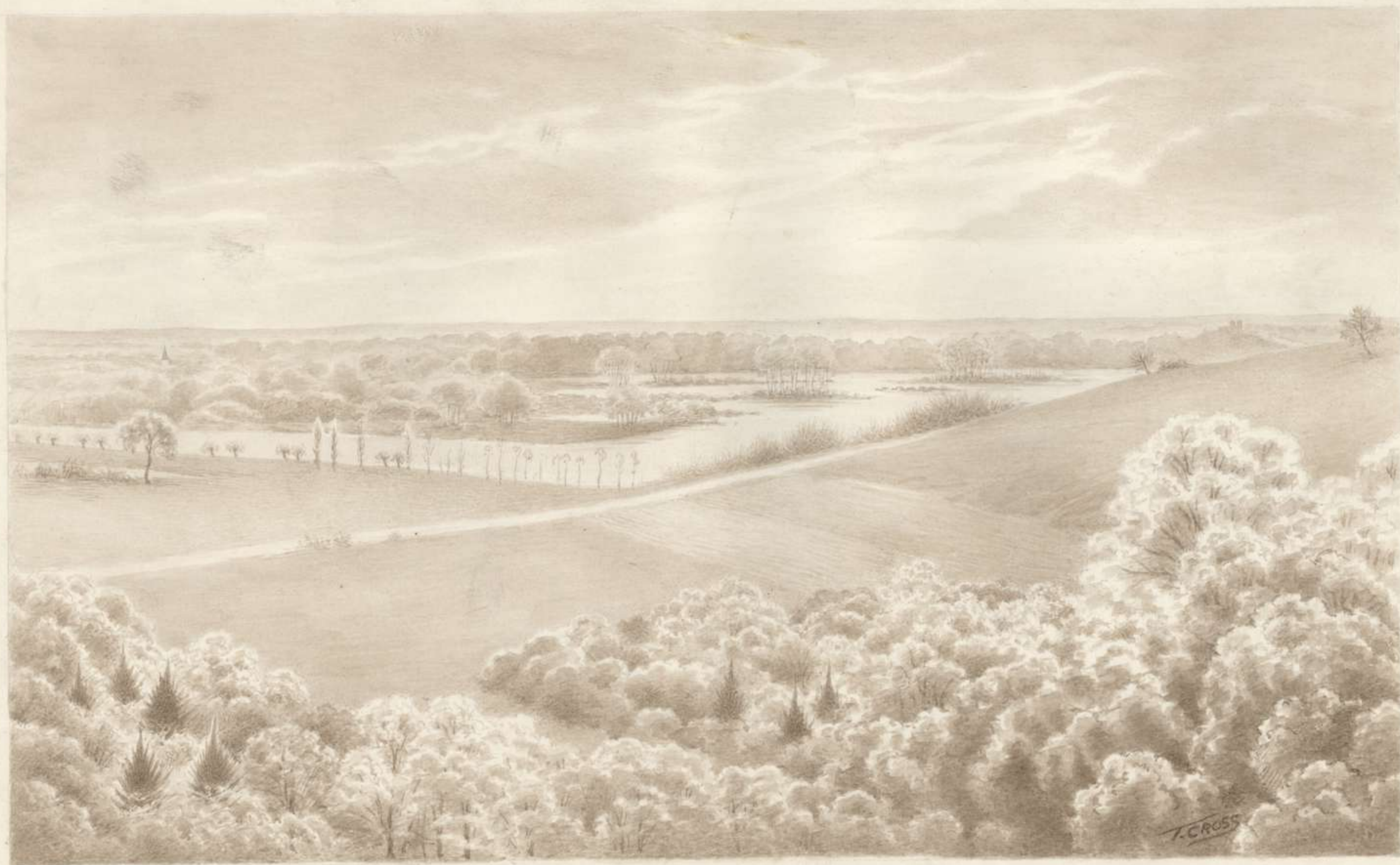
The valley of the Somme.