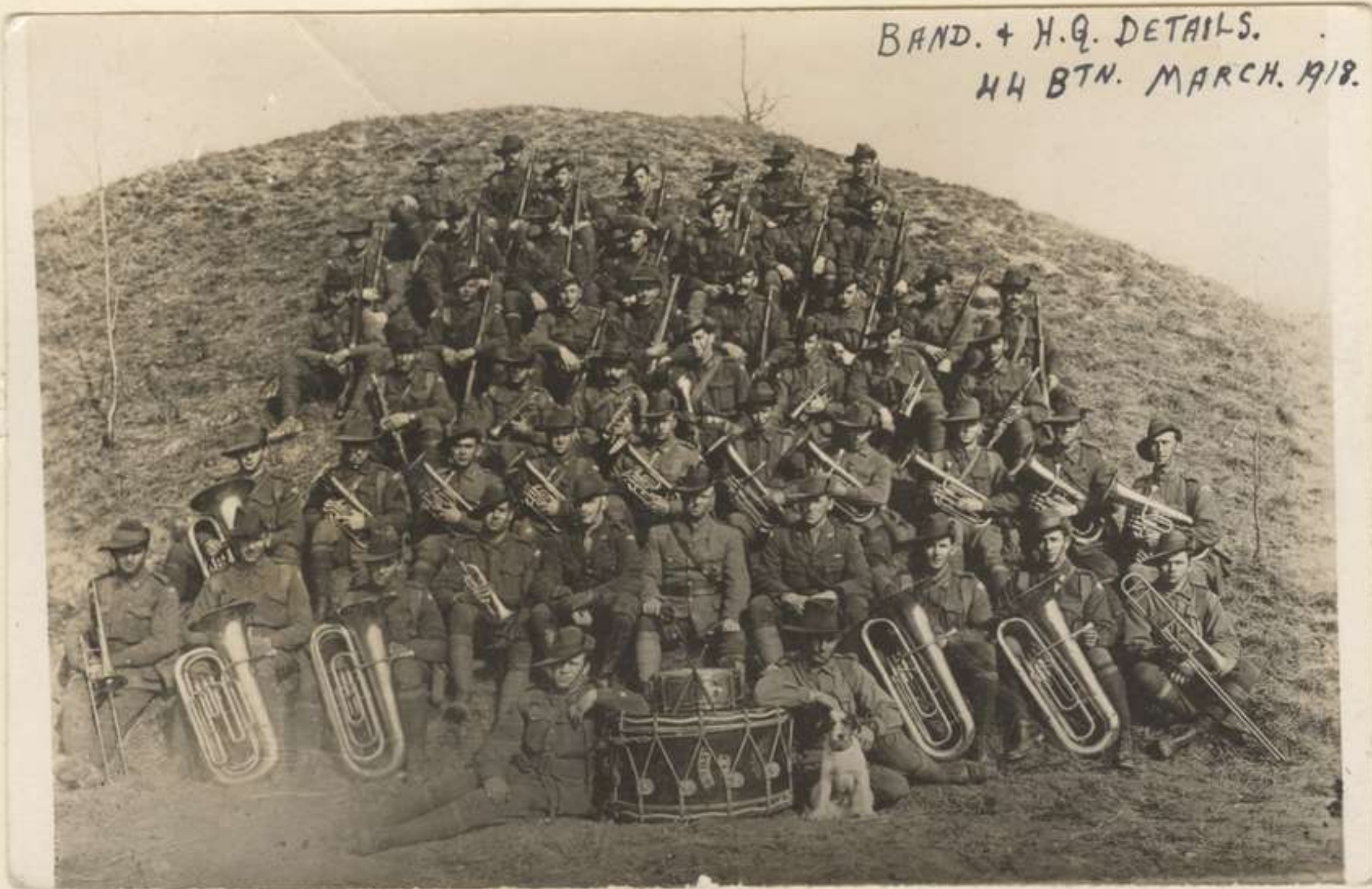
BAND. + H.Q. DETAILS. HQ BTN. MARCH. 1918.