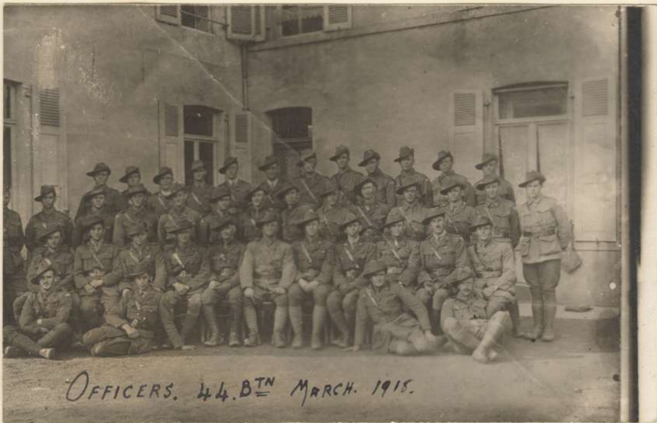
OFFICERS. 44. B TH MARCH. 1918.