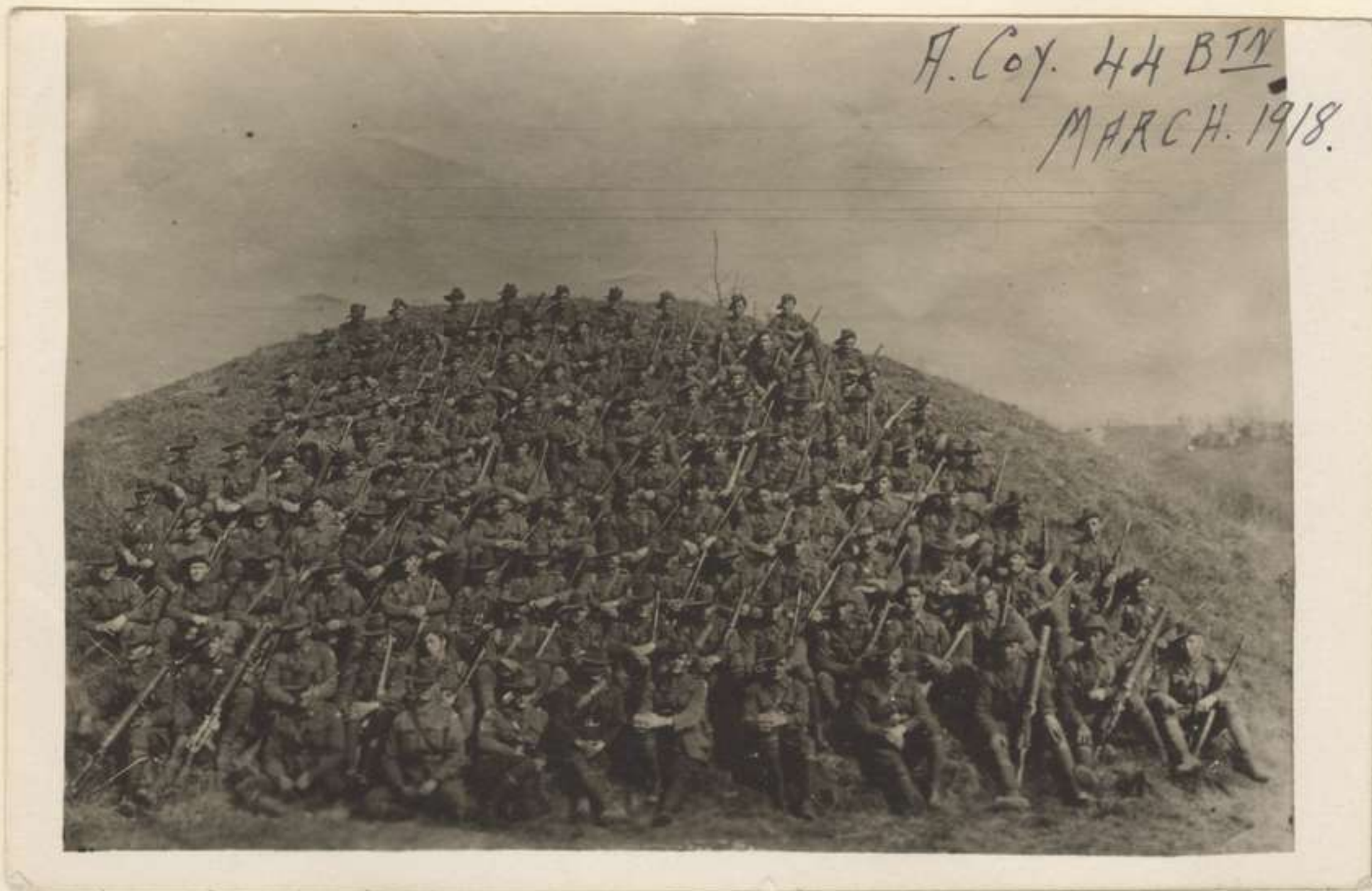
A. Coy. HQ BTN MARCH. 1918.