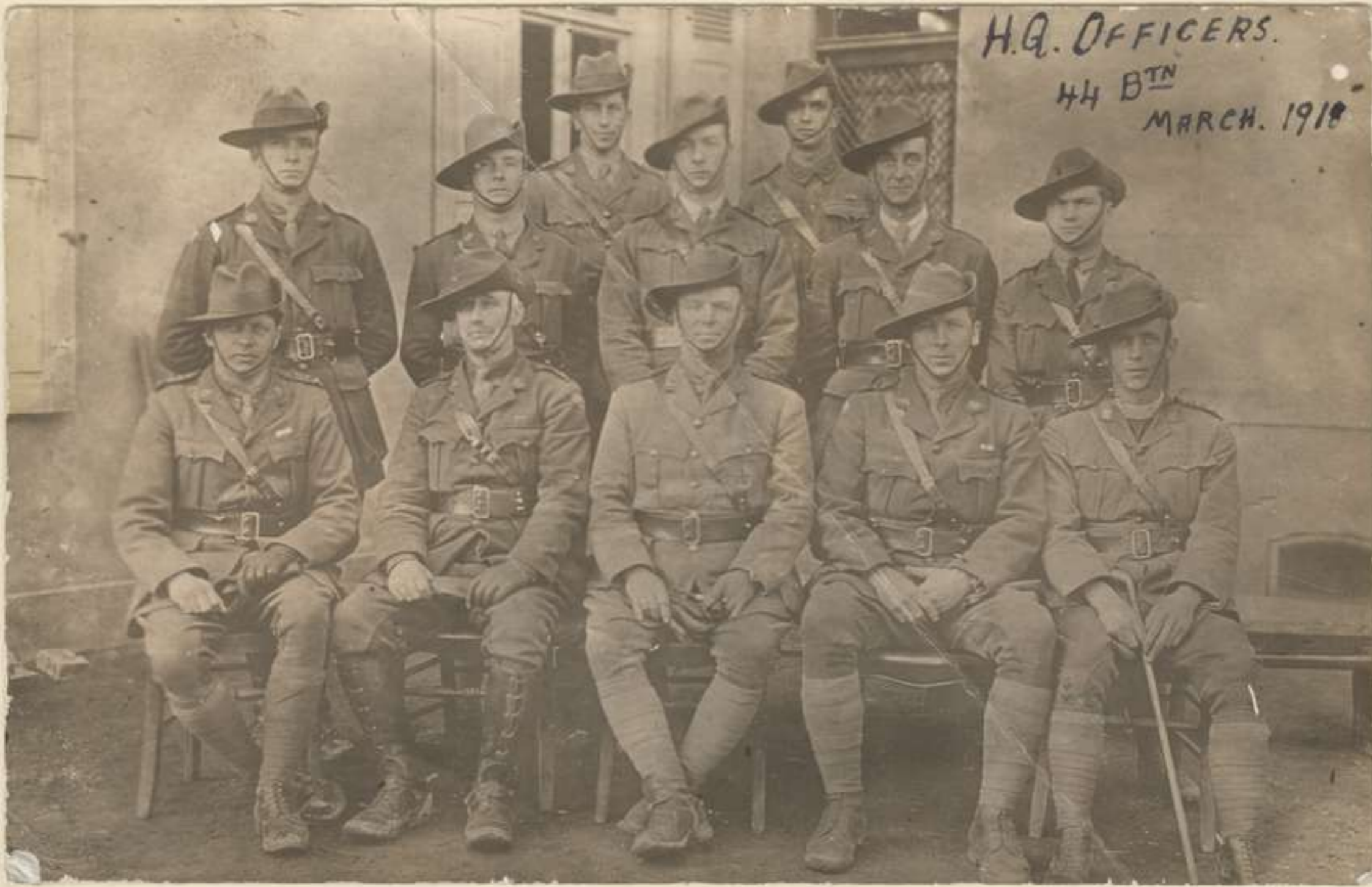
H.Q. OFFICERS. 44 B TH MARCH. 1918