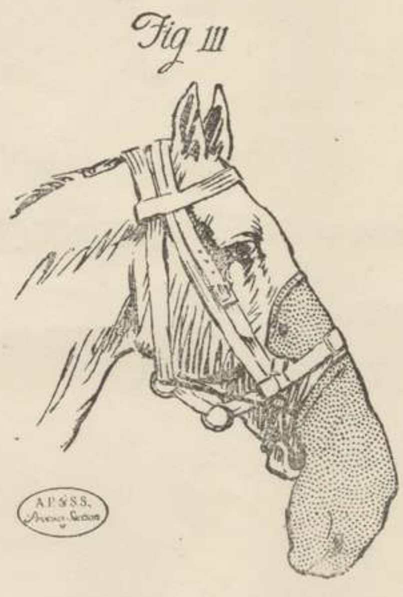
Respirator adjusted and secured by fastening elastic to throat lash.