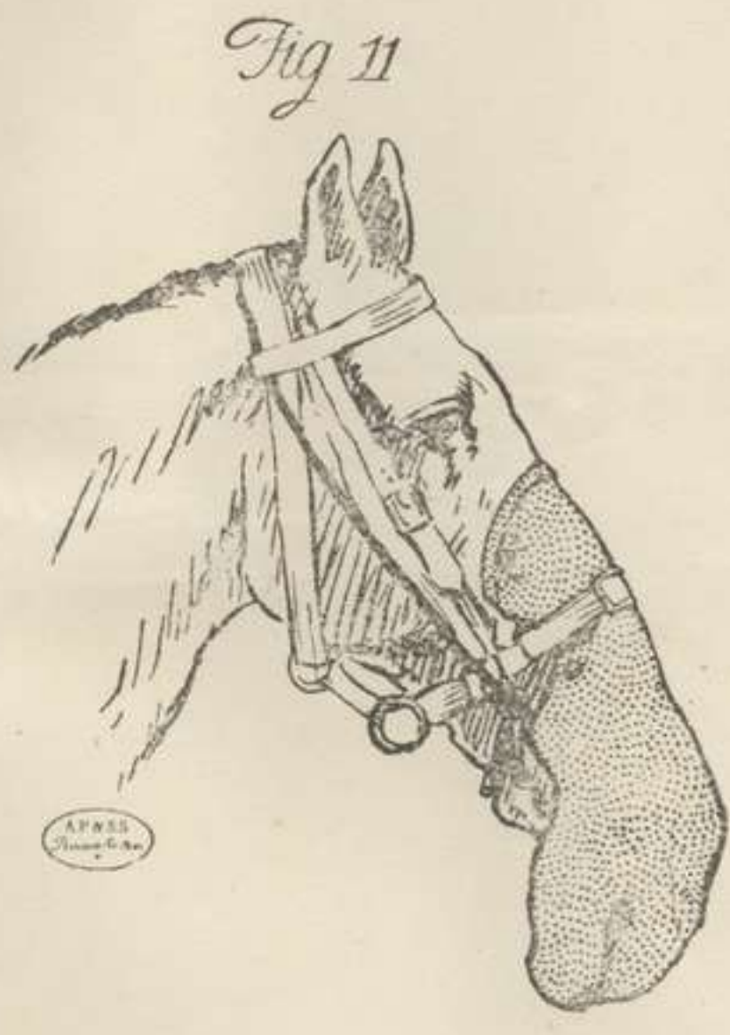
Respirator adjusted and secured by elastic over poll.