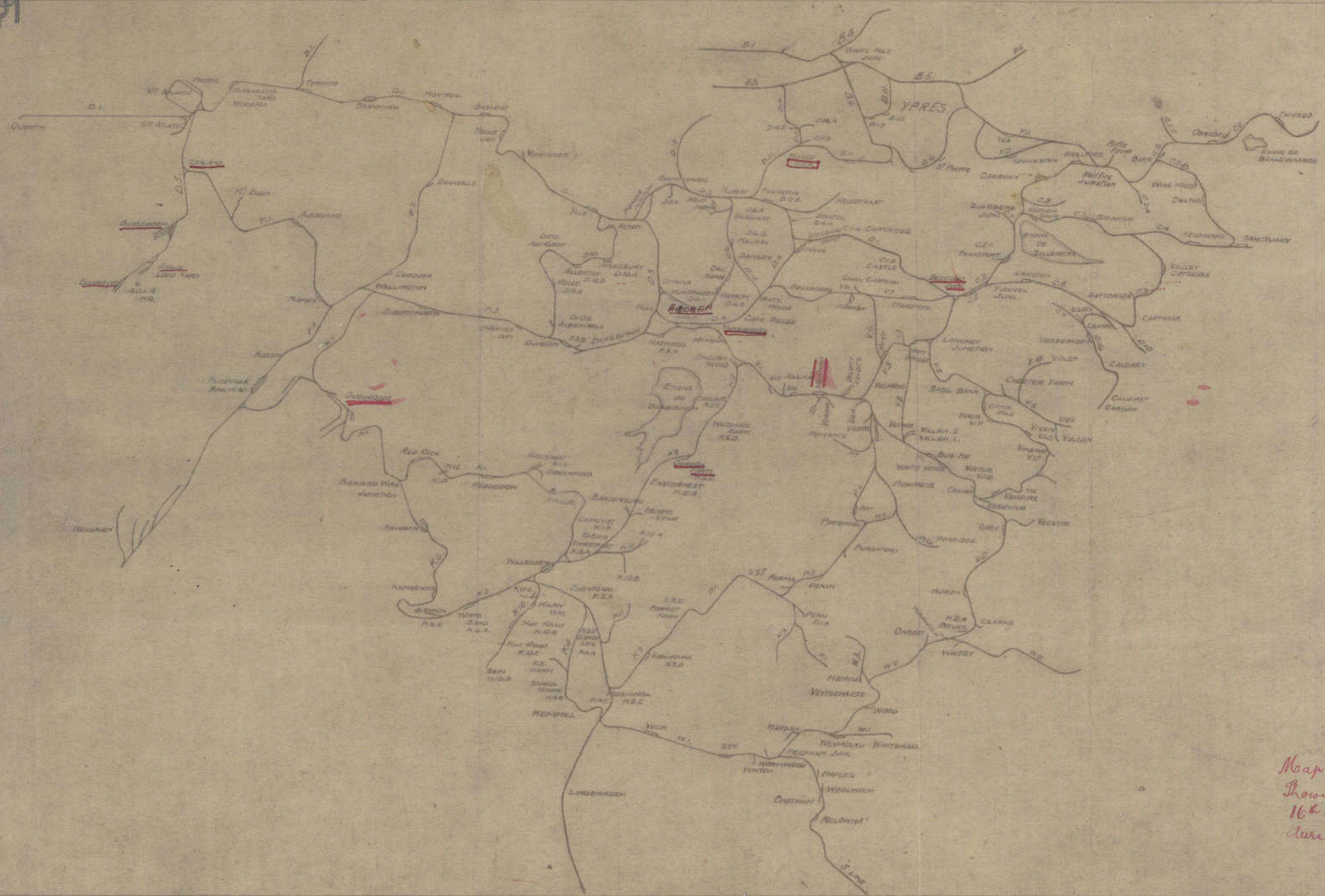
Map. 2 nd Army L.R. System. Showing Points at which 16 th ALROC AIF. were stationed during Octo 1917. For War Diary Dec 1917