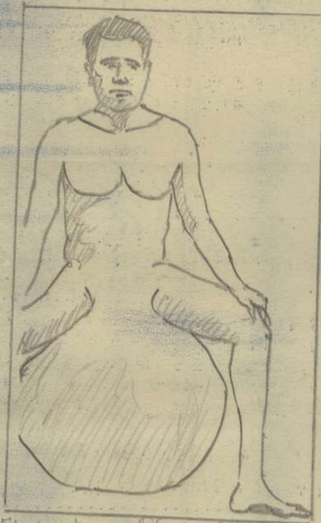
Elephantiasis Of The Scrotum