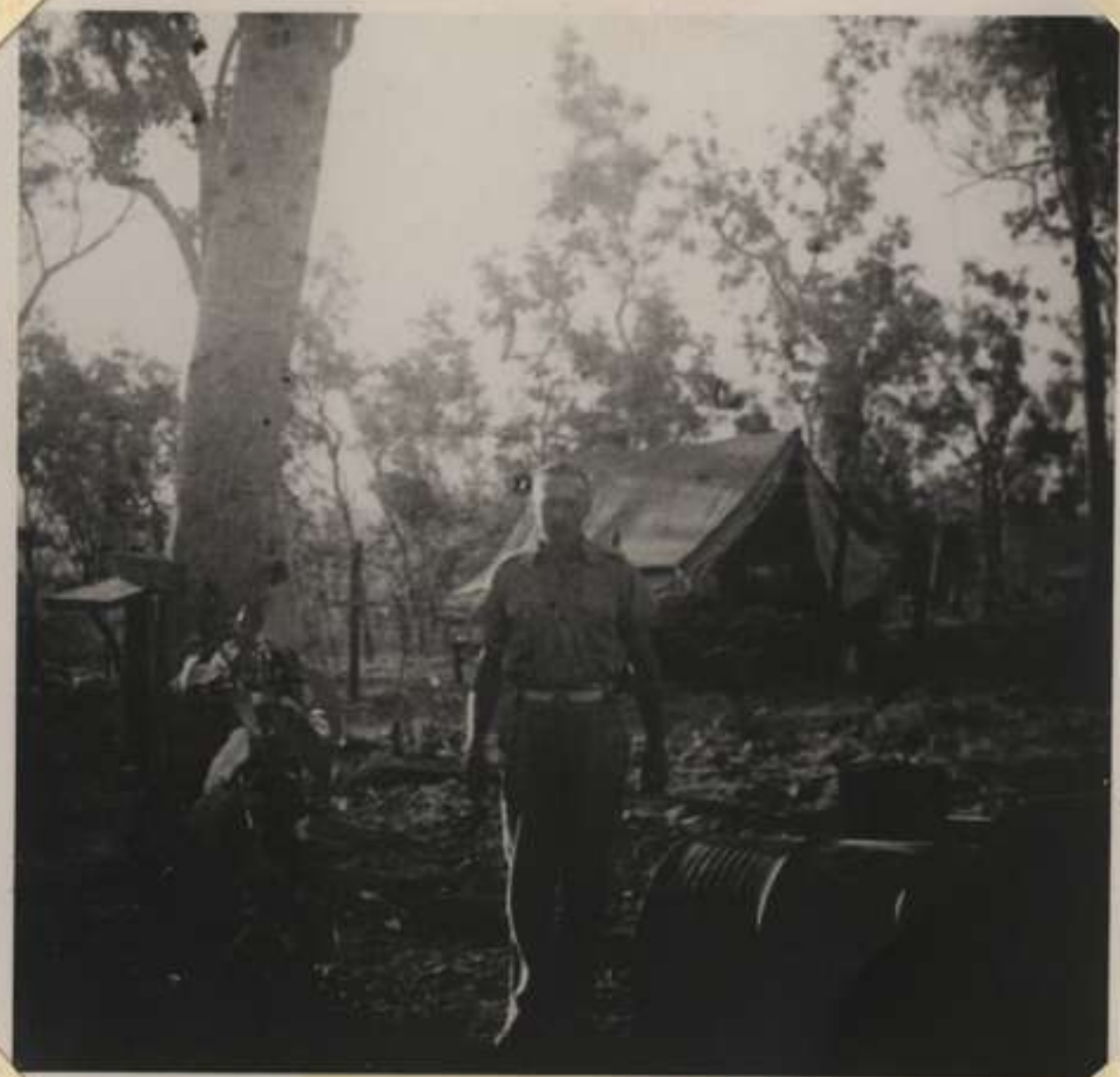
CAMP AREA 49 MILE PEG