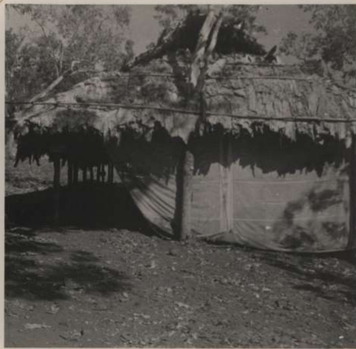
ST. GEORGES CHAPEL ~ 49 MILE PEG