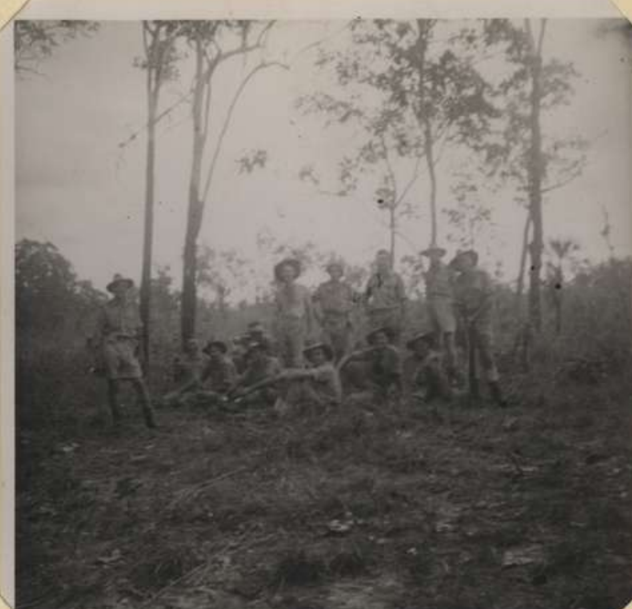
GROUP AT PIONEER CREEK