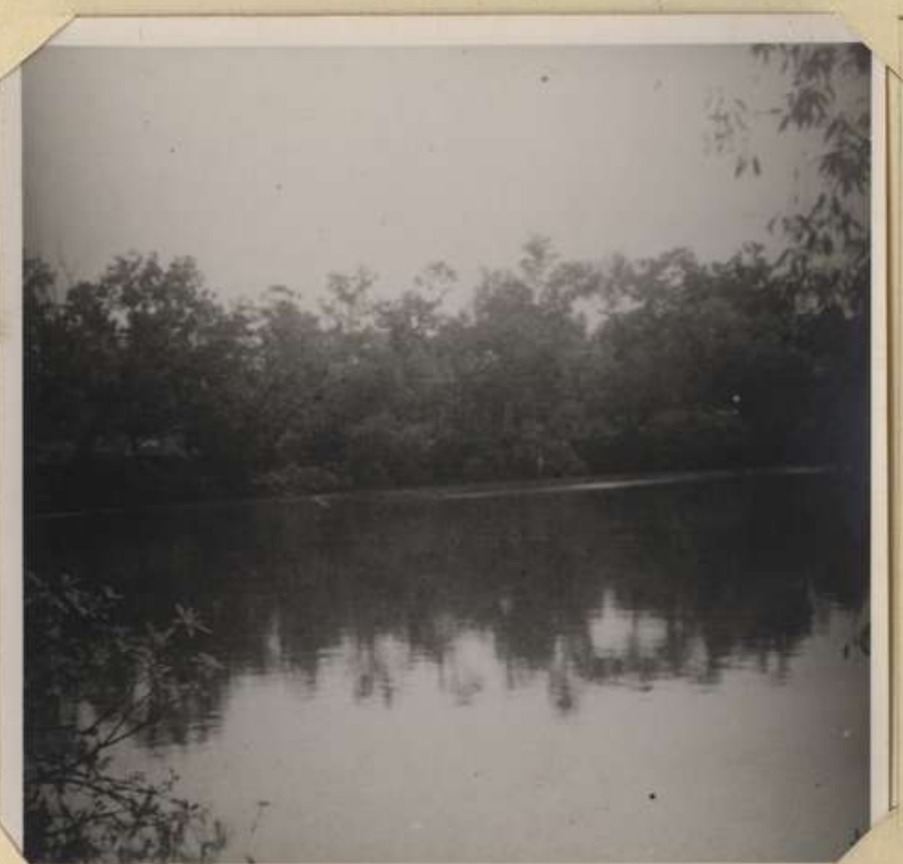
LAKE AT KOOLPINYA