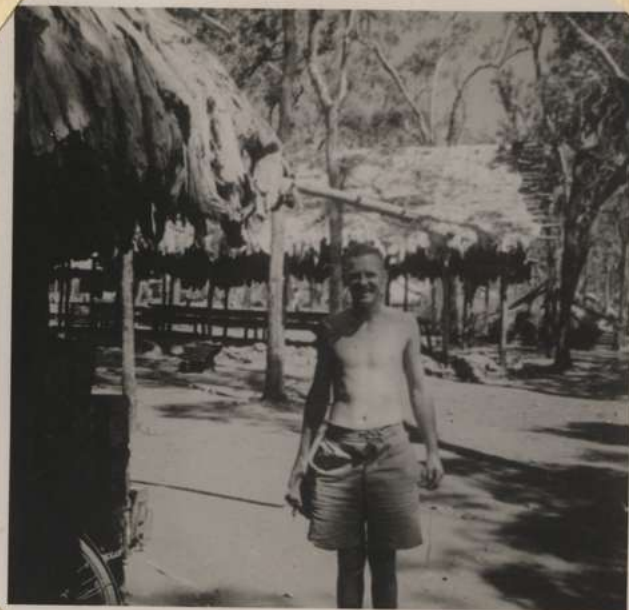
HUT , CAMP AREA 49 MILE PEG