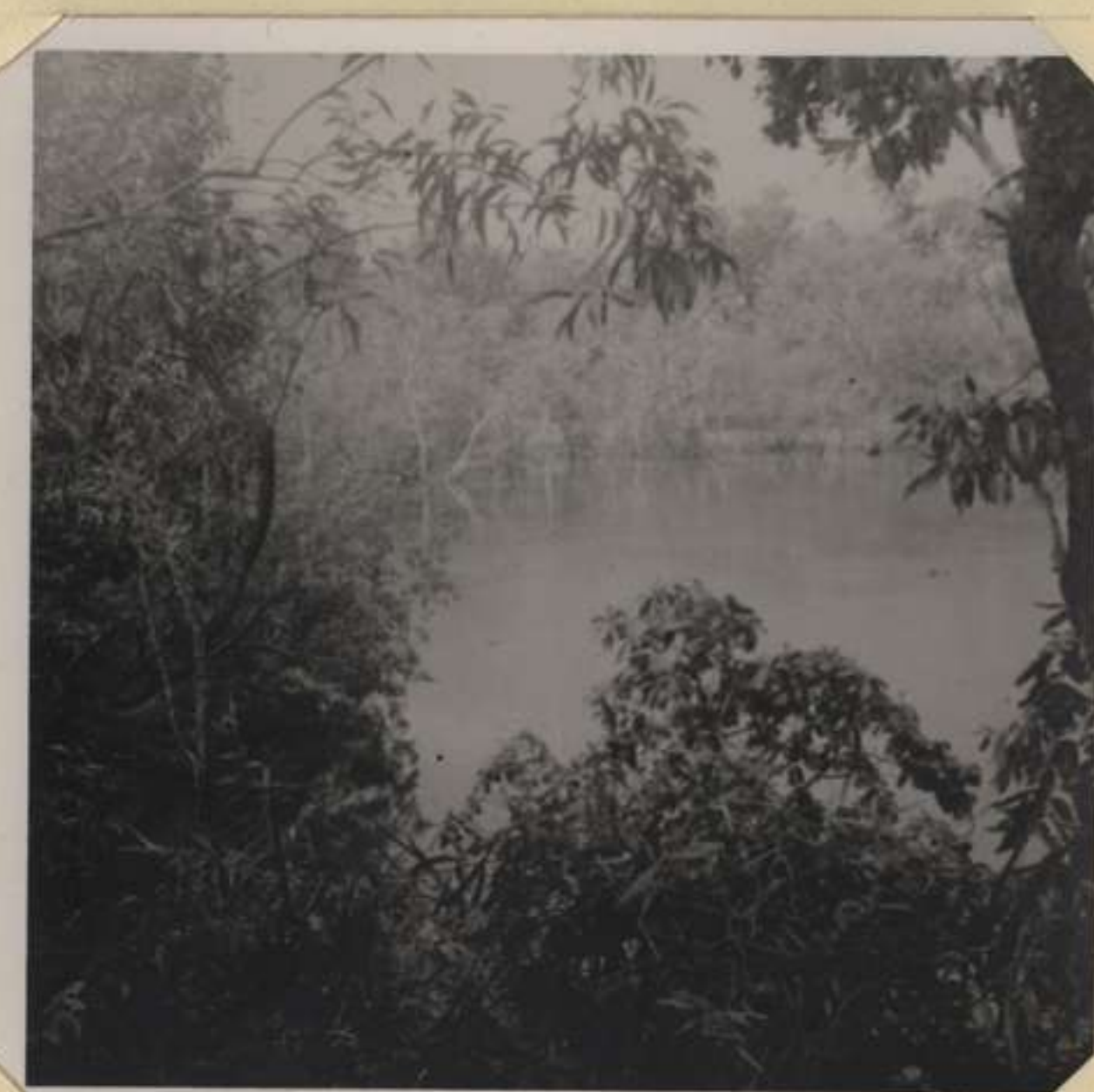
LAKE AT KOOLPINYA