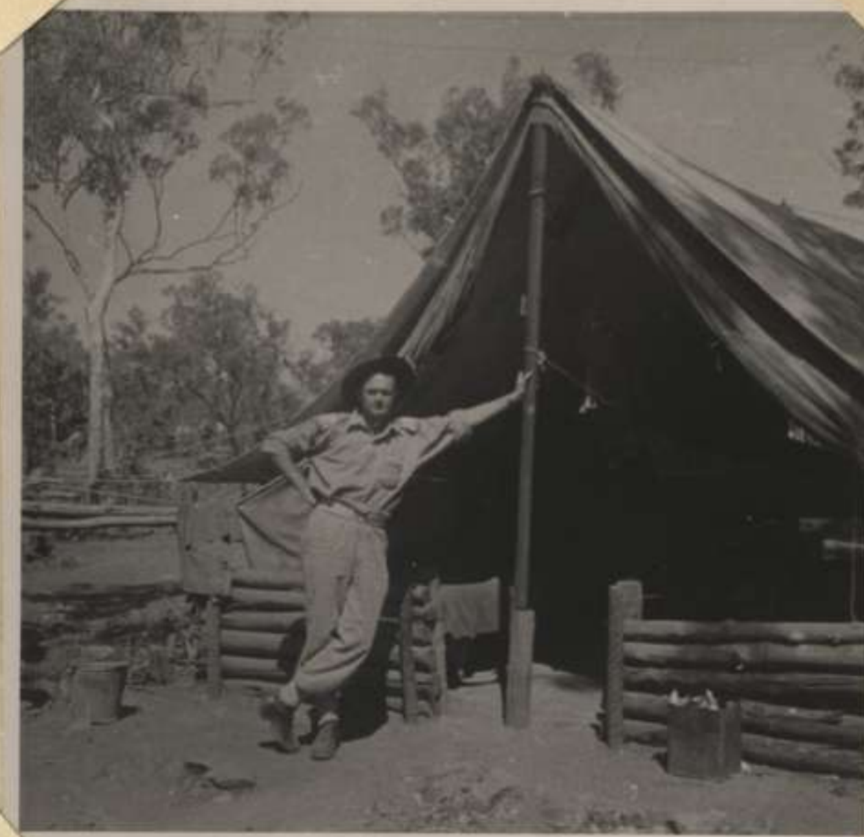
TENT ~ CAMP AREA 49 MILE PEG