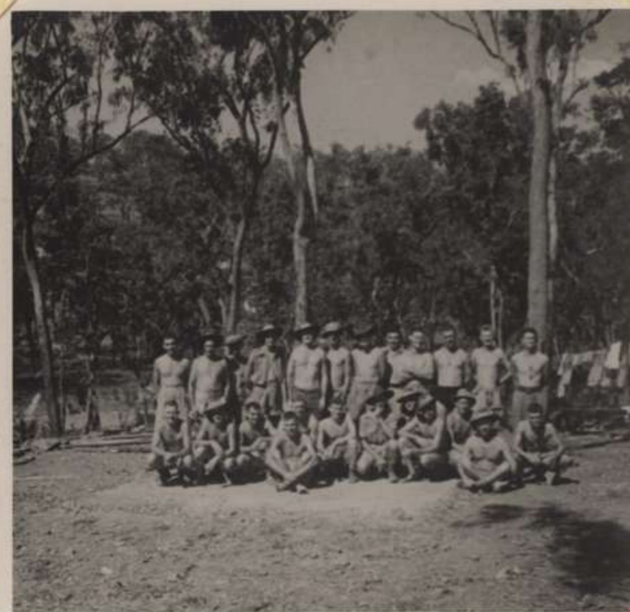
SIG PL. 49 MILE PEG