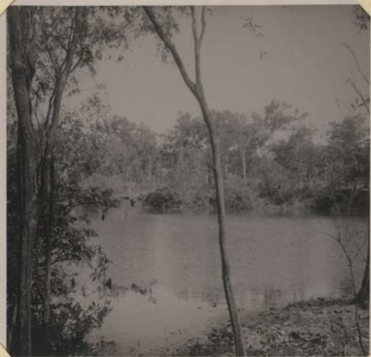
LAKE AT KOOLPINYA