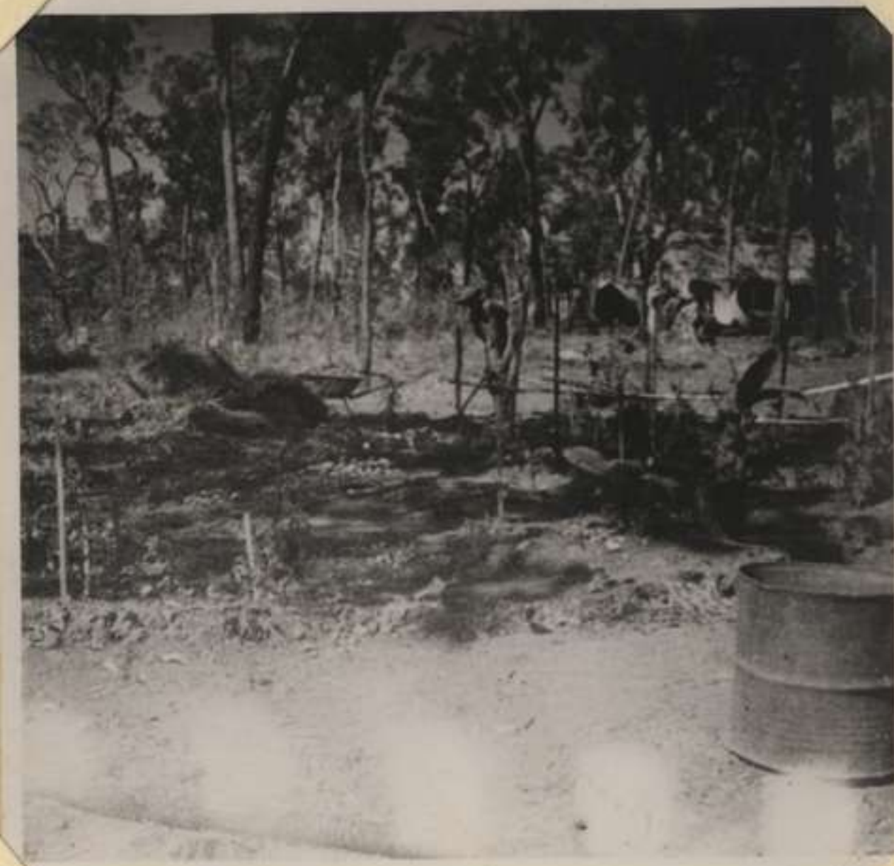
HQ. COY GARDEN 49 MILE PEG