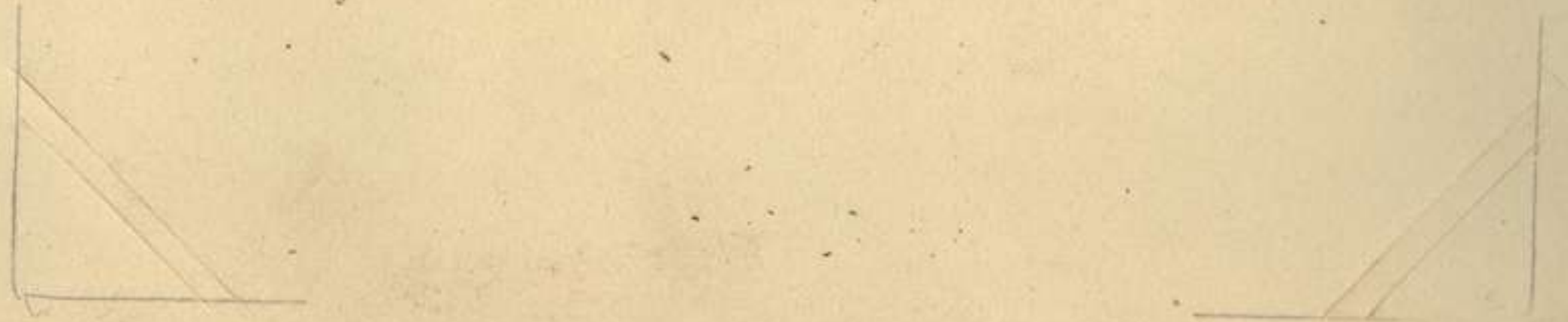
HQ. COY ORDERLEY ROOM 49 MILE CAMP