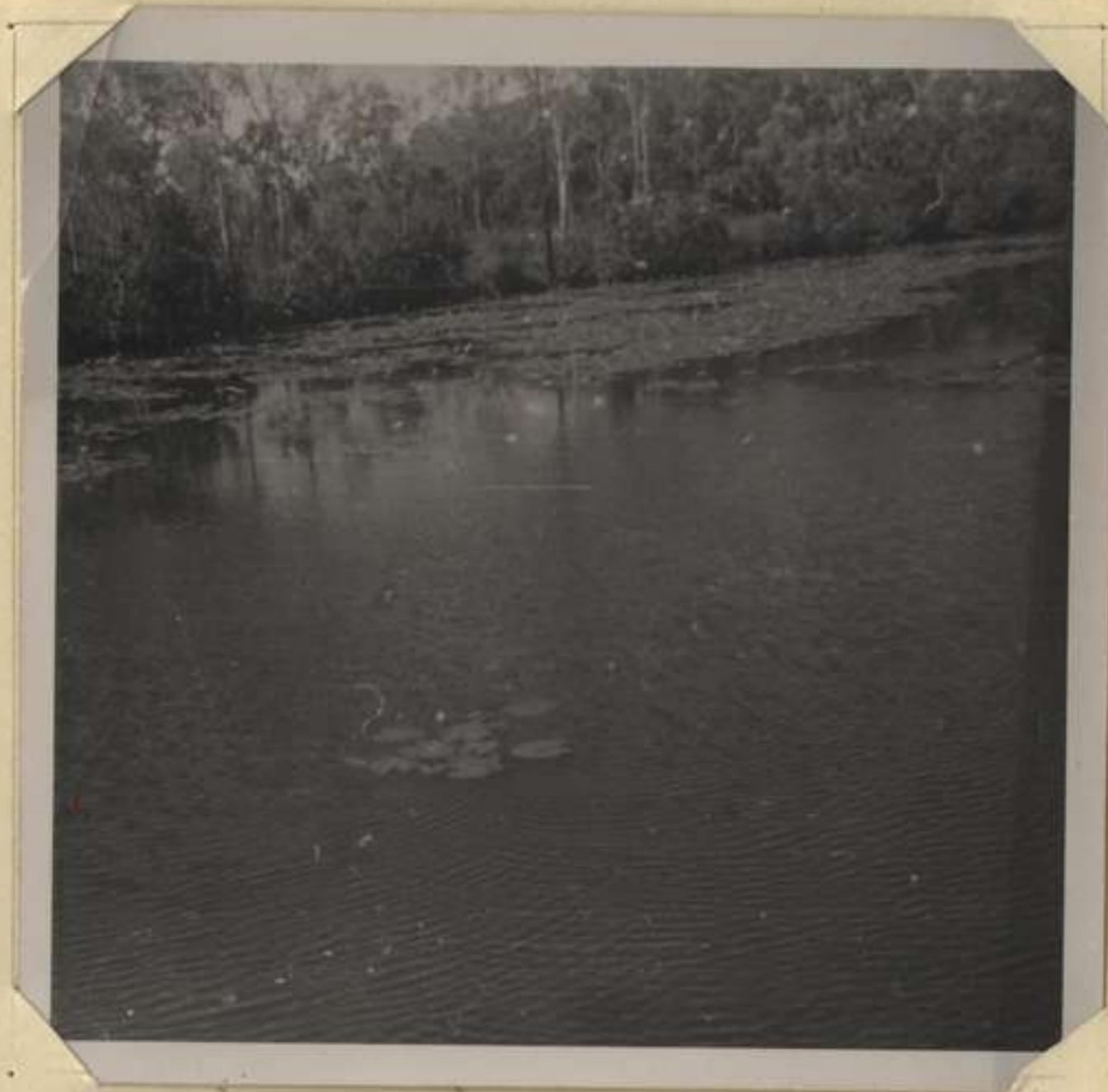
LAKE AT KOOLPINYA