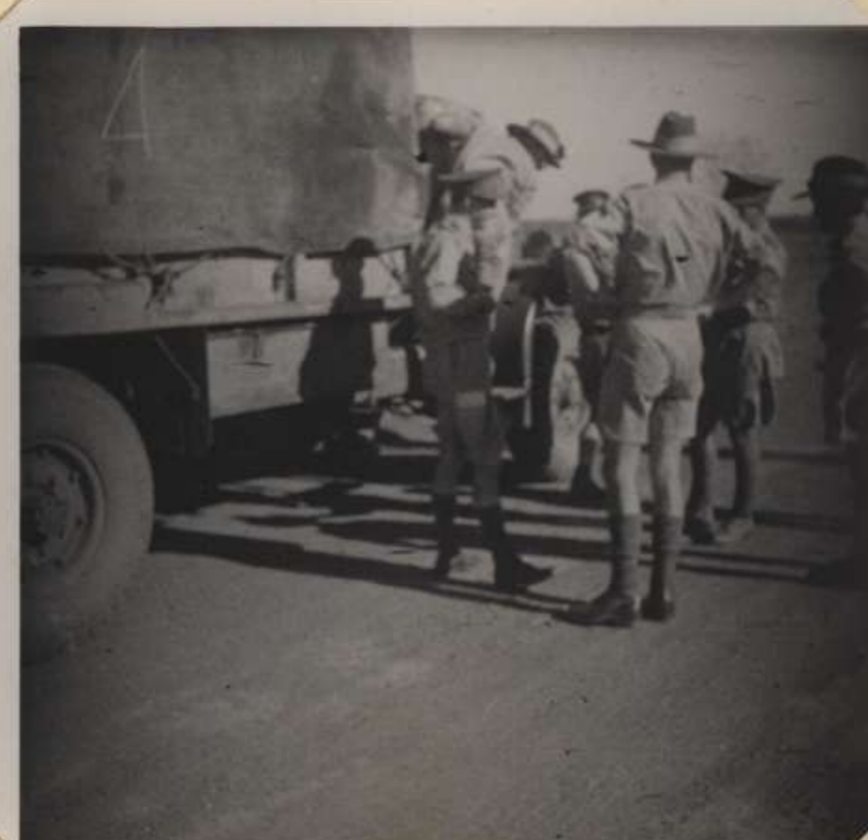
ON N.A. ROAD