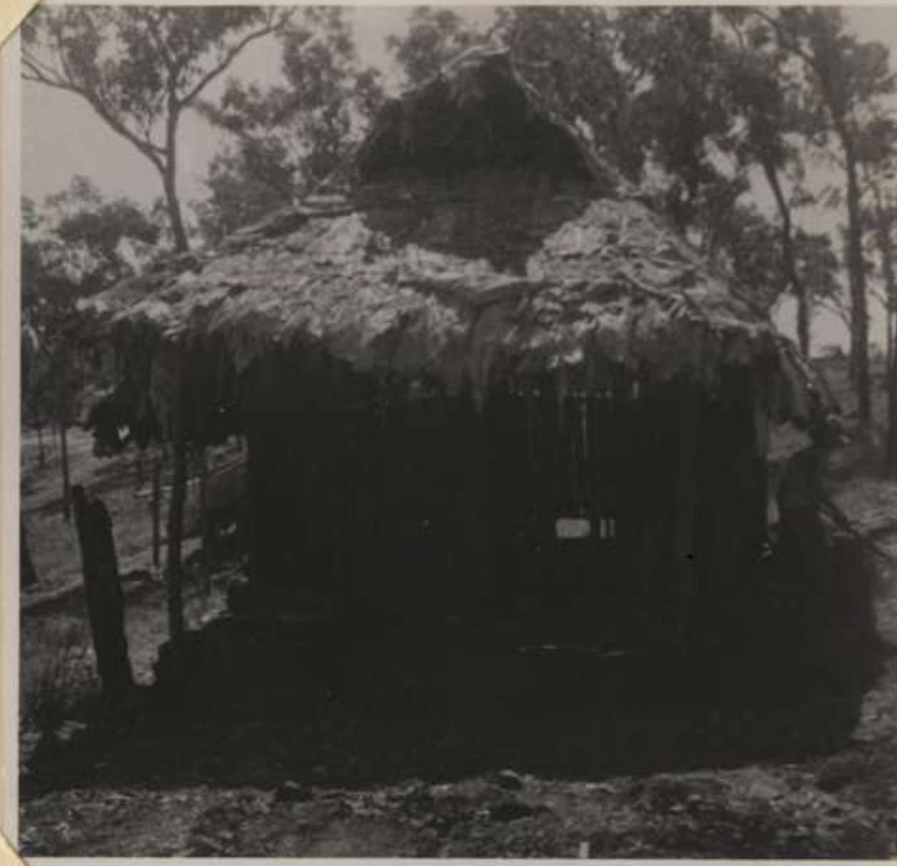
PADRE'S HUT ~ 49 MILE PEG