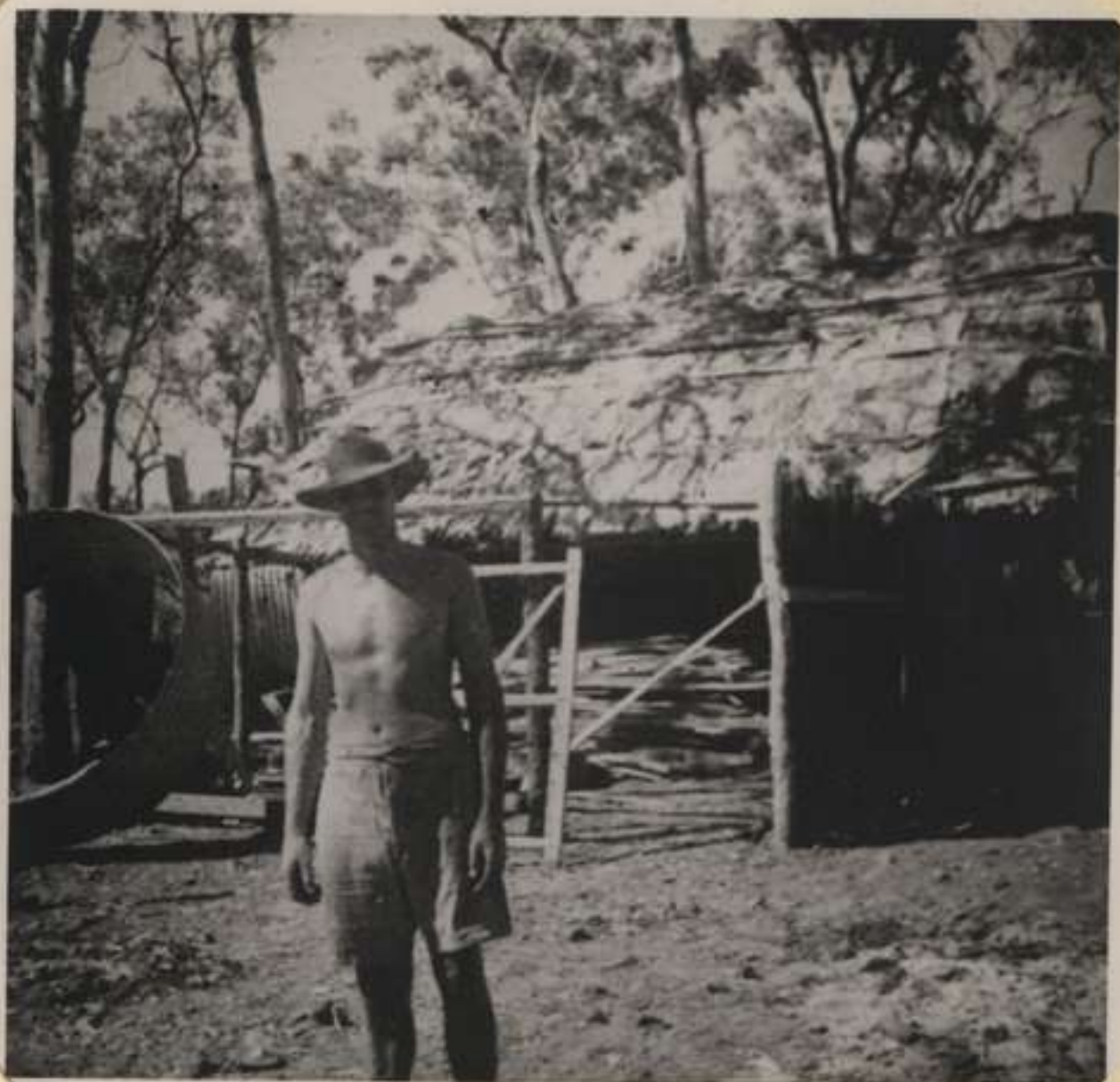
CAMP AREA ~ HUT. 49 MILE PEG