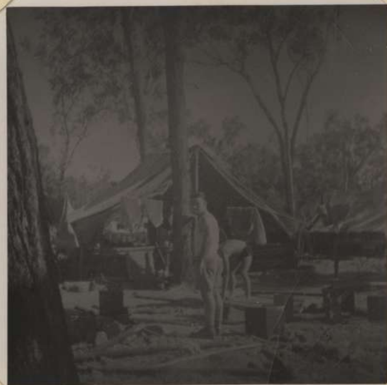
At 49 mile PEG.