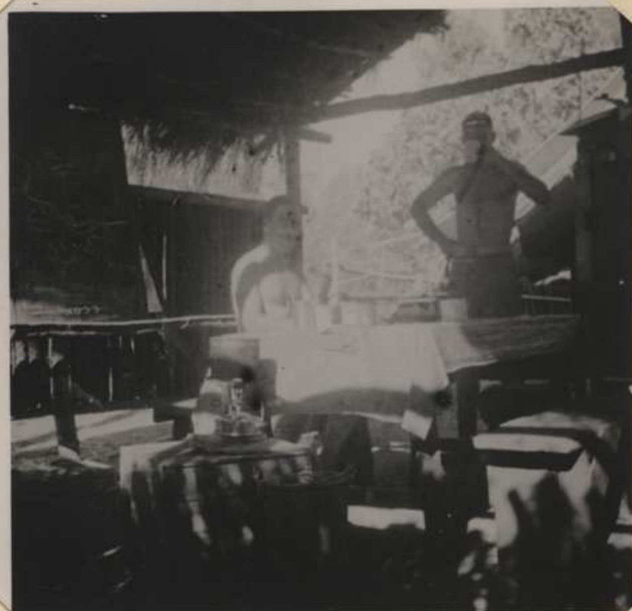
OFFERS MESS ~ C. COY. 49 MILE PEG CAMP