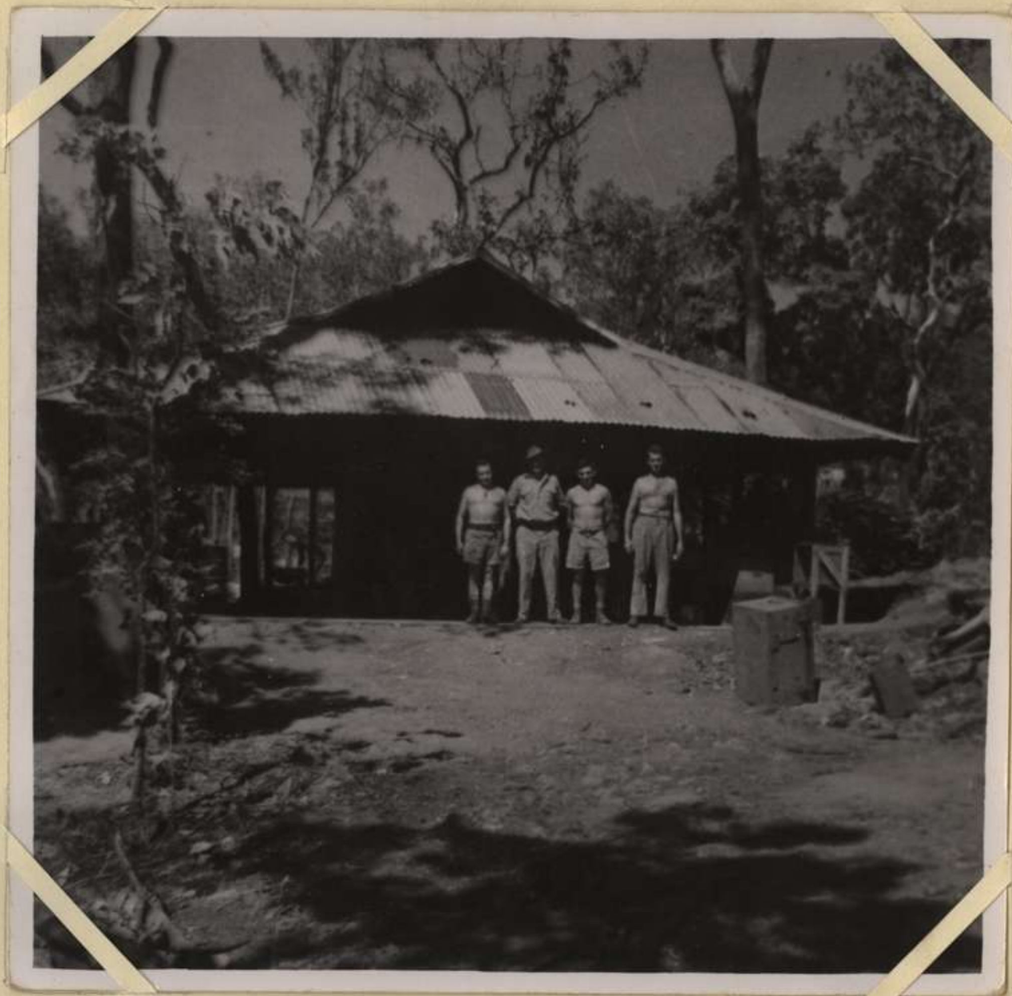
H.Q. COY KITCHEN 49 MILE CAMP