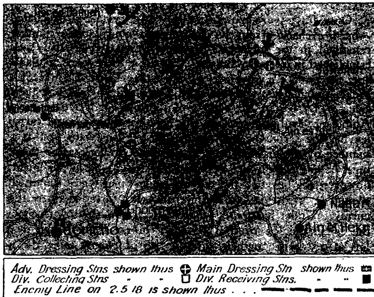
The second trans-Jordan raid, 2nd May, 1918

Brigade along the line of the Wady er Ratem from the Jordan to the hills, and by the 1st Light Horse Brigade in the hills. Its loss would have entailed the capture of the division. In the meantime the ambulances in Es Salt were becoming short of dressings, anti-tetanic serum, chloroform, sutures, and medical comforts. A stock of these was sent out on a donkey ammunition convoy, and by very fine handling it made the ascent of the Umm esh Shert pass in the dark and arrived