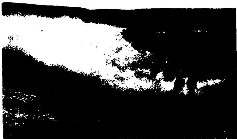
100. DUST IN THE JORDAN VALLEY