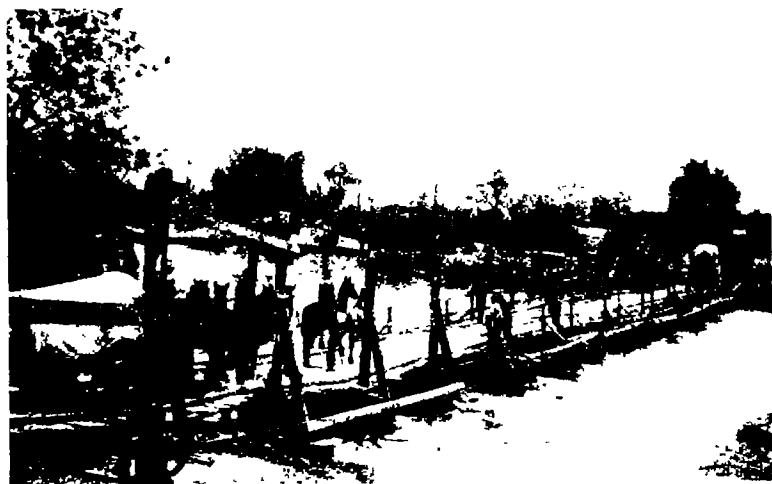
101. A LIGHT HORSE FIELD AMBULANCE CROSSING A BARREL BRIDGE AT GHORANIYEH

Aust War Memorial Official Photo No. B32