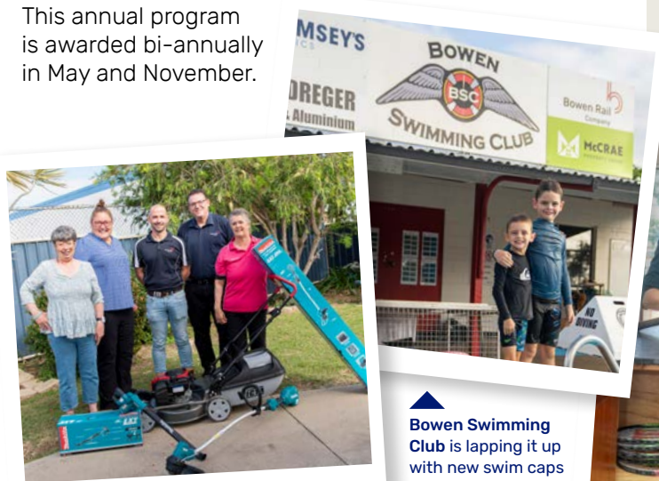
Bowen Swimming Club is lapping it up with new swim caps and paddle boards.

Bowen Flexi Care used its grant to purchase new power tools including a leaf blower, lawn mower and whipper snipper for clients to use on gardening days.