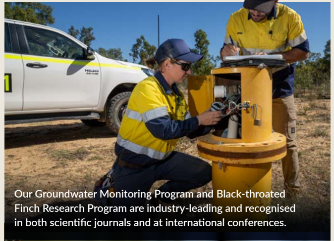
Our Groundwater Monitoring Program and Black-throated Finch Research Program are industry-leading and recognised in both scientific journals and at international conferences.

Our environmental plans and strategies were prepared by scientific experts and many of these plans were also reviewed by third-party specialists.