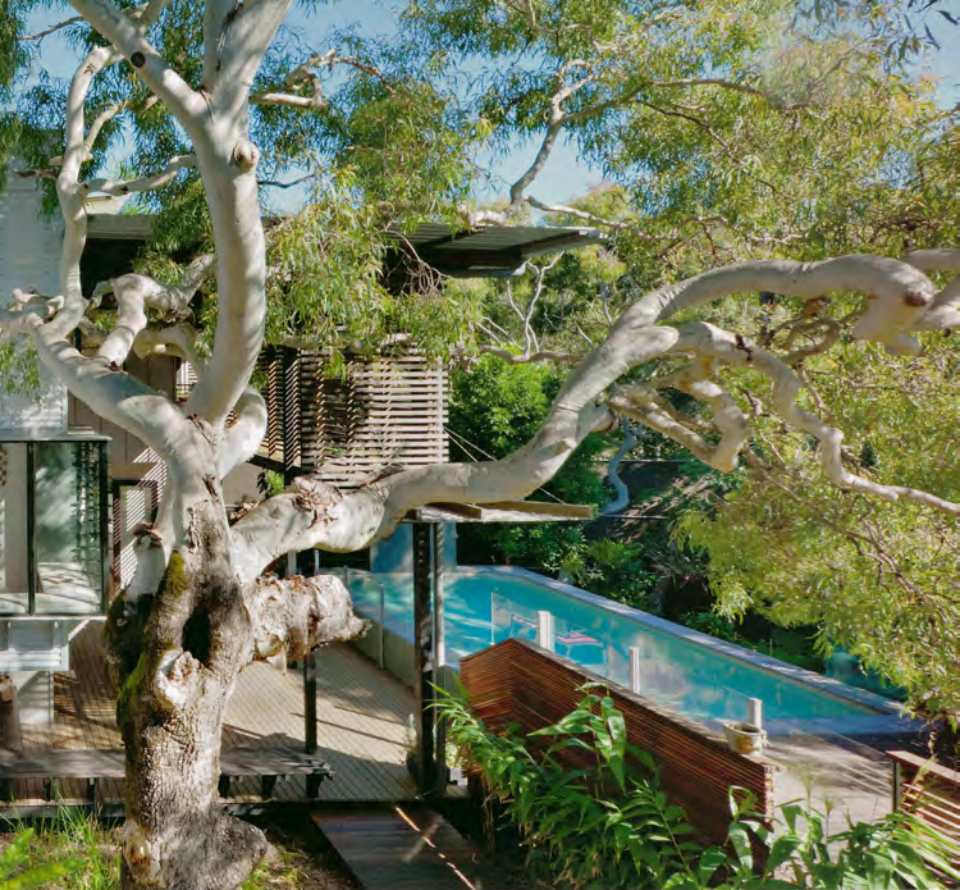
exterior view from swimming pool area