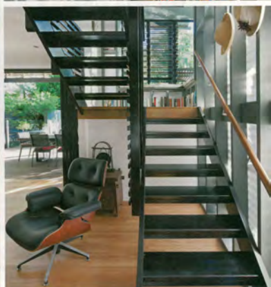
from above to below, from left to right: outdoor bench, library, staircase, elevation