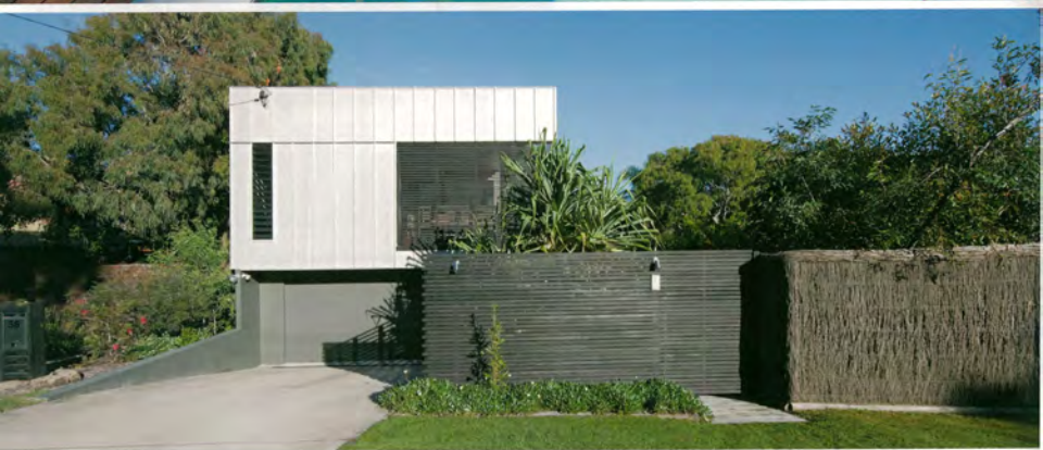
from above to below: rear view, front façade