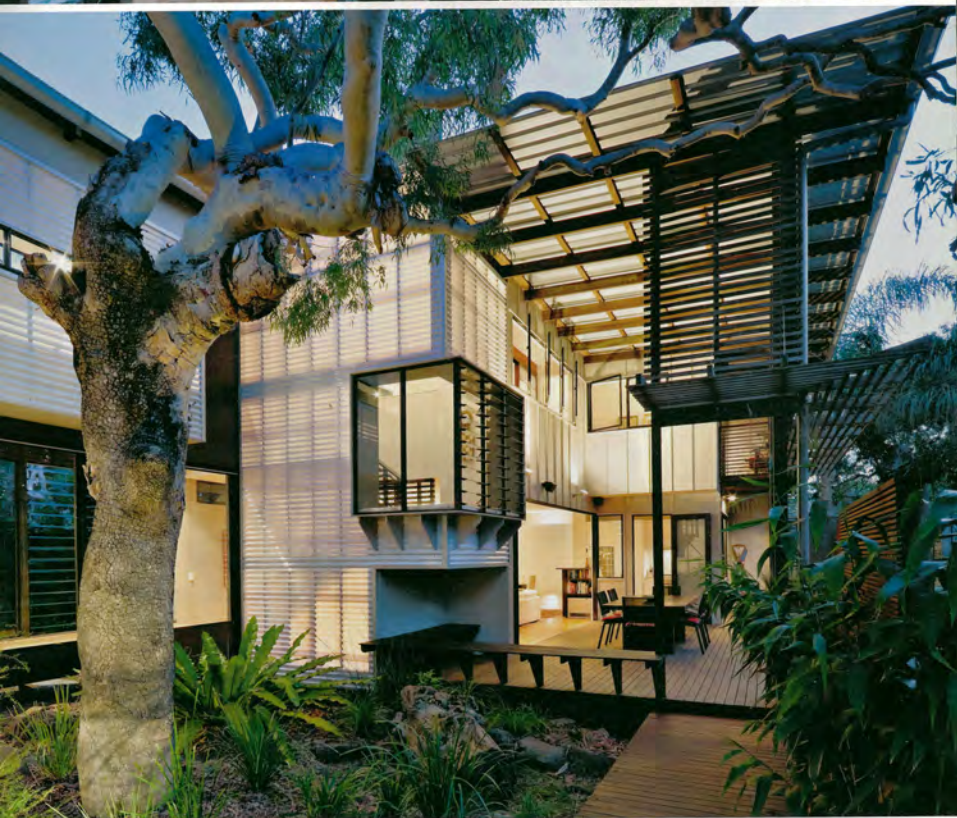
from above to below: view from corridor towards garden, layers of transparency integrating indoor-outdoor spaces