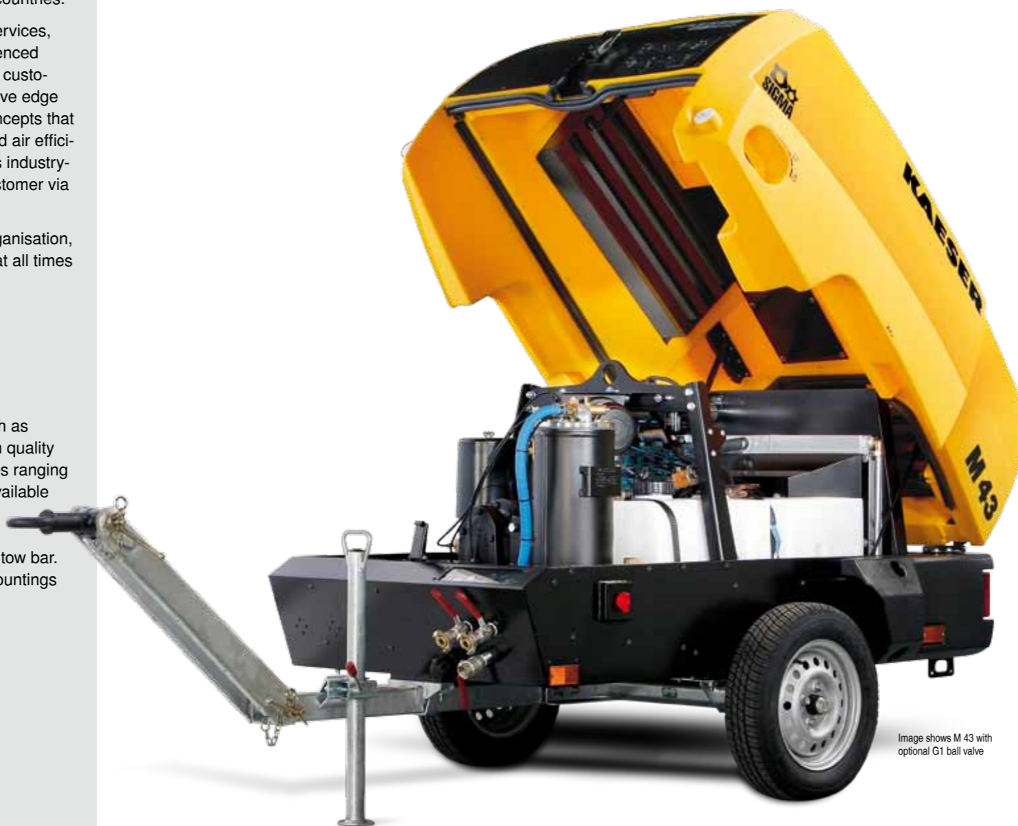
Image shows M 43 with optional G1 ball valve