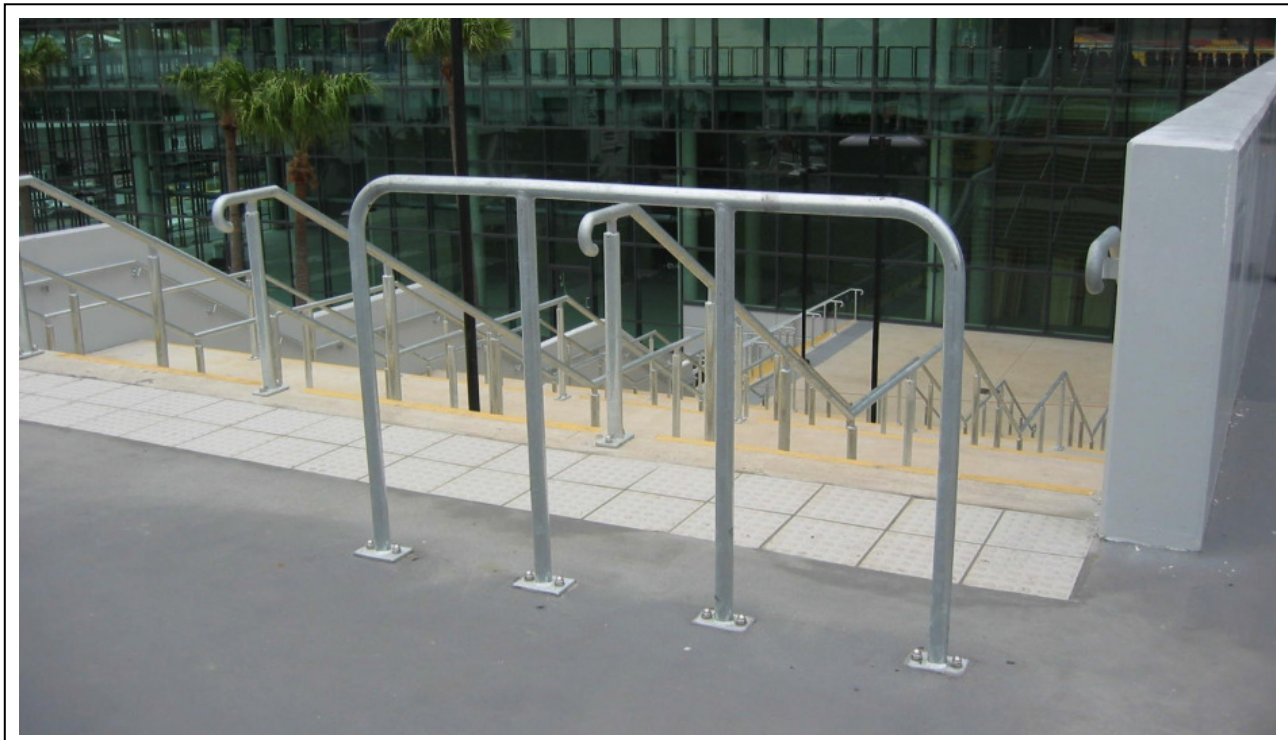
Two sets of stairs with five Galvanised Centre Handrails: