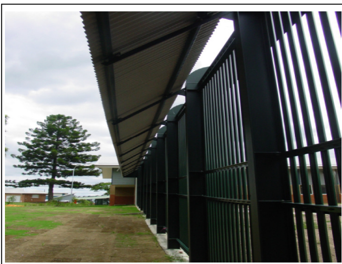
Wolsten Park Fencing with External Anti-Climb Panels:

Due to product research and development, the information contained herein is subject to change without notification