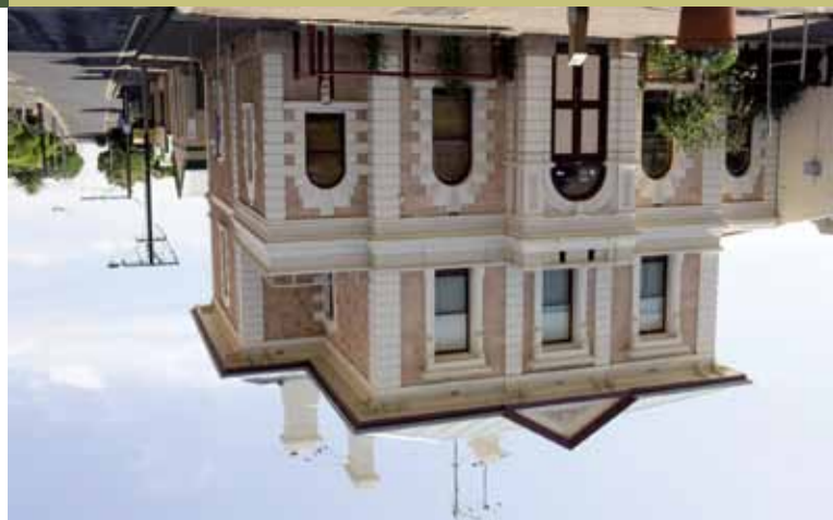
• Former Bank Premises. Above: Circa 1905. Below: Current Day