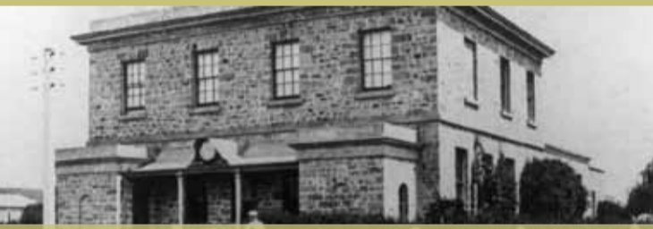
• Old Post Office. Above: 1869. Below: Current Day.