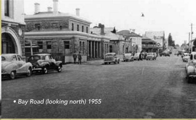
• Bay Road (looking north) 1955