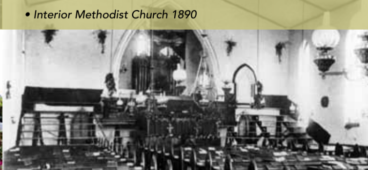
• Interior Methodist Church 1890

The City of Mount Gambier Heritage Committee was established in 1991. The Committee has an important role in advising Council on the development of policies to conserve and promote natural, built and indigenous heritage within the City of Mount Gambier.