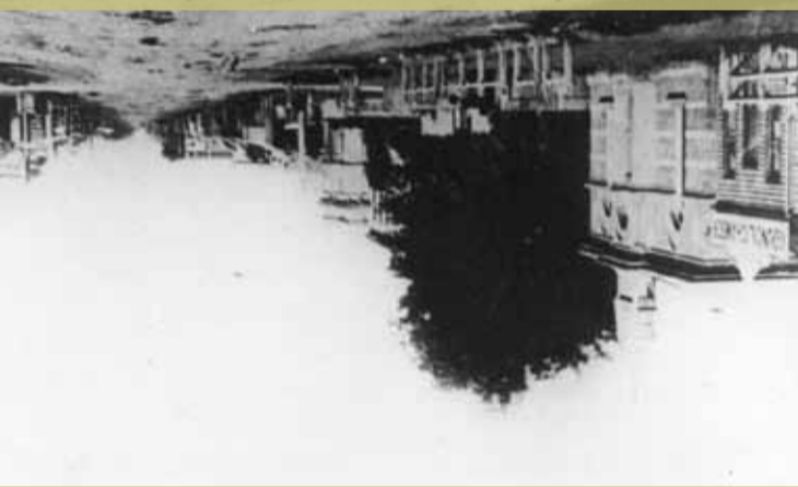
• Commercial Street (looking west from fountain) 1872