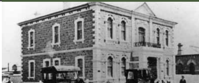
• Town Hall. Above: Without clock tower. Below: Current Day.