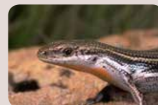
Eastern Three-lined Skink, Acritoscincus duperreyi (PR)