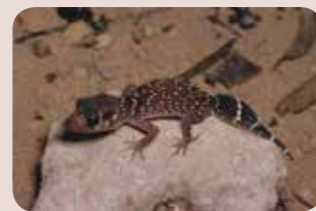
Thick-tailed Gecko, Underwoodisaurus milii (MV)