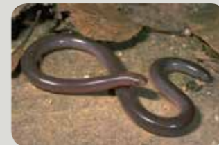
Woodland Blind Snake*, Ramphotyphlops proximus (PR)