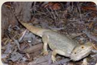
Eastern Bearded Dragon*, Pogona barbata (MV)