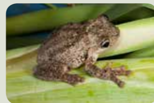
Peron's Tree Frog (Maniacal Cackle Frog), Litoria peronii (MV)