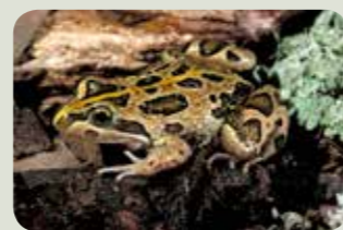
Spotted Marsh Frog, Limnodynastes tasmaniensis (PR)