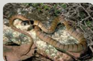
Juvenile Eastern Brown Snake, Pseudonaja textilis (PR)