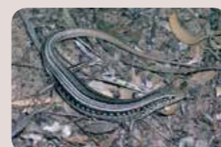
Large Striped Skink, Ctenotus robustus (MV)