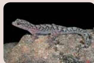
Marbled Gecko, Christinus marmoratus (PR)