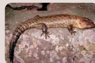
Cunningham's Skink, Egernia cunninghami (PR)