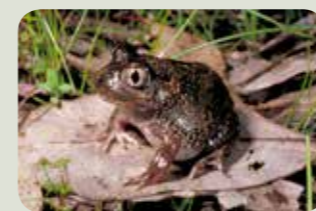
Common Spadefoot Toad, Neobatrachus sudelli (PR)