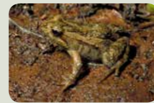
Plains Froglet, Crinia parinsignifera (PR)