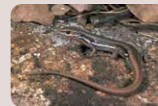
Boulenger's Skink, Morethia boulengeri (PR)