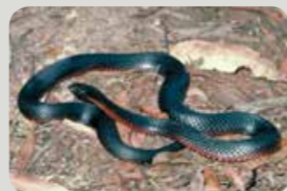
Red-bellied Black Snake, Pseudechis porphyriacus (PR)