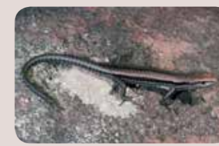
Garden Skink, Lampropholis guichenoti (PR)