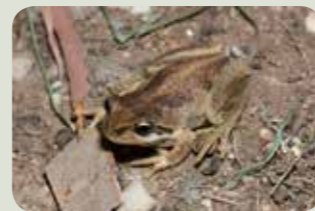
Southern Brown Tree Frog, Litoria ewingii (MV)