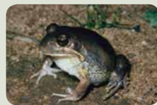
Pobblebonk (Eastern Banjo Frog), Limnodynastes dumerilii (MV)