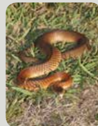
Lowland Copperhead, Austrelaps superbus (MV)