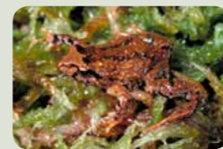
Victorian Smooth Froglet, Geocrinia victoriana