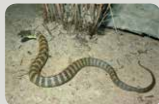
Eastern Tiger Snake, Notechis scutatus (PR)