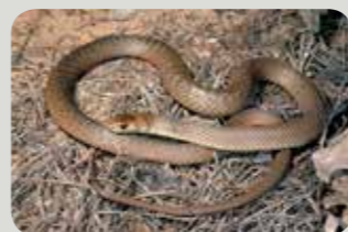
Eastern Brown Snake, Pseudonaja textilis (PR)