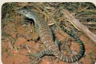
Sand Goanna, Varanus gouldii