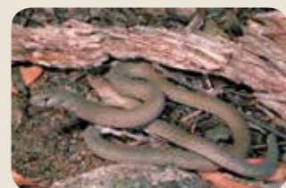
Common Scaly-foot, Pygopus lepidopodus (PR)