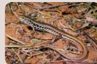
Eastern Striped Skink, Ctenotus orientalis (PR)