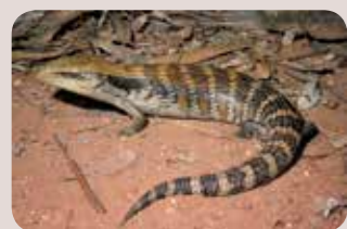
Common Blue-tongued Lizard, Tiliqua scincoides (PR)