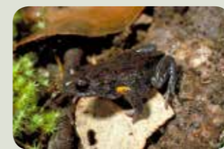
Bibron's Toadlet*, Pseudophryne bibronii (PR)