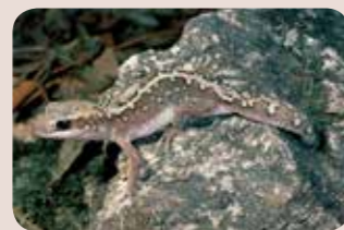
Wood Gecko, Diplodactylus vittatus (PR)