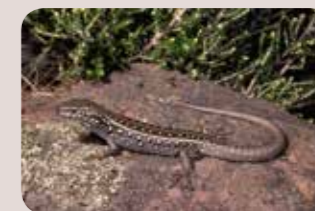
White's Skink, Liopholis whitii (PR)