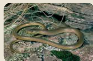
Olive Legless Lizard, Delma inornata (PR)