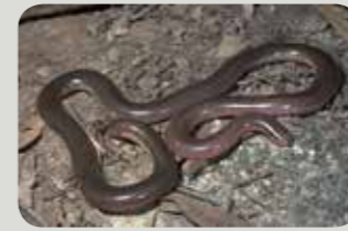
Gray's Blind Snake, Ramphotyphlops nigrescens (PR)