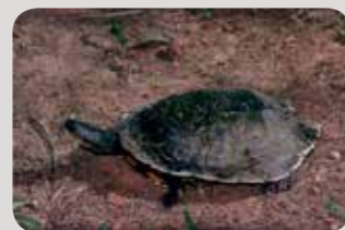
Common Long-necked Tortoise, Chelodina longicollis (MV)