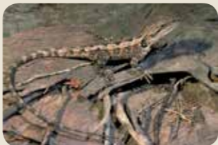
Jacky Lizard (Tree Dragon), Amphibolurus muricatus (PR)