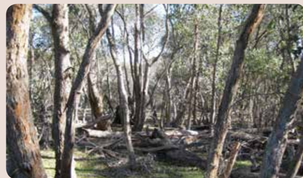
Logs on the ground create habitat for reptiles.