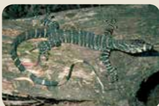
Tree Goanna (Lace Monitor)*, Varanus varius (PR)