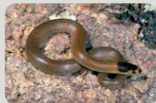
Little Whip Snake, Parasuta flagellum (PR)