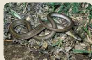
Striped Legless Lizard*, Delma impar (MV)