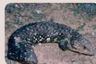
Stumpy-tailed Lizard (Shingleback), Tiliqua rugosa (MV)