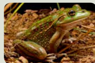
Growling Grass Frog*, Litoria raniformis (MV)