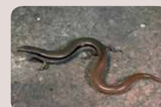
Bougainville's Skink, Lerista bougainvillii (PR)