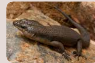
Black Rock Skink, Egernia saxatilis (MV)