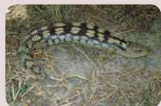
Blotched Blue-tongued Lizard, Tiliqua nigrolutea (PR)