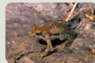
Common Froglet, Crinia signifera (PR)