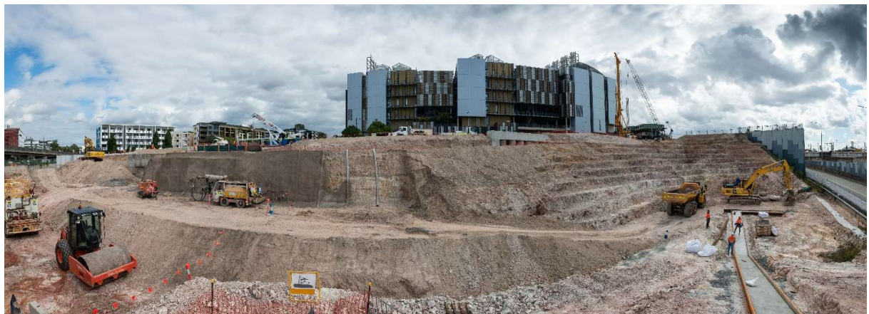
Image above showing work underway at the Boggo Road station site

Subscribing to receive Project Updates and information on construction works is a convenient way to keep up to date with the project and work happening in your area. To subscribe, simply visit the Cross River Rail website and look for the subscription area at the bottom of every page.