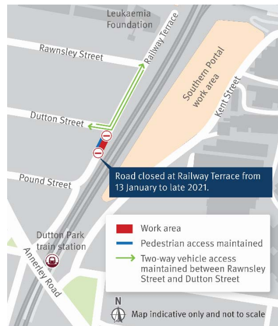
Map 1: Indicative map showing work area and traffic changes