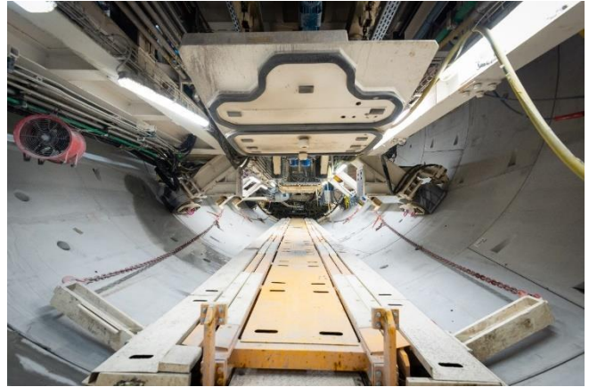
Image 2 Segment feeder (bottom) and segment crane (top) which deliver the tunnel segments to the ring build area