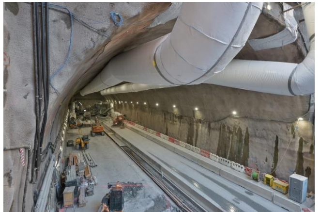
Image 4 Inside the southern cavern where roadheaders are currently tunnelling