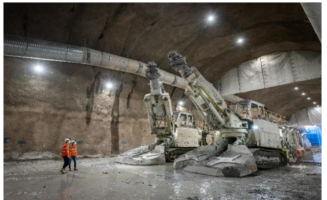
Image 6 Two roadheaders currently tunnelling south to Boggo Road