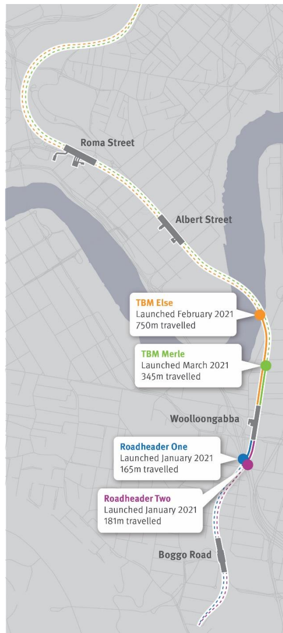
Figure 1 Progress map of all tunnelling as at 27 April 2021

Track the TBMs and roadheaders by following this QR code!