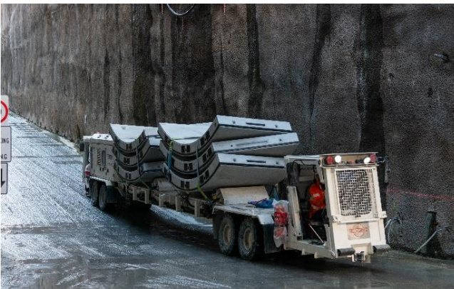
Image 5 Tunnel segments being delivered to the TBM