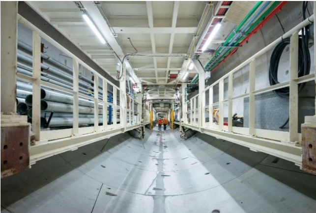
Image 1 TBM 1 Else - inside the TBM