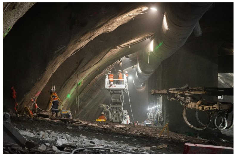
Preparing to concrete the walls of the new station cavern.