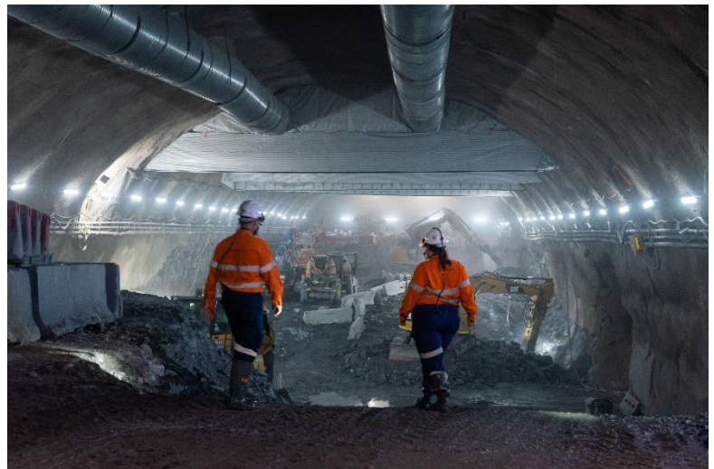
View of the new underground station cavern beneath the existing Roma Street station.