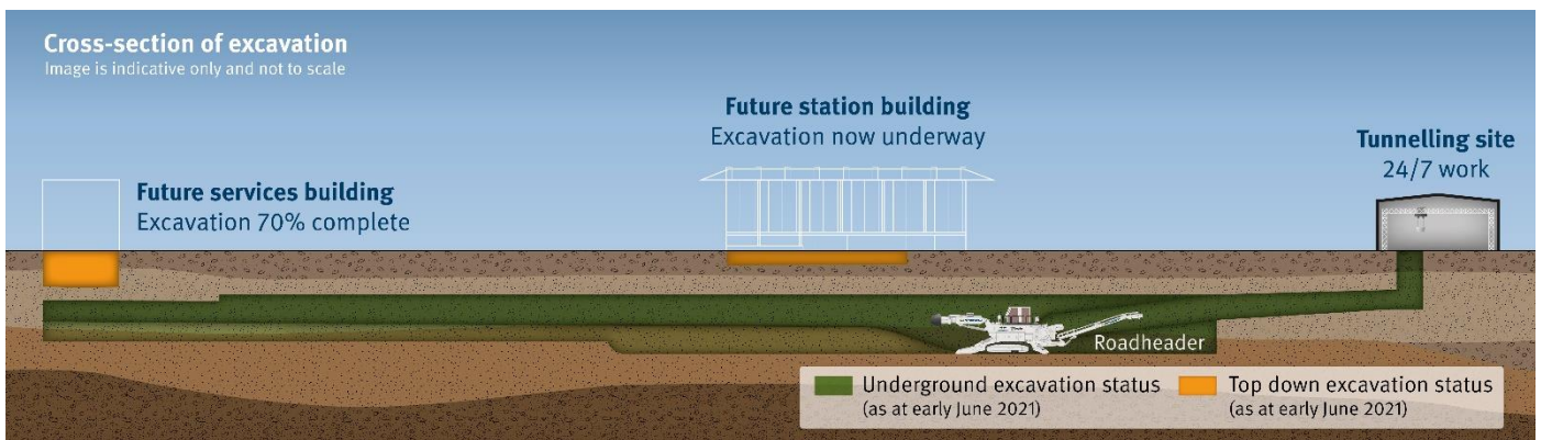
Excavation progress at the Roma Street station construction site

Our underground team reached a milestone in May, having now excavated the entire 280m length of the underground cavern. We will now focus on removing the bottom section of the station cavern, also known as the bench, before the Tunnel Boring Machines (TBMs) arrive in the coming months.